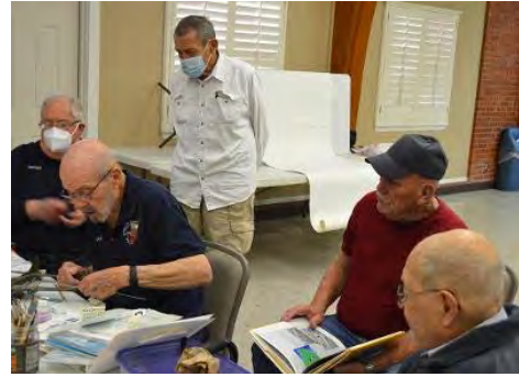
Some of the membership watching how not to apply decals.