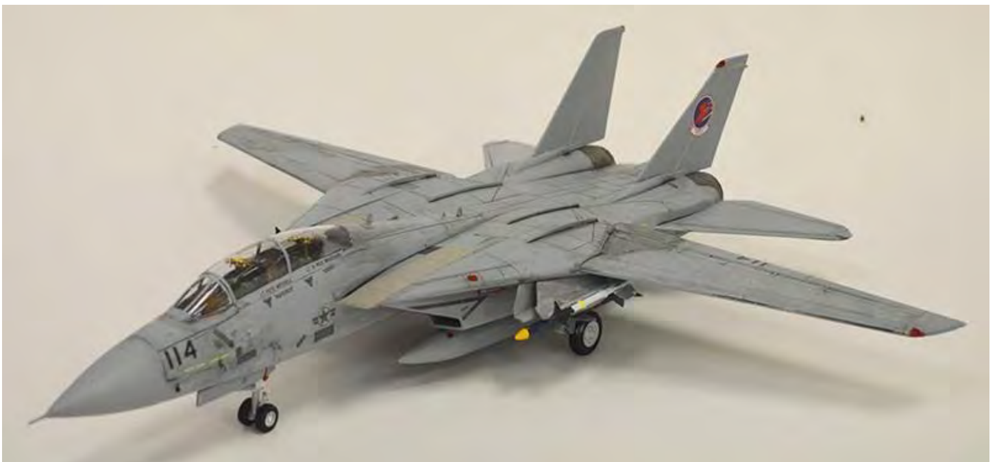
Richard Macias's F-14A Tomcat

Arthur Berdick brought four models to be photographed. Two were Model T type vehicles, one a fire truck, the other a passenger touring car. Both were built from ICM kits and were in 1/24 th scale. His other two models were armor kits in 1/35 th scale., one a Russian Light Tank and the other a Takam kit of the Bergpanzer 2A2.