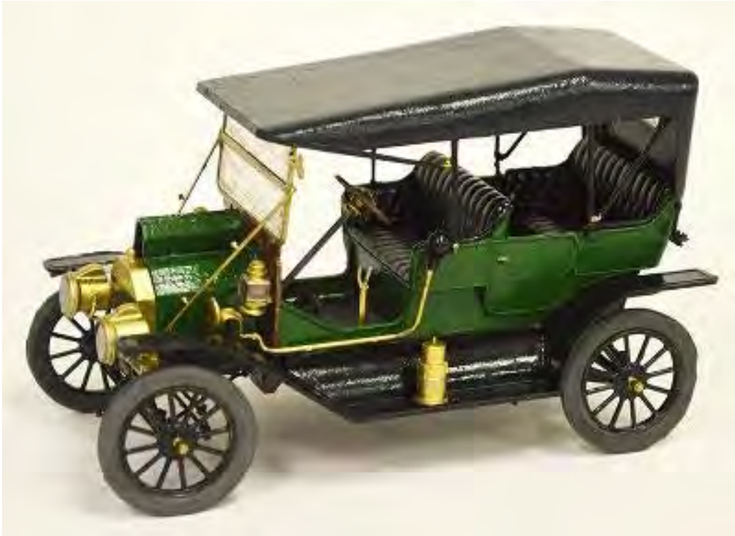
Authur Berdick's Model T Passenger Car

Arthur Berdick brought four models to be photographed. Two were Model T type vehicles, one a fire truck, the other a passenger touring car. Both were built from ICM kits and were in 1/24 th scale. His other two models were armor kits in 1/35 th scale., one a Russian Light Tank and the other a Takam kit of the Bergpanzer 2A2.