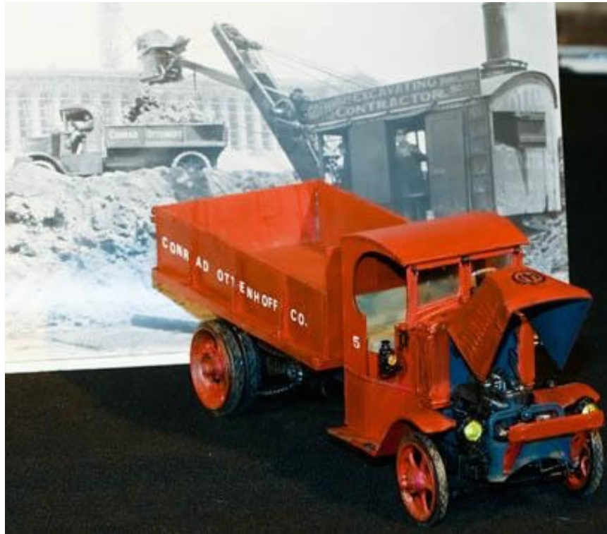
Art Berdick's Mack Truck