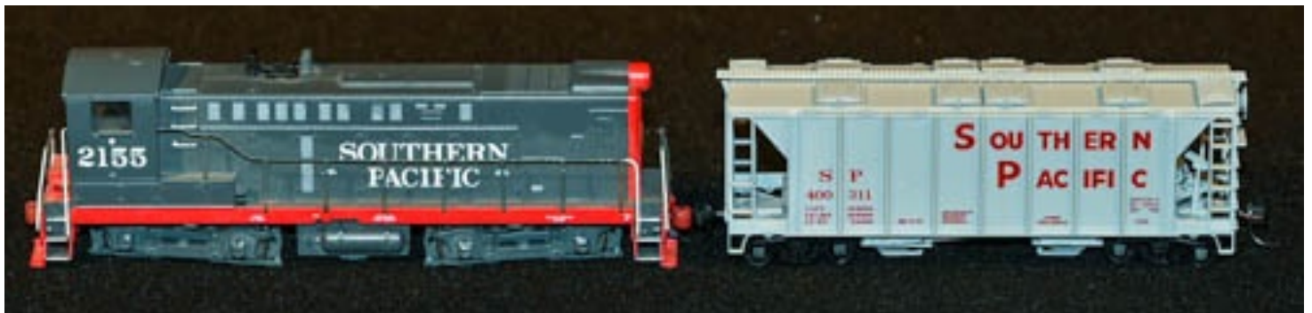
Roger Gutierrez's SP engine and 70-ton Bay Hopper