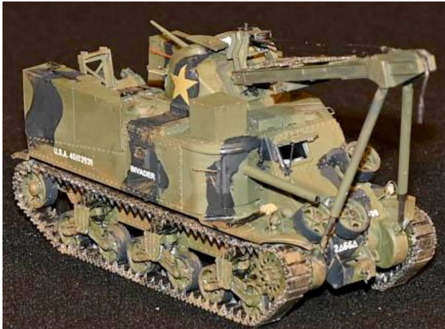
Art Berdick's M31 Tank Recovery Vehicle