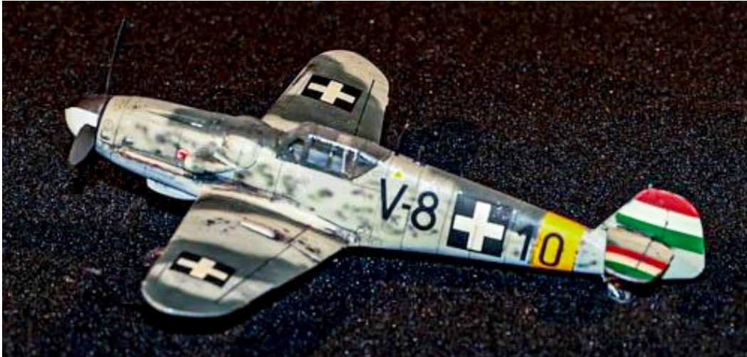
Me 109 in Hungarian Markings