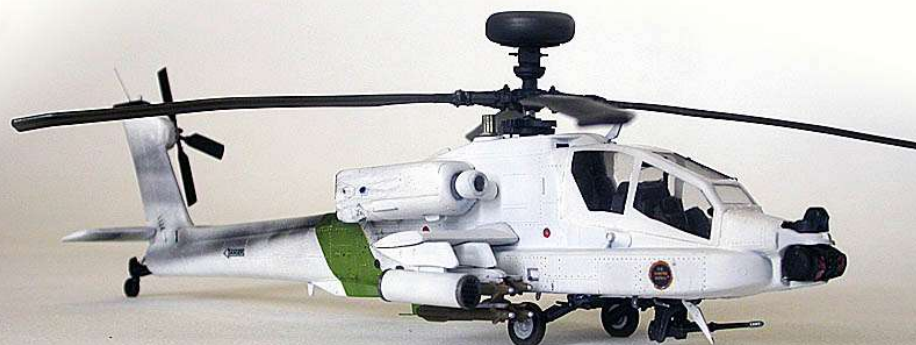
Gus Gonzalez - 1/72 AH-64 Apache

might be a little politically incorrect, but it looked really neat.