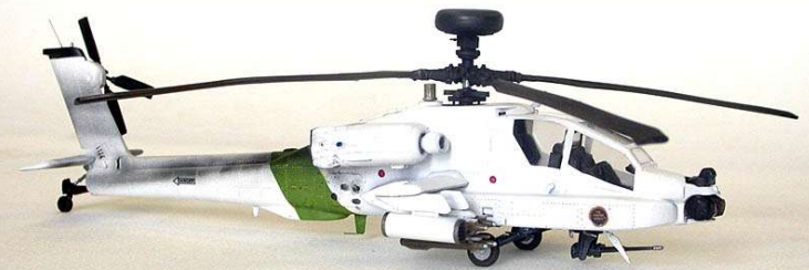
Gus Gonzalez - 1/72 AH-64 Apache