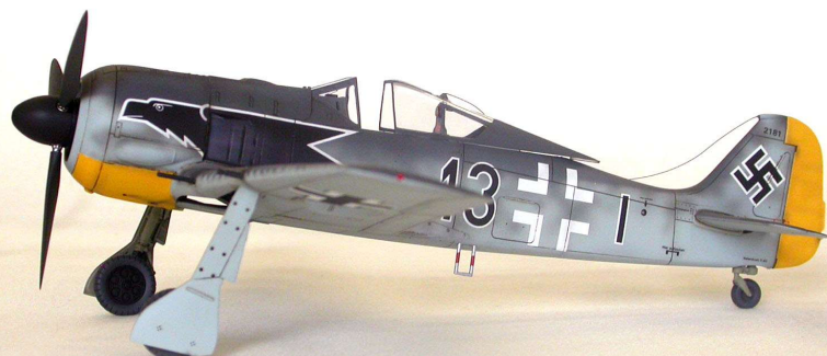
Fw190A-3 in 1/48 by Fabian Nevarez