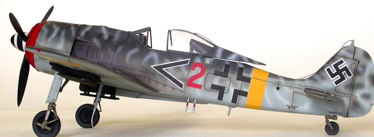
Fw190F-8 in 1/48 by Fabian Nevarez