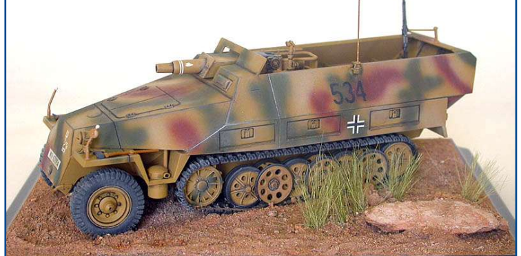
Gary Boggs 1/35th scale SDKFZ 251/9 half-track