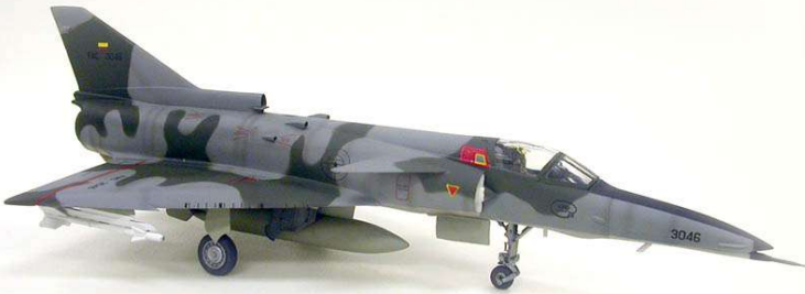
Gervasio Damboriarena - 1/48 Kfir C-2