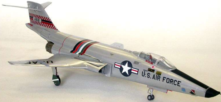
RF-101 VooDoo