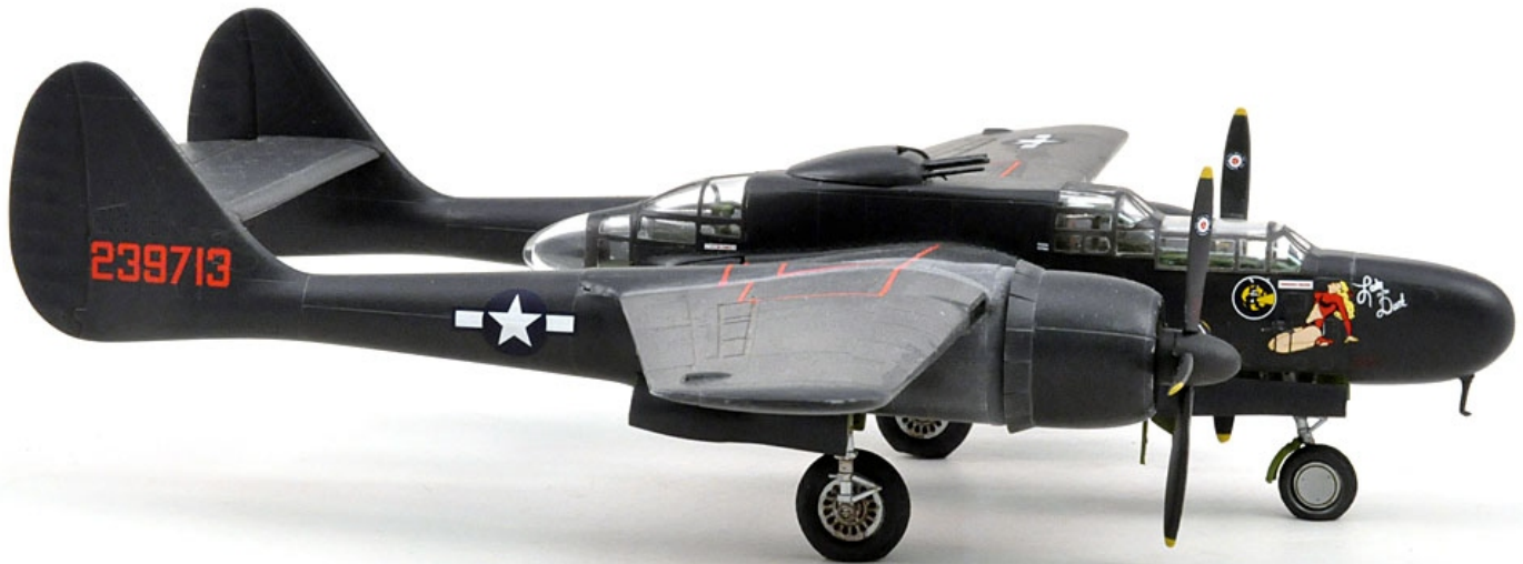
Mike King's P-61A Black Widow in 1/72nd scale

packages for the Nationals this summer. We will sponsor the following categories: 032 Teen level entries Figures, 152 Rotary Wing, 1/48 and 1/32 scales, and 311 Mounted figures.