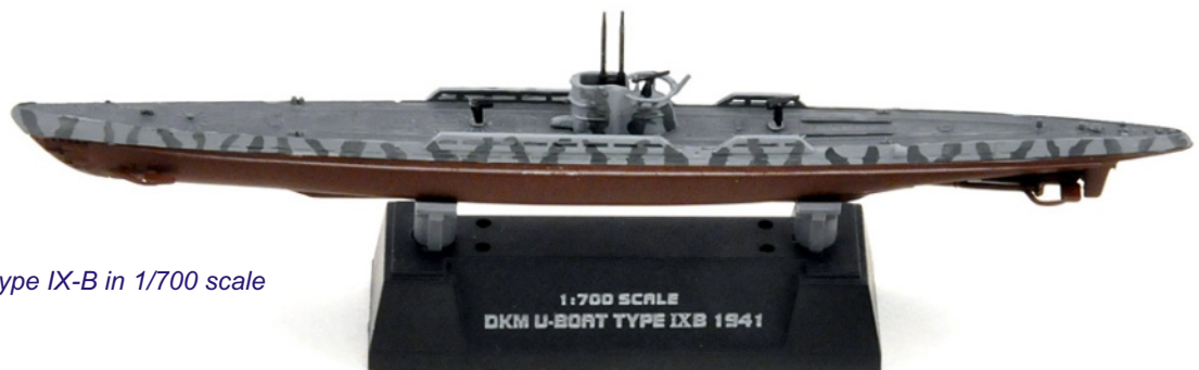
Charlie Flores' U-boat type IX-B in 1/700 scale

Michael Garcia had a Revell 1/350th scale Type VII D mine laying U-Boat that looked really nice. This will be added to his 1/350th scale ship collection. Well done.