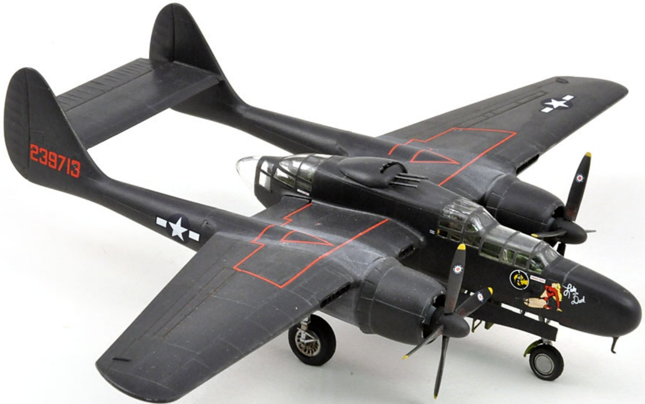
Mike King's excellent DML P-61A Black Widow in 1/72nd scale