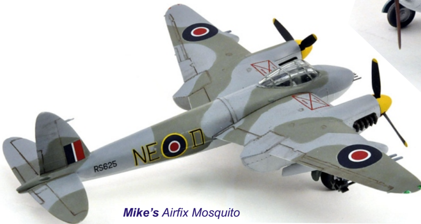
Mike's Airfix Mosquito

MiG 3, snap title kit. I was not even aware of such kit, but it builds up really nice. His Airfix(MPC release) of a Coastal Command DeHaviland Mosquito was an interesting variation of an older kit. Then he went to Hasagawa for a Ki-44 "Tojo" for a Japanese Army type. He followed this with a D3A-1 "Val" built from the Fujimi kit. He marked this as the "Red Wild Horse" aircraft used in the Pearl Harbor attack on December 7, 1941. His last effort was DML P-61A Black Widow marked as the famous "Lady in the Dark." All of these were in 1/72nd scale.