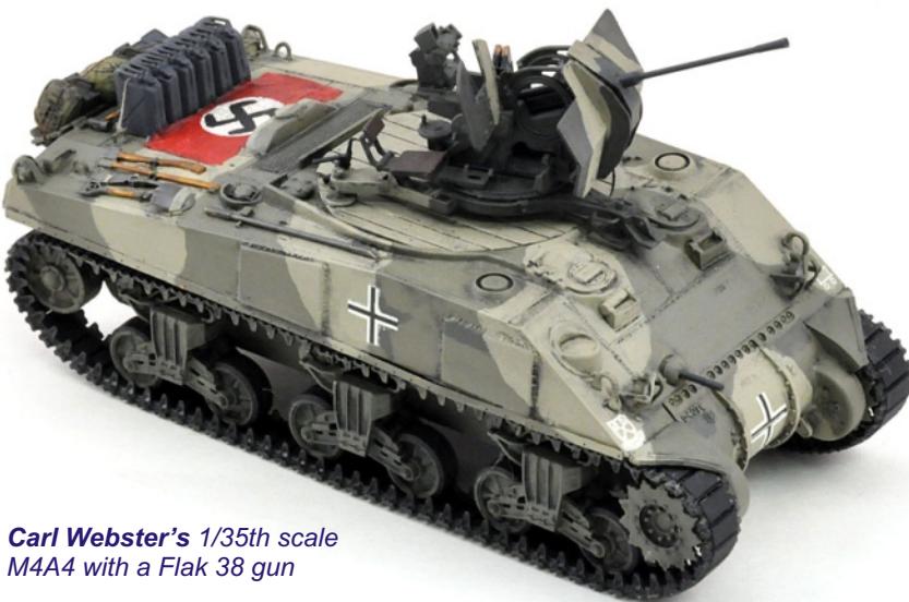
Carl Webster's 1/35th scale M4A4 with a Flak 38 gun

Carl Webster , one of our tread heads brought a number of armor models to show. He had an M4A4 mounted with a Flak 38 in German markings, a wee bit unusual. He used the Verlinden M4A4 resin hull,