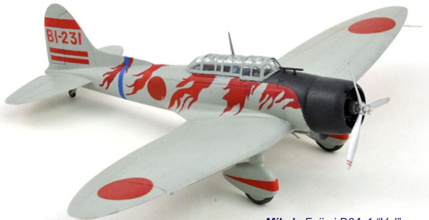
Mike's Fujimi D3A-1 "Val"

MiG 3, snap title kit. I was not even aware of such kit, but it builds up really nice. His Airfix(MPC release) of a Coastal Command DeHaviland Mosquito was an interesting variation of an older kit. Then he went to Hasagawa for a Ki-44 "Tojo" for a Japanese Army type. He followed this with a D3A-1 "Val" built from the Fujimi kit. He marked this as the "Red Wild Horse" aircraft used in the Pearl Harbor attack on December 7, 1941. His last effort was DML P-61A Black Widow marked as the famous "Lady in the Dark." All of these were in 1/72nd scale.