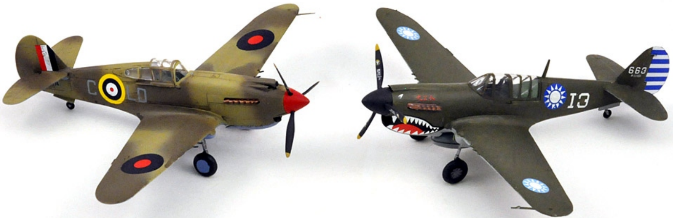
Charlie Flores' P-40 B/C Hawk 81 and P-40N Warhawk in 1/72nd scale.