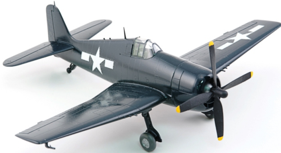
The F6F-6 Hellcat

El Paso Scale Model Society October 2011