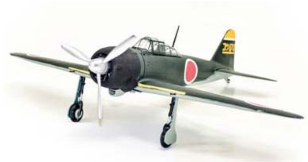
Century 21 1/32 nd scale by Jose Patino