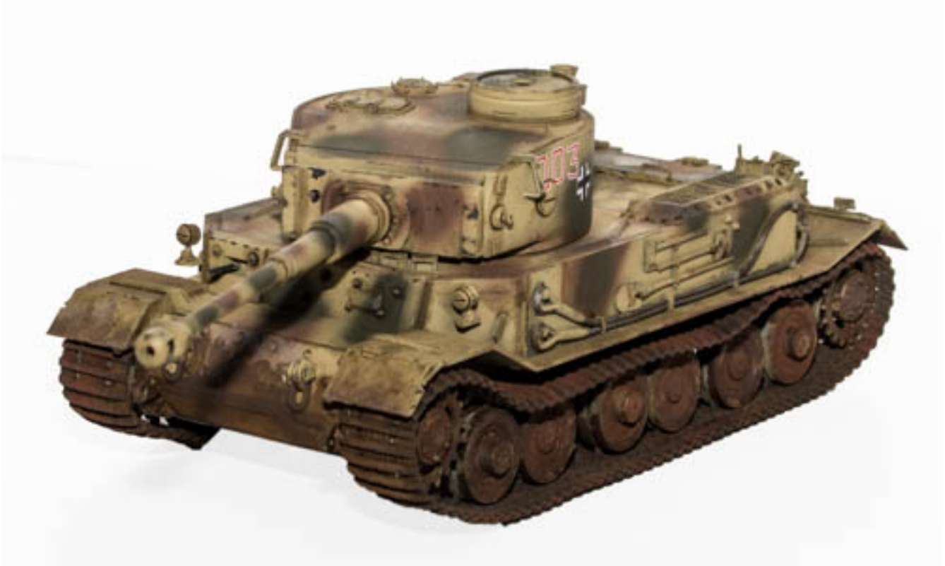
Sal Samenio's Tiger 1