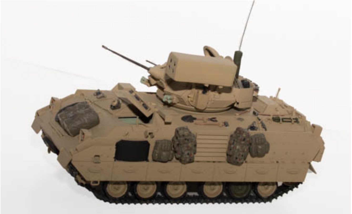
Carl Webster's Line Backer Bradley