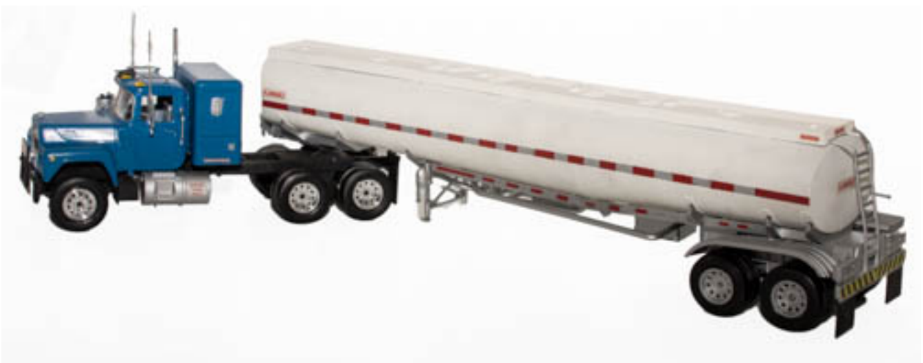
Roger Gutierrez's Tank Truck

Roger Guterriez brought a 1/24 th /1/25 th tank truck.