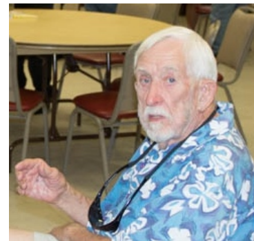
John Paul Jones