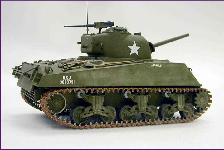
1/35 Tamiya Sherman by Roy Lingle