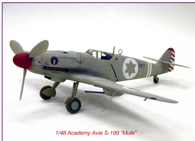
1/48 Academy Avia S-199 "Mule"