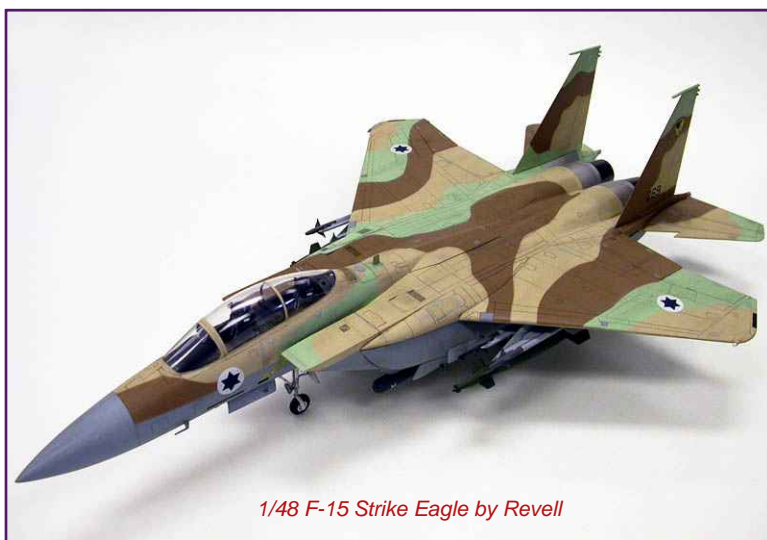
1/48 F-15 Strike Eagle by Revell