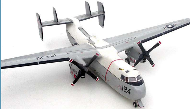
1/72 C-2 Greyhound (Conversion)