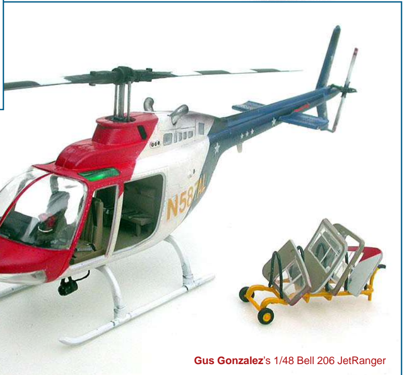
Gus Gonzalez's 1/48 Bell 206 JetRanger