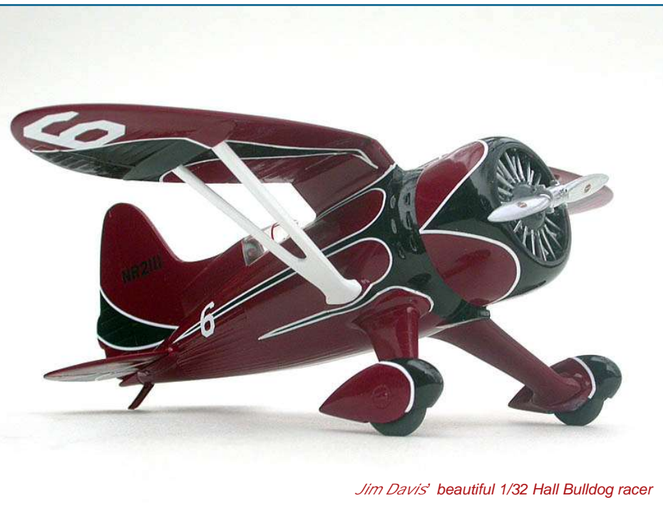
Jim Davis' beautiful 1/32 Hall Bulldog racer

James Spence had a Revell 1/99 scale PT boat, the old boat number 211 kit. This is still a nice kit even though it is rather an old kit. James is still one of our most prolific modelers and has an interesting selection of kits in his collection.