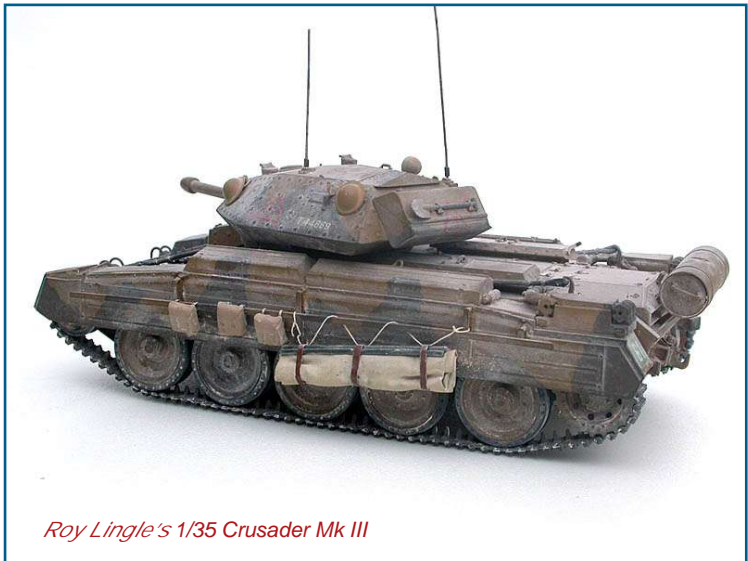
Roy Lingle's 1/35 Crusader Mk III