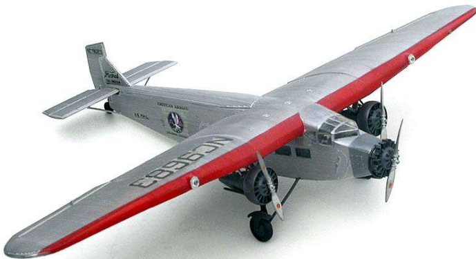
Airfix 1/72 Ford Trimotor