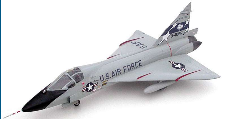
1/72 TF-102 (Conversion)