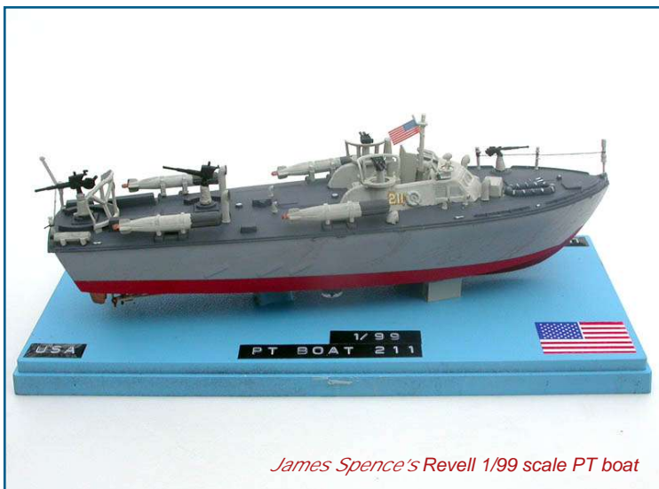
James Spence's Revell 1/99 scale PT boat