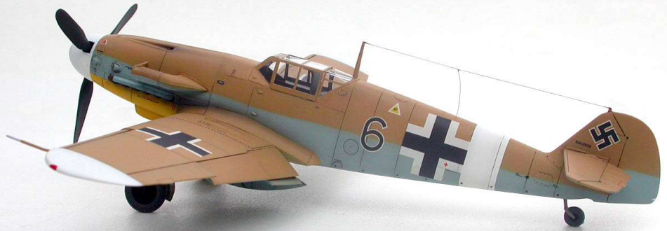
1/48 Hasegawa Me109G-2 by Fabian Nevarez

I am sure that I missed some of the items that were shown, but that sometimes happens. Thanks to all that brought built up kits or kits still in the box to hone our interest in modeling. This models that are displayed and talking with other modelers about models and modeling are what make our meetings outstanding.