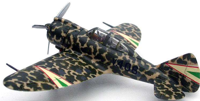
Connie Harth's SuperModel Fiat CR 32 in 1/72 scale.