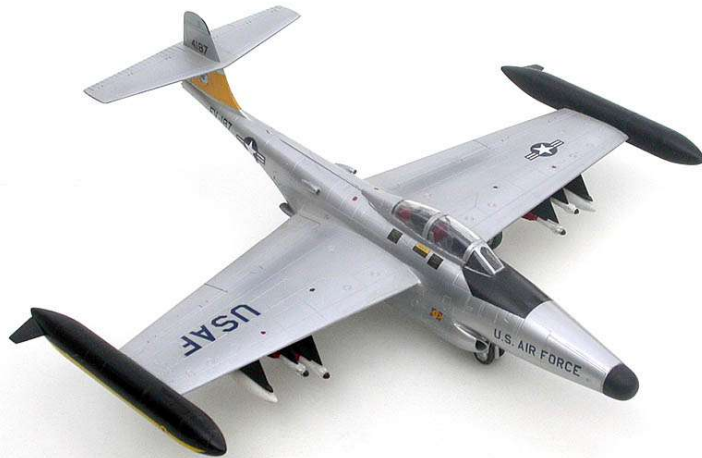
Revell 1/72 F-89 Scorpion