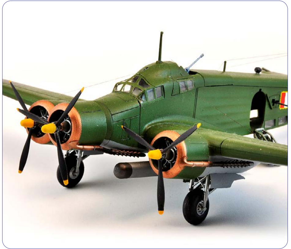
Savoia-Marchetti SM79 Sparviero in 1/72nd scale by Mike King

Dues are due and can be paid. If you write a check, please make your check out to IPMS El Paso or the El Paso Model Society.