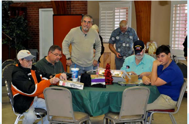
The Armor Guys