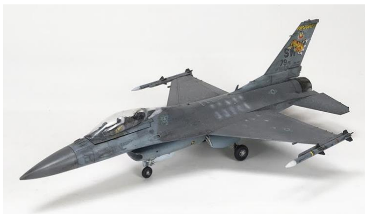
Rick Mena's 1/72 nd scale Tamiya F-16 CJ Block 50