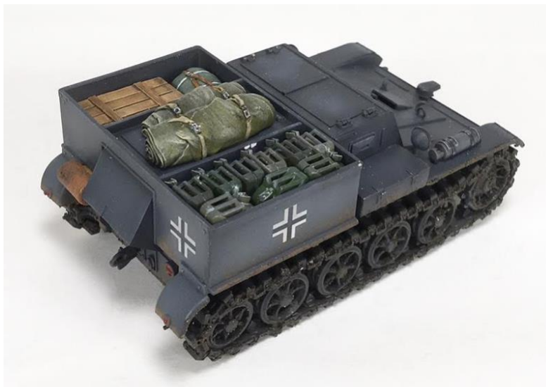
Clif Bailey's DAS WERKS 1/35th scale " Gepanzerter Munitionsschlepper