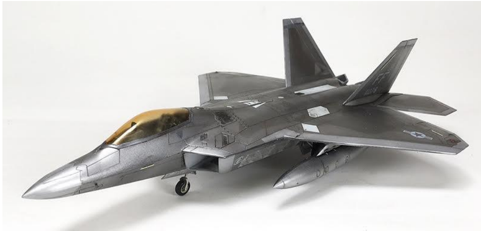
Rick Mena's Academy 1/72 nd scale F-22