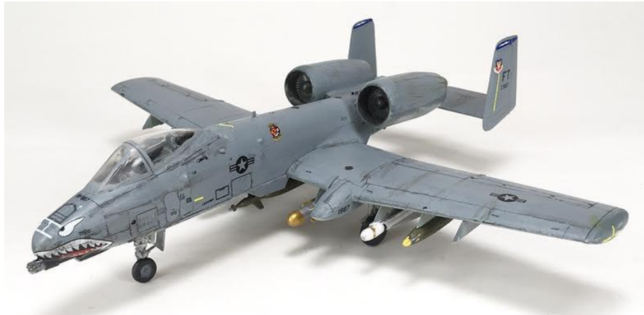
Zachary Corbin's 1/72 nd scale Academy A-10