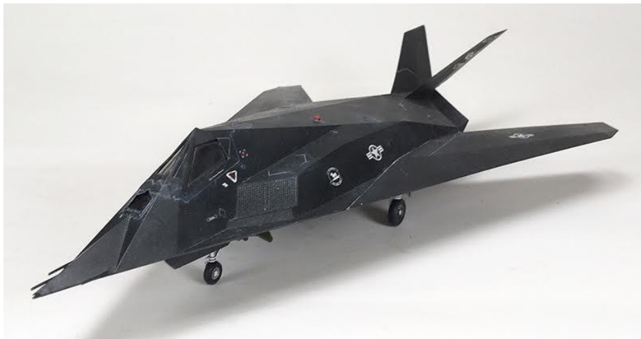
Rick's Revell 1/72 nd scale F-117