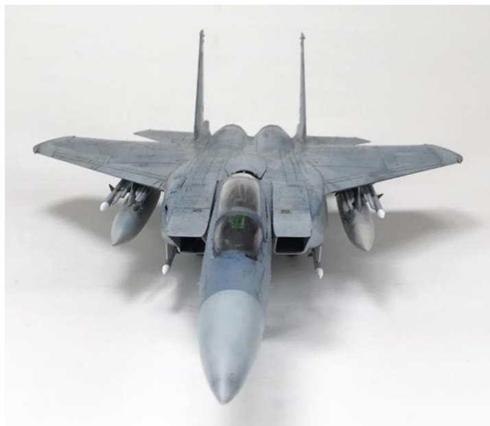
Rick Mena's Hasegawa 1/72 nd scale F-15