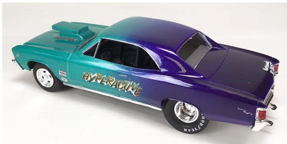
Hector's AMT 1/25 th scale Chevelle