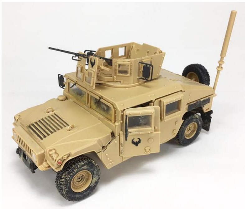
Zach's 1/35 th scale Tamiya "HumVee"