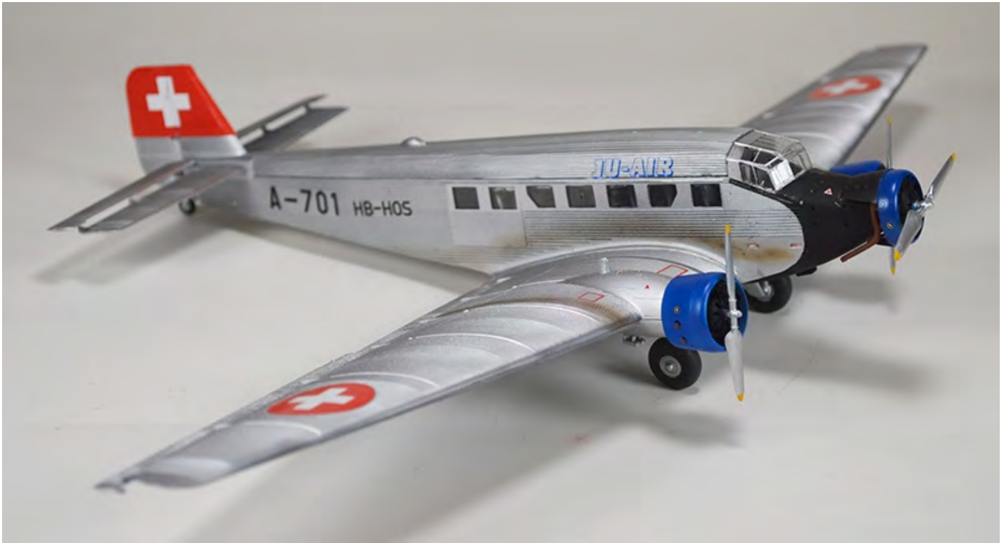
Zahir Vera's Ju-52/3M

Our next meeting will be on November 5, 7000 Edgemere at 2:00 P.M.