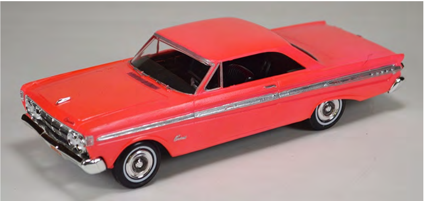
Hector Gonzalez's Mercury Comet

There were several models on display to look over and to be photographed. Thanks to those who brought their latest efforts.