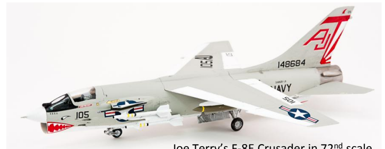
Joe Terry's F-8E Crusader in 72 nd scale