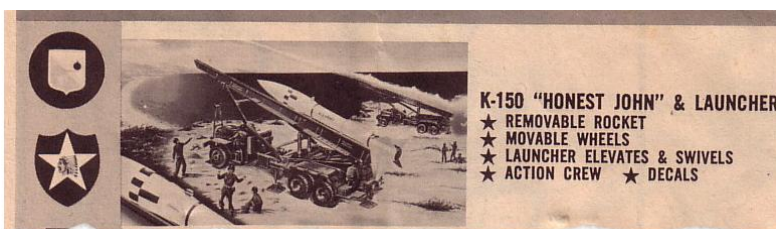
Clip from 50's era Adams Model Co.