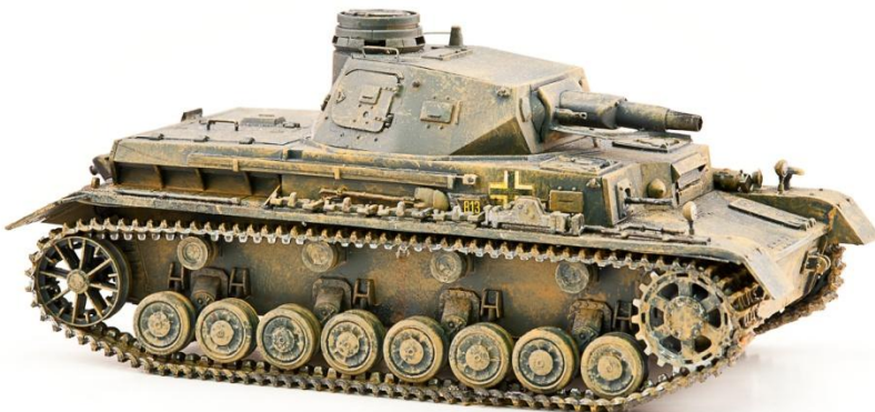
Dixie Fischer's PZKPFW IV Ausf D in 1/35th scale