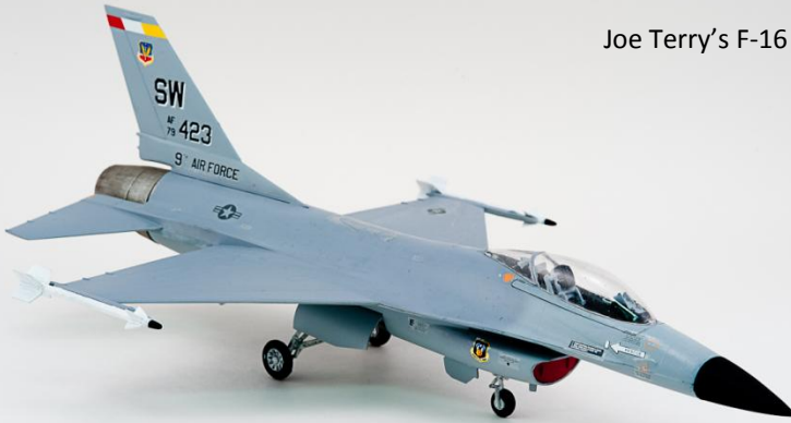
Joe Terry's F-16