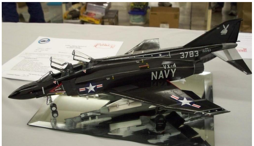
Gus Gonzalez' Phantom in the Black Bunny Scheme.