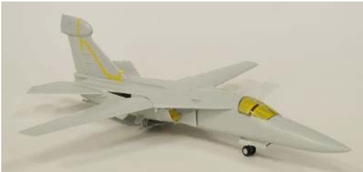
Ricardo Macias's Revell EF-111A WIP

The following two models shown by Richard are Revell 1/72 nd scale kits.