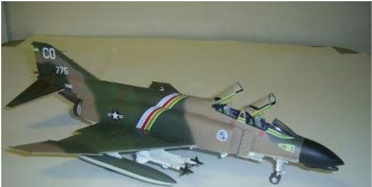
Another view of Jerry's F-4D

Our January meeting will feature cake and ice cream to celebrate the New Year.