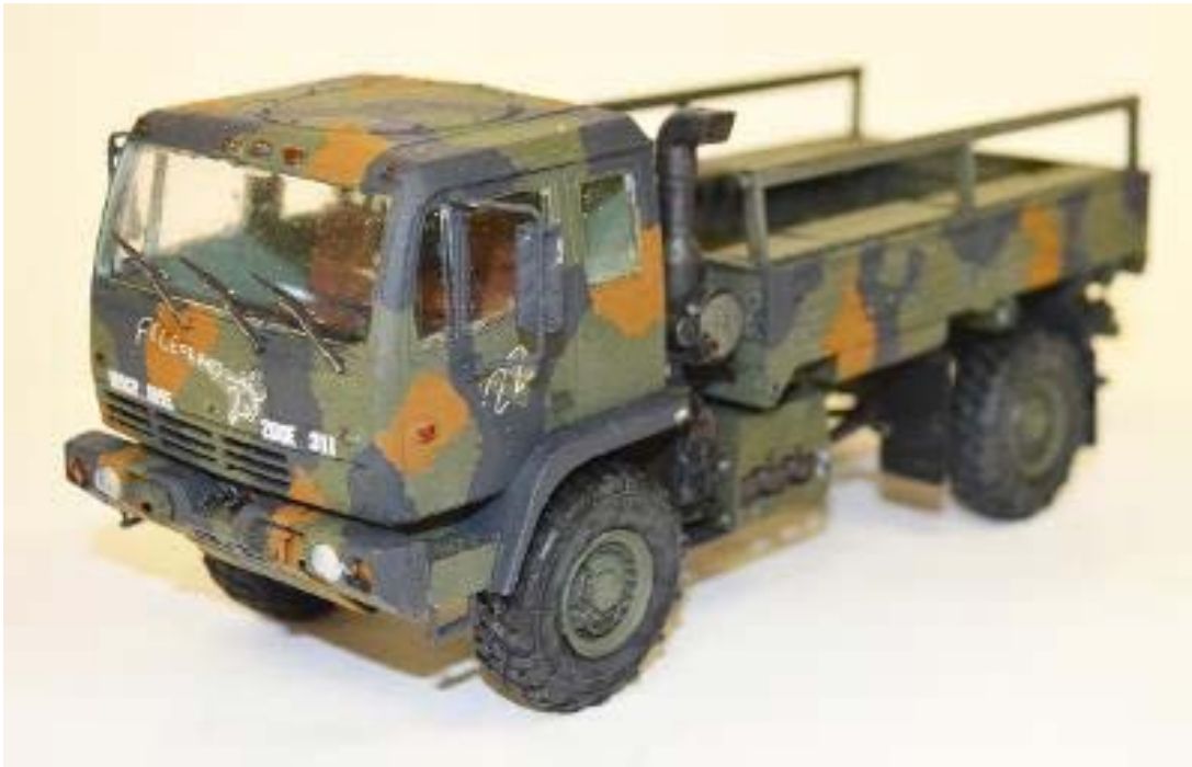
Arthur Berdick's M1078 LMTV

For the M1078 LMTV, Arthur used the Trumpeter 1/35 th scale kit.