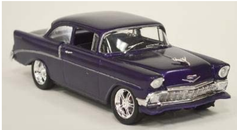
Another view of the 56 Chevy by Hector.

Here, Arthur used the Revell 1/24 th scale kit to build the Porsche Junior 108 tractor.