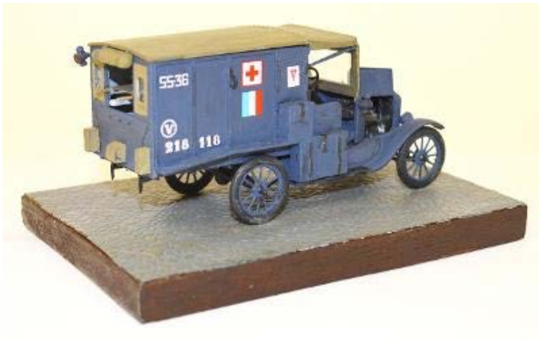
Arthur Berdick's 1917 Ambulance

He used the ICM kit to produce the 1/35 th scale Model T Ambulance of the French Army, circa 1918.