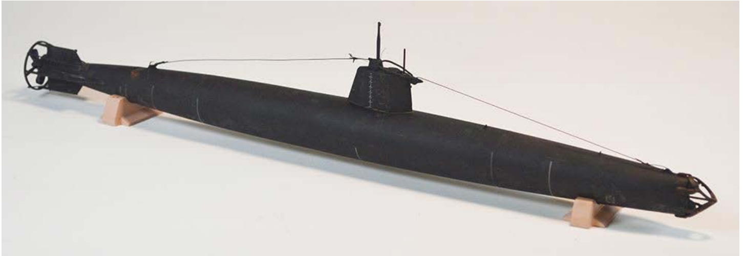
Clifford Bossie's Japanese Mini Submarine