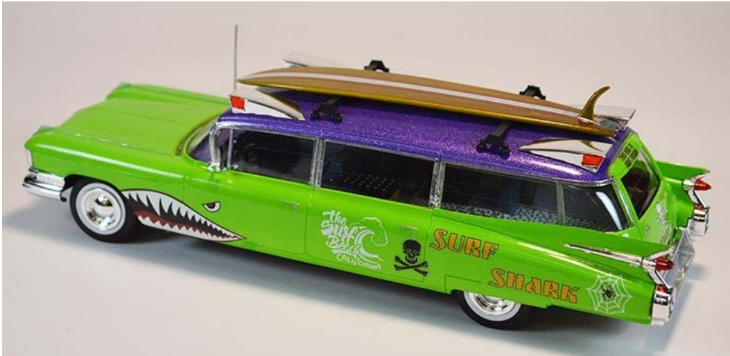
The other side of Hector's Ambulance