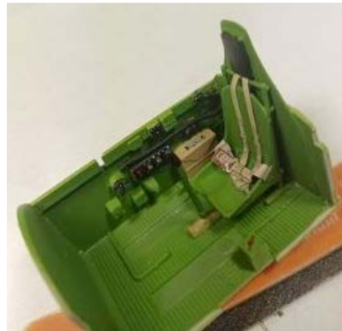
The interior of Jerry's P-47D