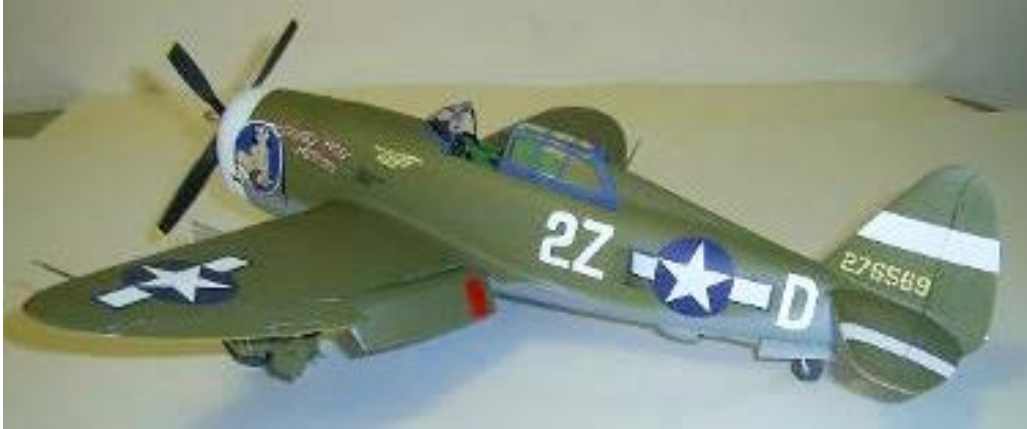
Jerry Richardson's 1/32 P-47D "Razorback"

“Razorback”. Used Eduard Zoom cockpit set, seatbelts, Brassin resin wheels and Zotz decals. Cheers, Jerry.