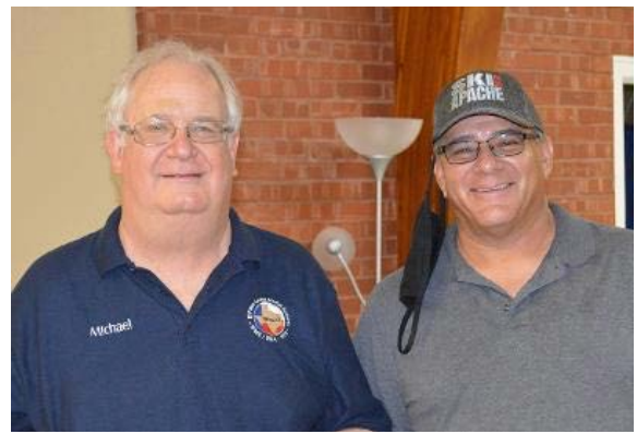
Glad to be at a meeting.