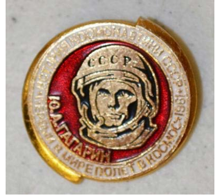
Soviet Badges shown by Justin Segovia