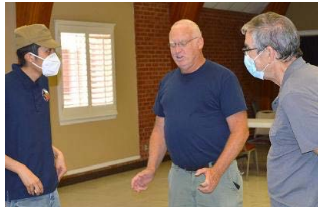
Getting the latest info.