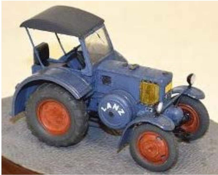
Arthur Berdick's German Aircraft Tractor/Tug