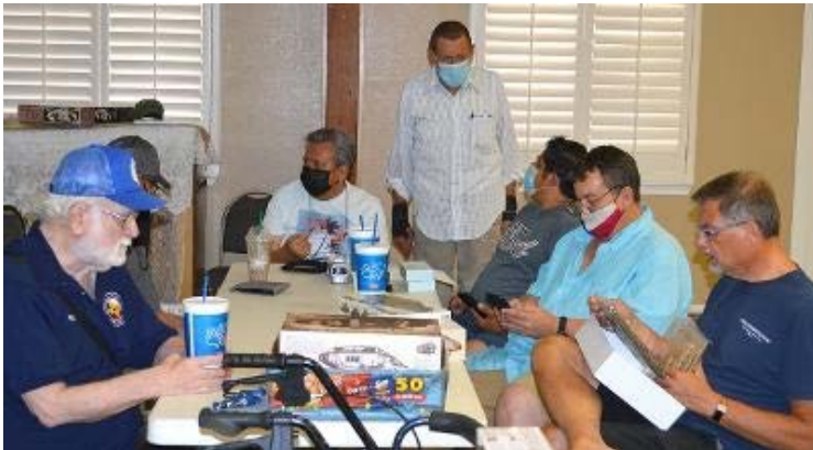
Checking out the new stuff.