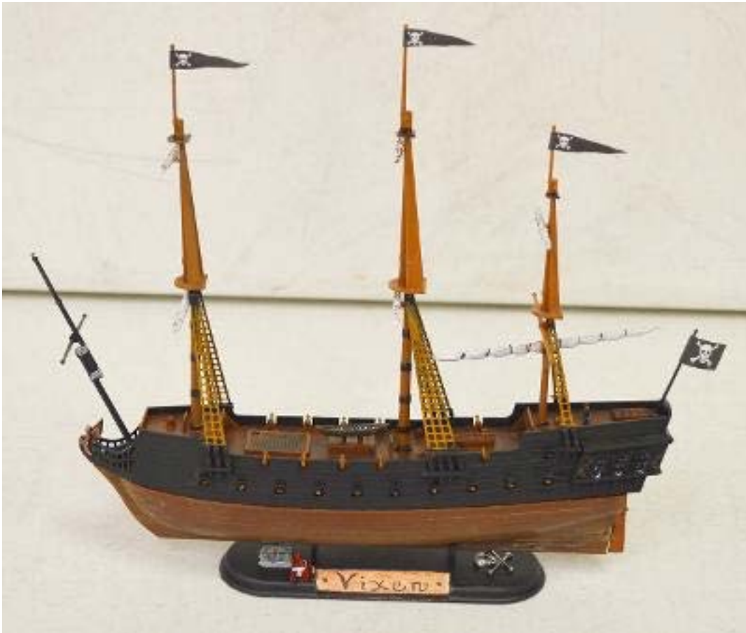
Dixi Fischer's Pirate Ship

This is a work in progress. Dixi used the Revell 1/350 th scale kit and she will use the finished model for All Hallow's Eve.