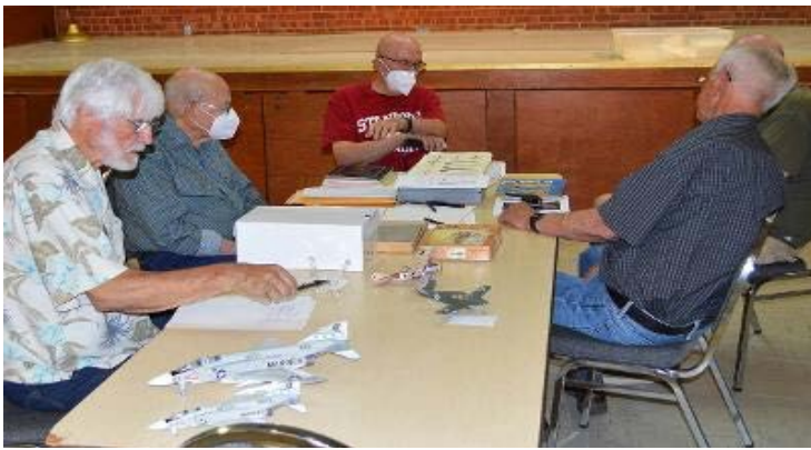
Waiting for the program to start.