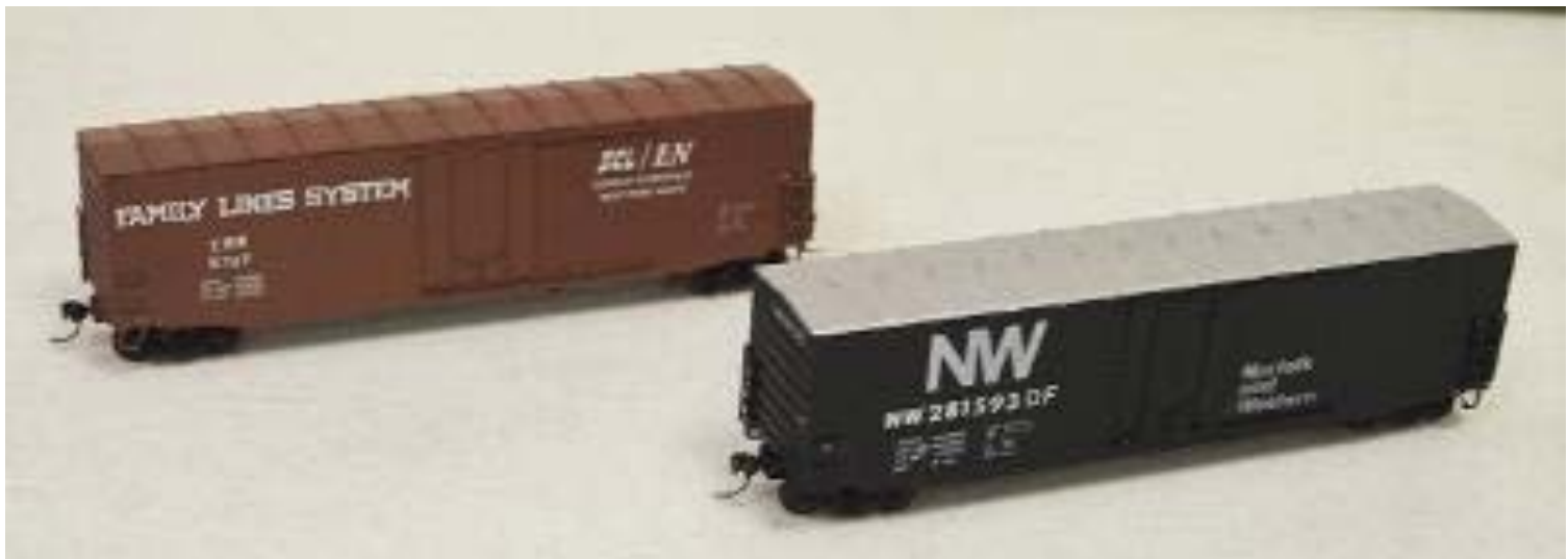
Roger Gutierrez's 50' Plug Door Box Cars

This is a work in progress. Dixi used the Revell 1/350 th scale kit and she will use the finished model for All Hallow's Eve.