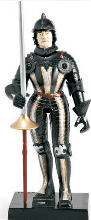
Steve Herren's Black Knight figure