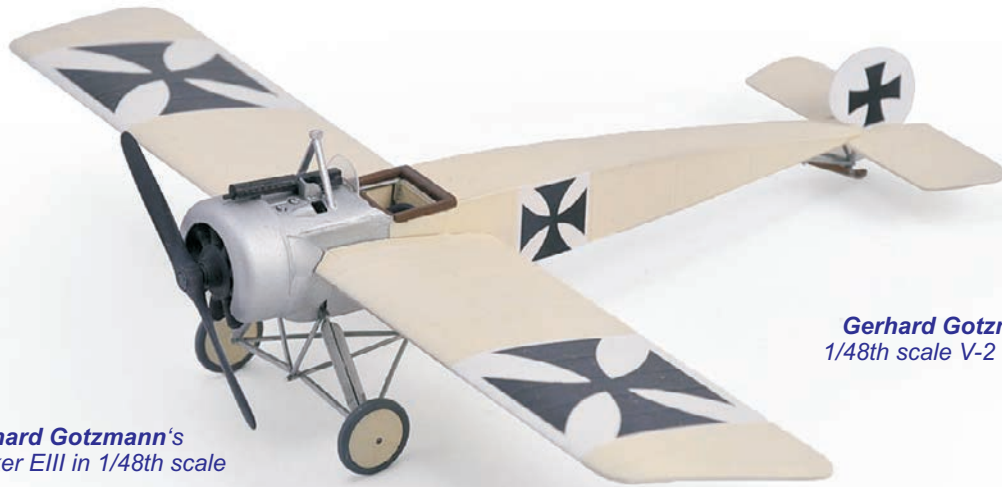
Gerhard Gotzmann's Fokker EIII in 1/48th scale