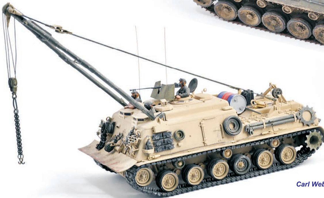
Carl Webster's M88A1 in 1/35th scale