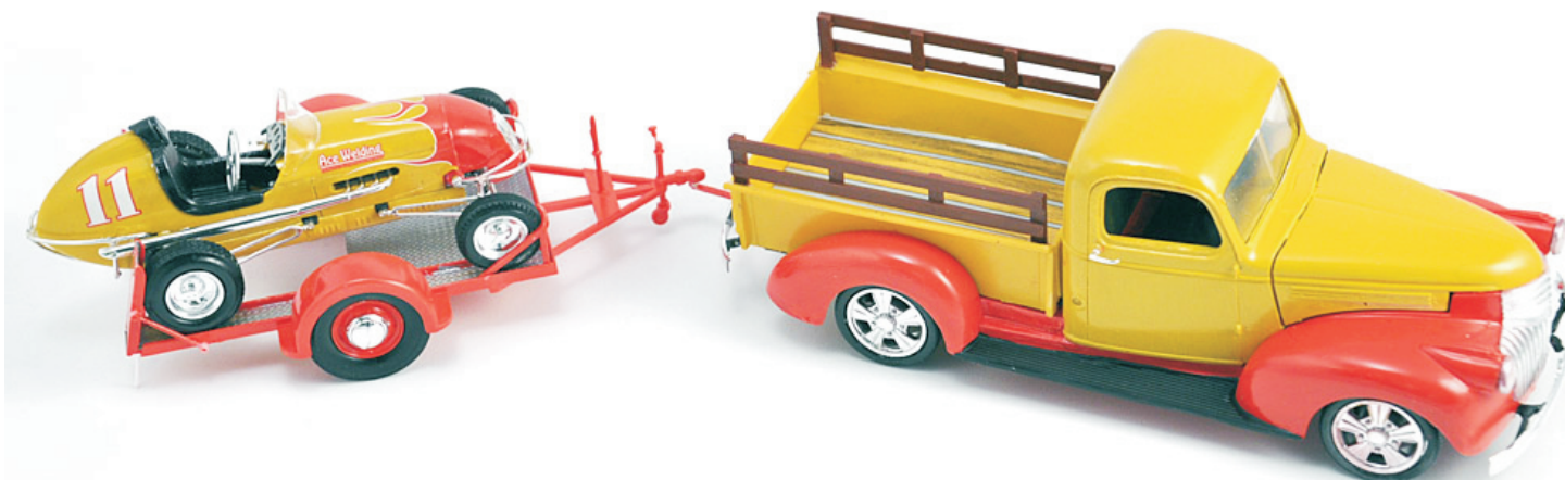
Steve Herren's 1/25th scale 1949 Chevrolet Pickup with racer outrigger