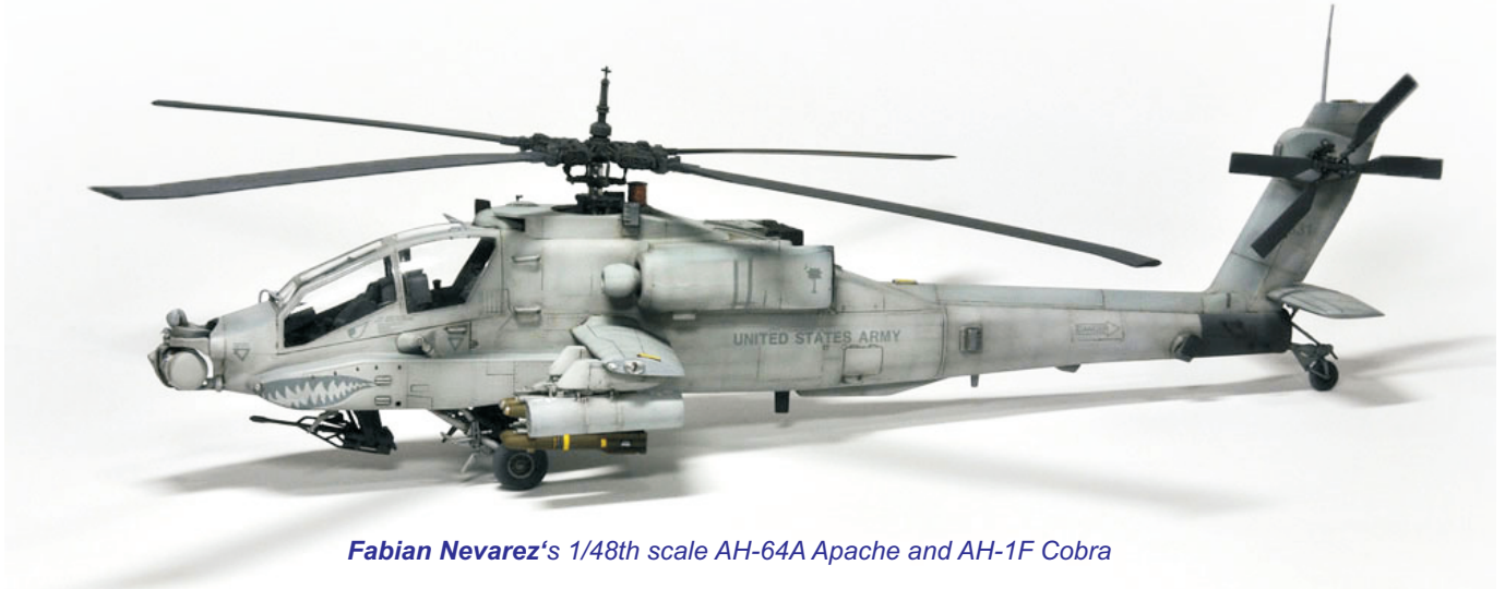
Fabian Nevarez's 1/48th scale AH-64A Apache and AH-1F Cobra