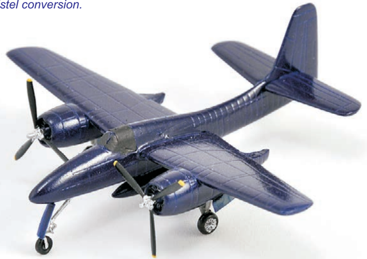
Julio Sanchez's F7F Tigercat in 1/144th scale