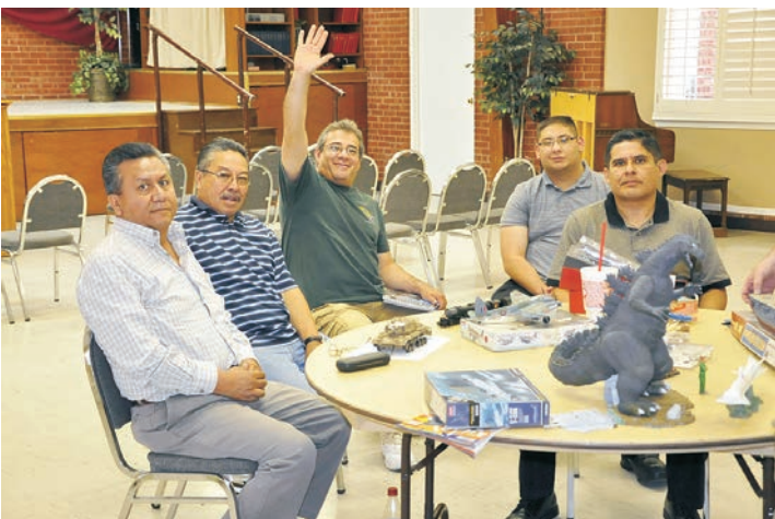
Si Hablar Espanol or ...The Mexican Connection