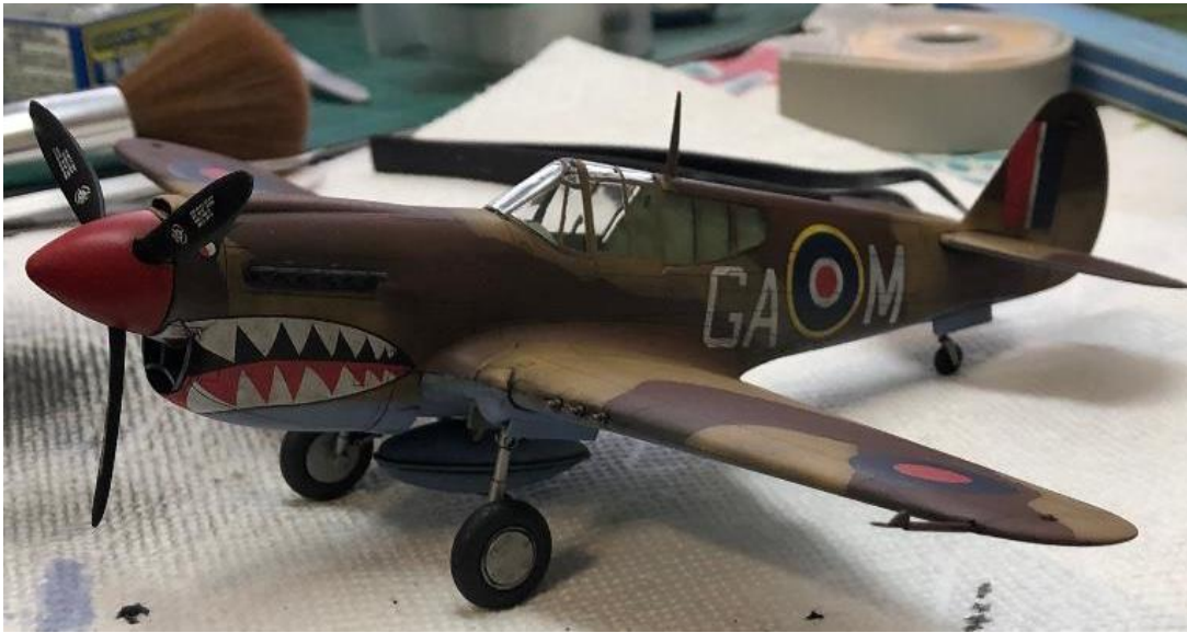
Kenyon Souflee's WIP P-40

Kenyon Souflee sent a photo or two of his latest effort.