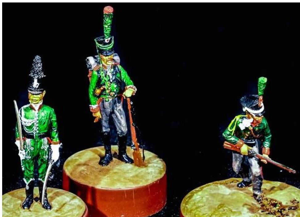
Three 54 mm figures by Arthur Berdick