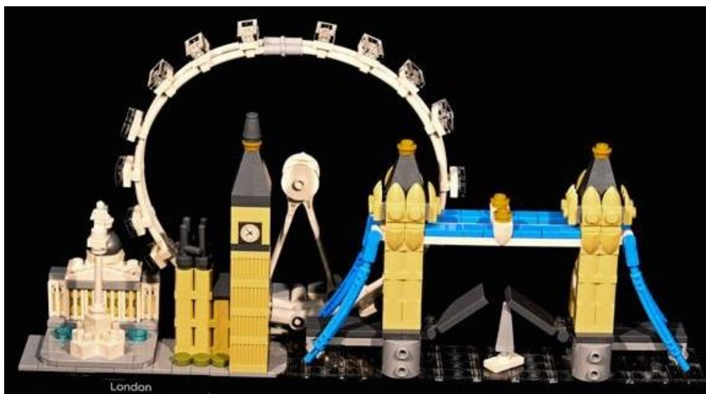
Dixi Fischer's Lego Model of London