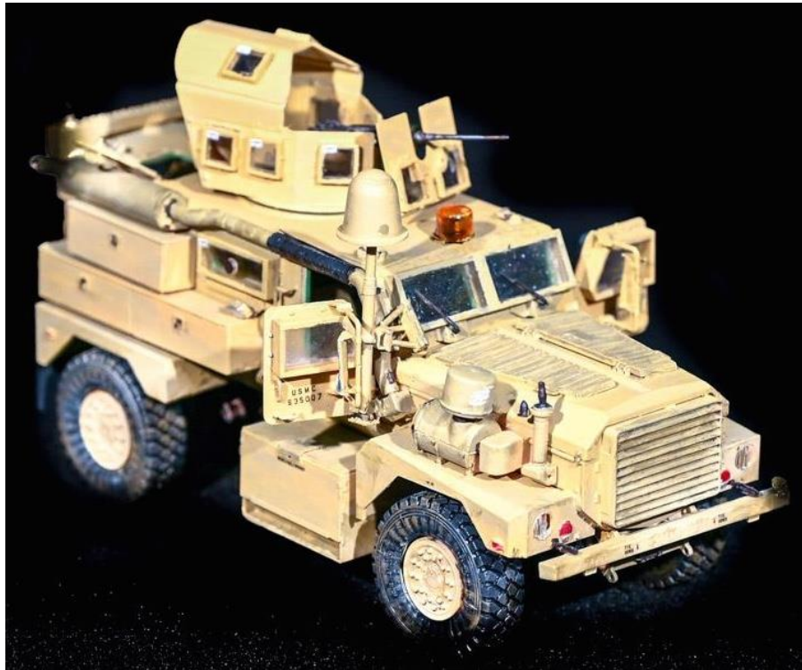
Arthur Berdick's Cougar 4 x 4 MRAP