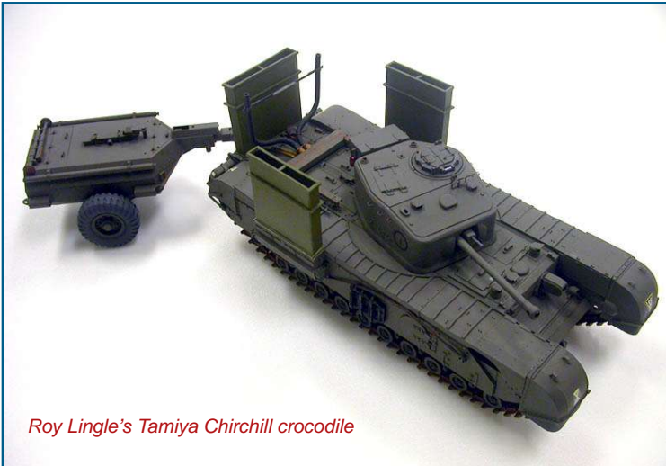
Roy Lingle's Tamiya Churchill crocodile