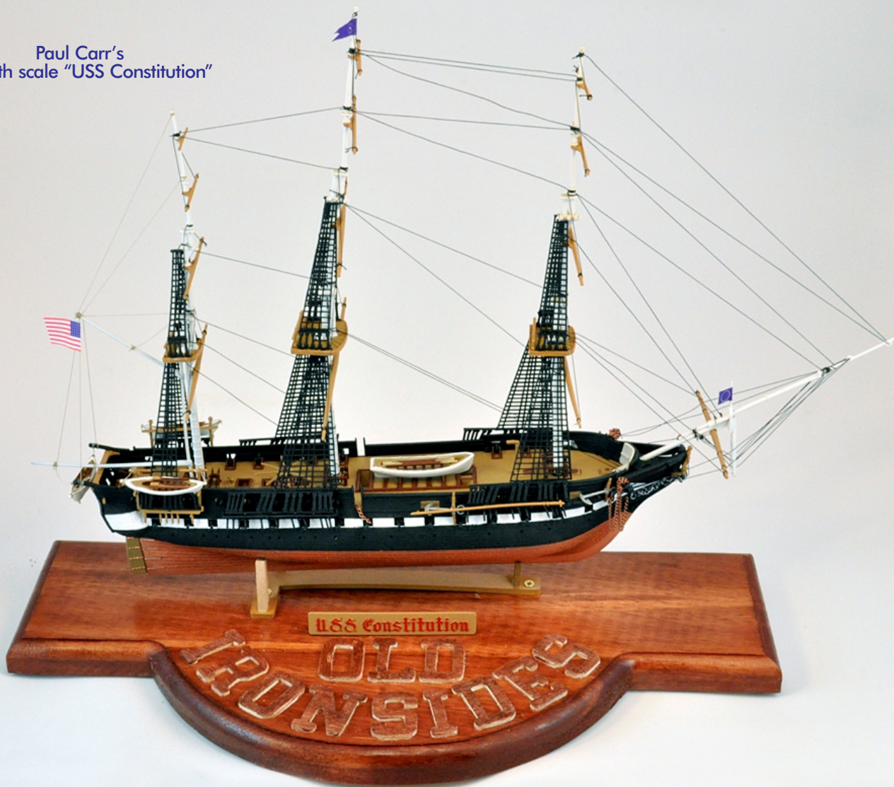
Paul Carr's 1/196th scale "USS Constitution"