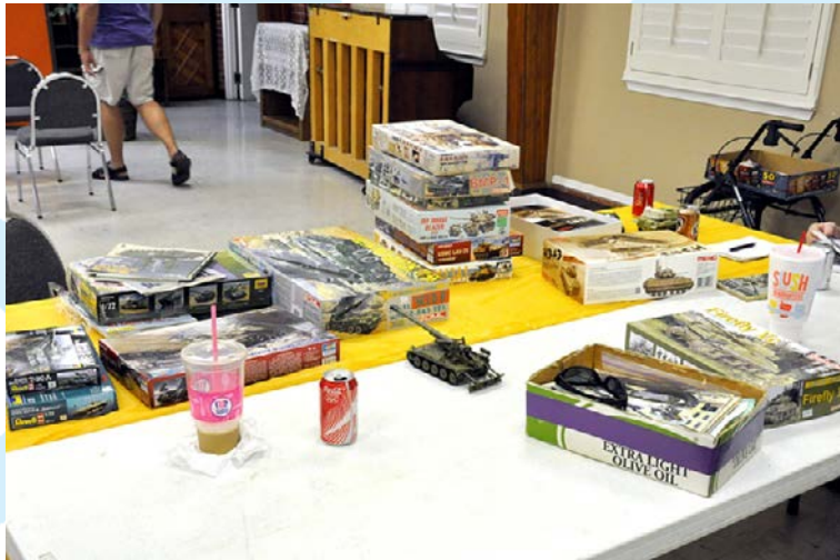
The Armor guys' table