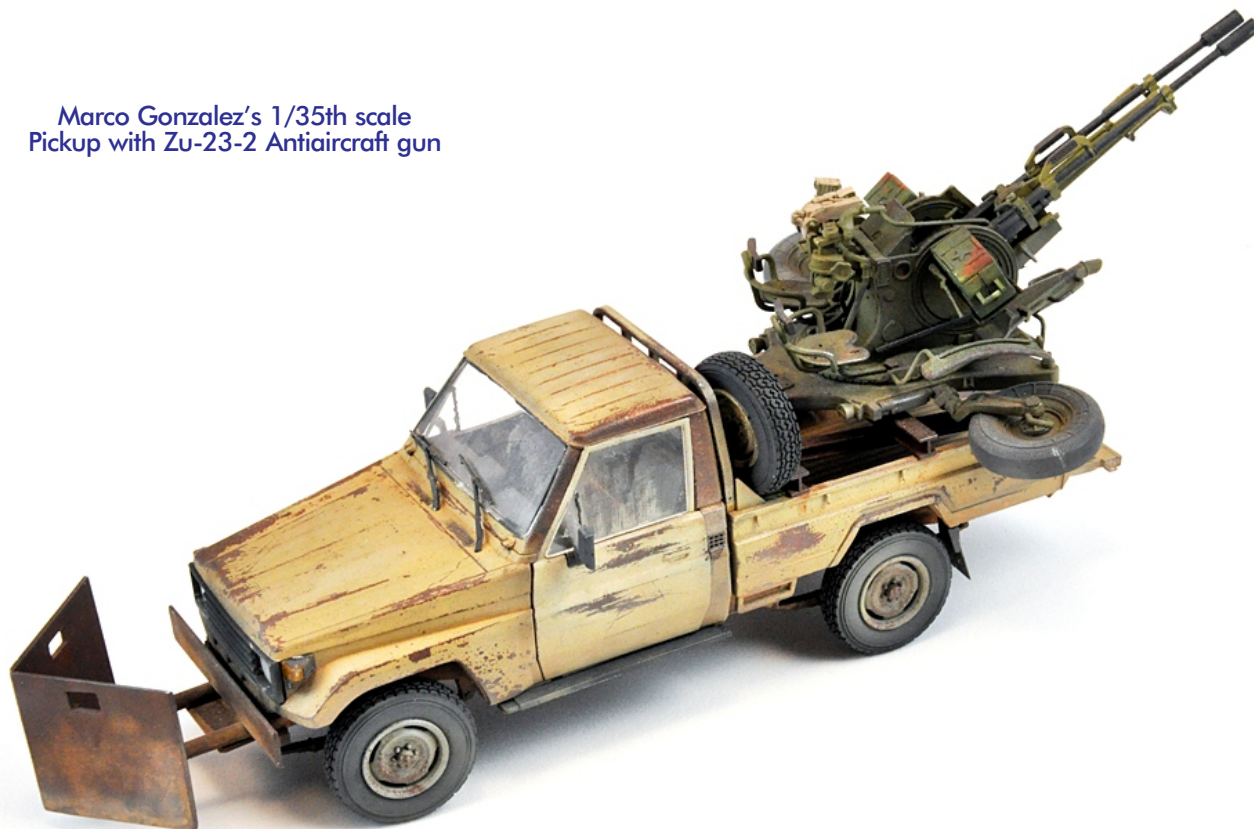
Marco Gonzalez's 1/35th scale Pickup with Zu-23-2 Antiaircraft gun