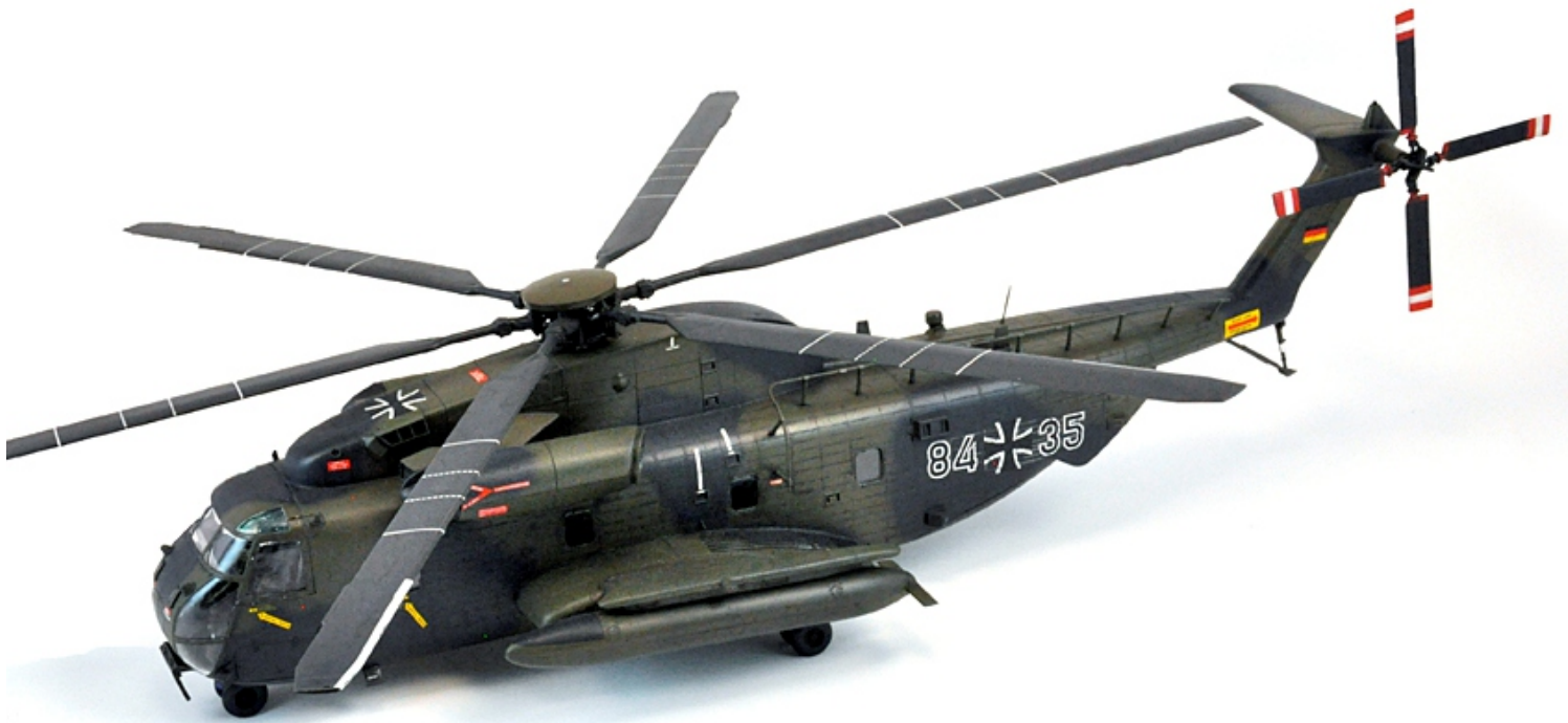
Gerhard Gotzmann's 1/48th CH-53GA Helicopter