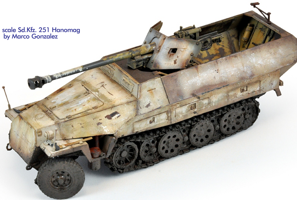
1/35th scale Sd.Kfz. 251 Hanomag by Marco Gonzalez