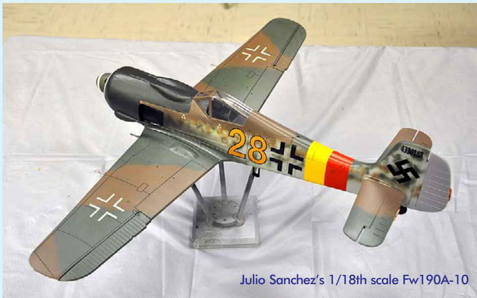
Julio Sanchez's 1/18th scale Fw190A-10