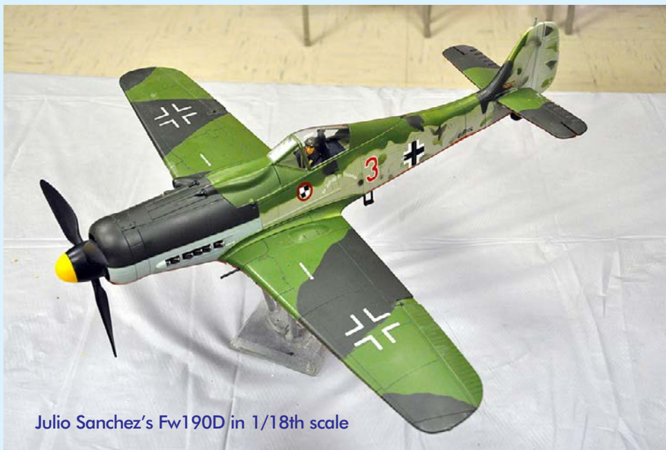
Julio Sanchez's Fw190D in 1/18th scale