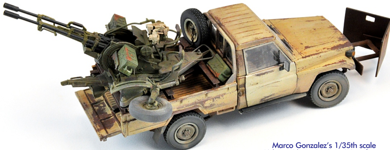
Marco Gonzalez's 1/35th scale Pickup with Zu-23-2 Antiaircraft gun