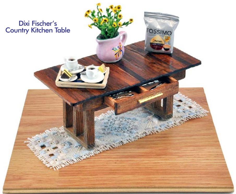
Dixi Fischer's Country Kitchen Table

His Second effort was Kitty Hawk 1/48th scale "Gripen." To quote Gerhard, "This was very poor fitting kit which is annoying and surprising for an expensive kit. All access panels and doors are meant to be built in the open position and if you want to close them, then a lot of sanding and filler required. There were no external fuel