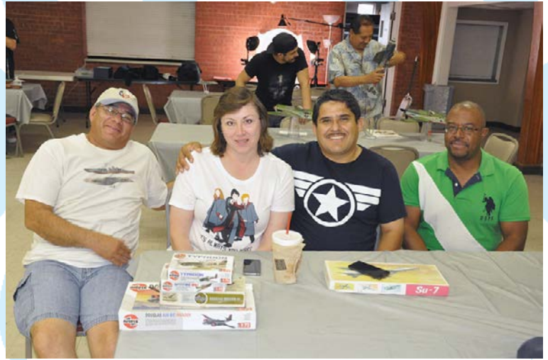
Just Nice People