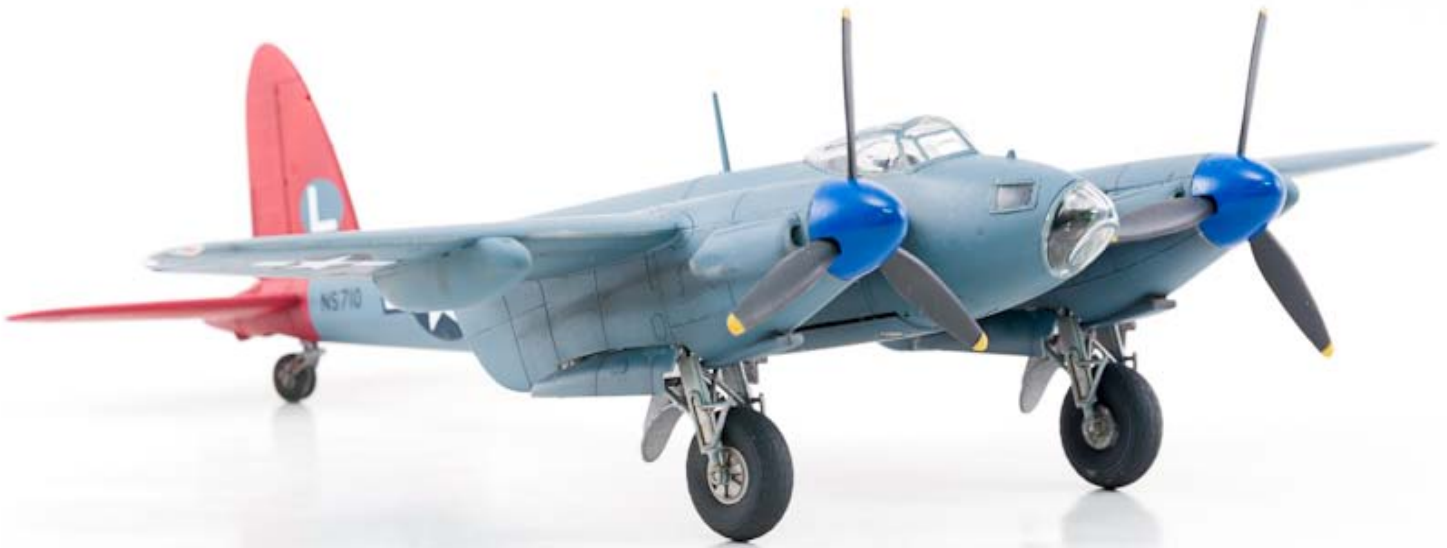
Mike King's 1/72nd scale Mosquito PR Mk XVI in US Markings