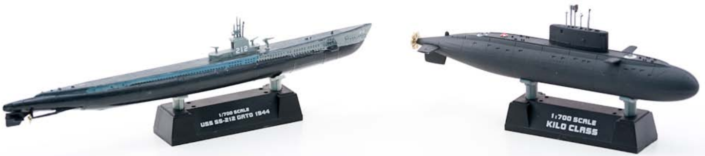
Charlie Flores' USS Gato and Kilo Class Submarines in 1/700th scale