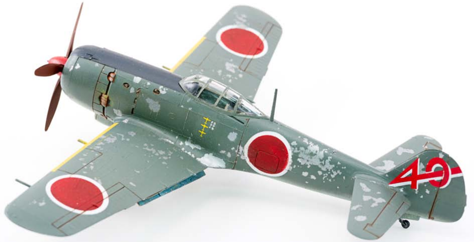
Mike King's Hasegawa Ki-84 in 1/72nd scale

The meeting was a Show and Tell session . There were a large number of models on the tables and some new kits still in the box to look over and discuss.