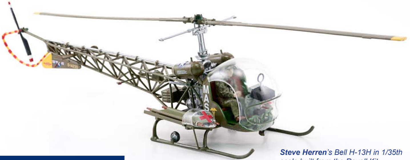
Steve Herren's Bell H-13H in 1/35th scale built from the Revell Kit.