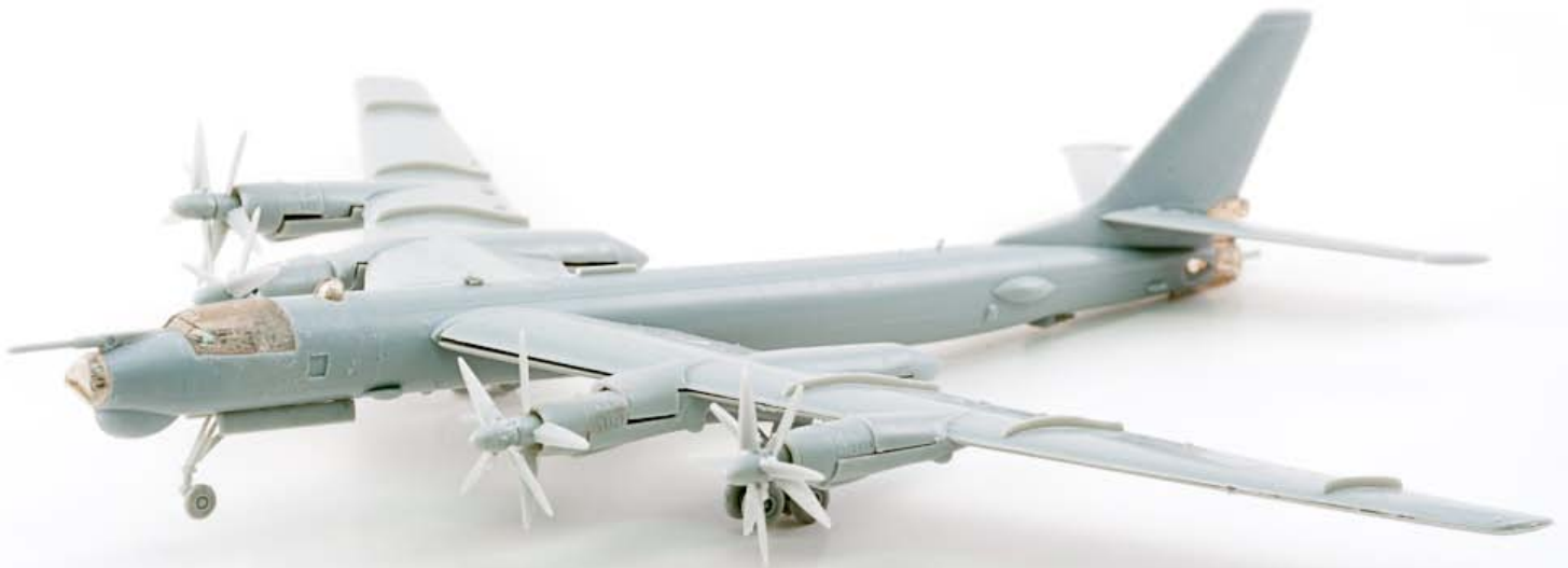
Adriel Patino Tu-95 Bear D in 1/200 scale.