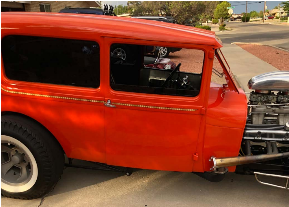
Found this while walking my dog. 1932 Ford Note: exhaust stains