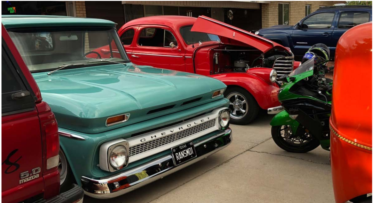
A couple more.