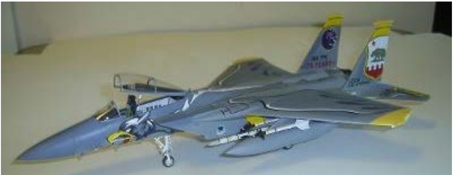
Another view of the F-15C

Jerry recently finished the Hasegawa 1/48 F-15C of the 194th FS, 144 th Fighter Wing of the Calif. ANG. He used a True Details resin seat, Aries exhaust nozzles and Speed Hunter Graphics Heritage Eagle decals, otherwise the kit was built OOB.