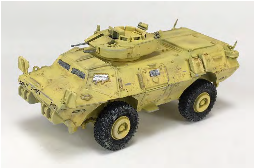
Zahir Vera's Trumpeter M117 in 1/72 nd scale