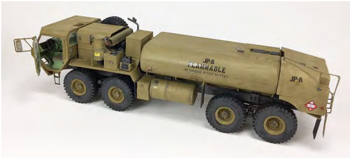
Arthur F. Berdick's Italeri 1/35 th scale Fuel Servicing Truck