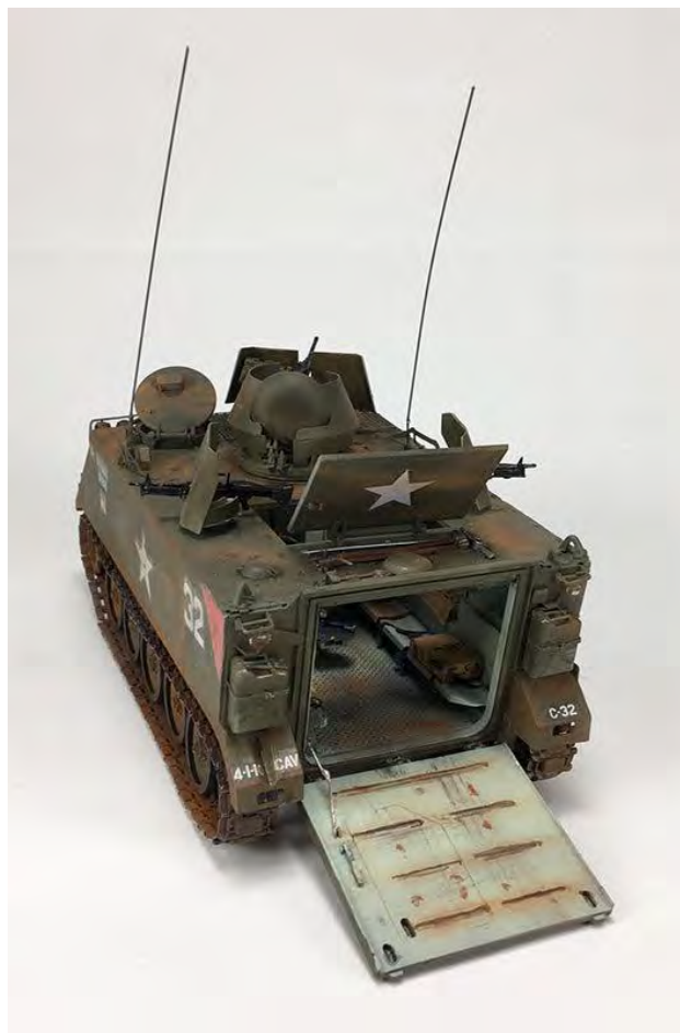
Zahir Vera's AFV 1/35 th scale M113