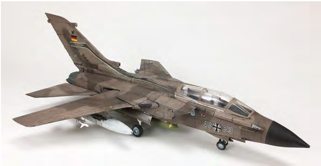
Carlos Delgado's Italeri 1/48 th scale Panavia "Tornado"