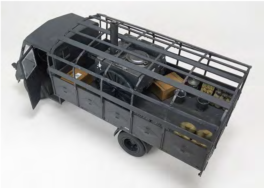
Art Berdick' 1/35 ICM Gulaschkanone WWII German Mobile Field Kitchen