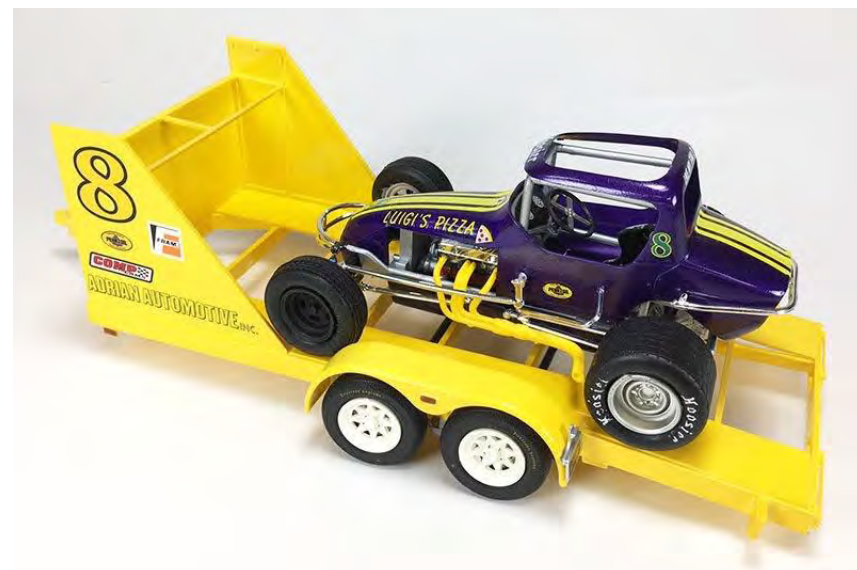
Hector's Monogram 1/25 th scale Sprint Car on Trailer