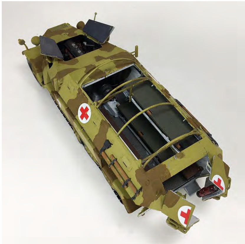
Arthur Berdick's ICM 1/35th scale Kranken Panzerwagen Sd.Kfz.251/8 Ausf. A WWII German