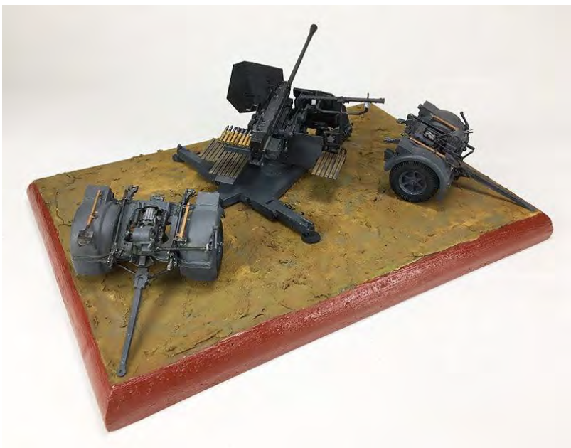
Art Berdick's Trumpeter 1/35 th scale German Flak 41