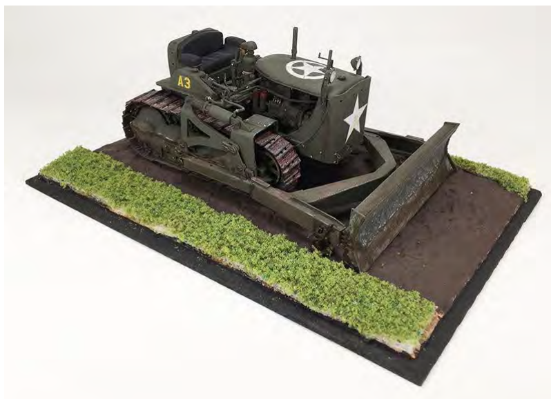
Fermin Rico's Mini Art 1/35 th scale Bulldozer