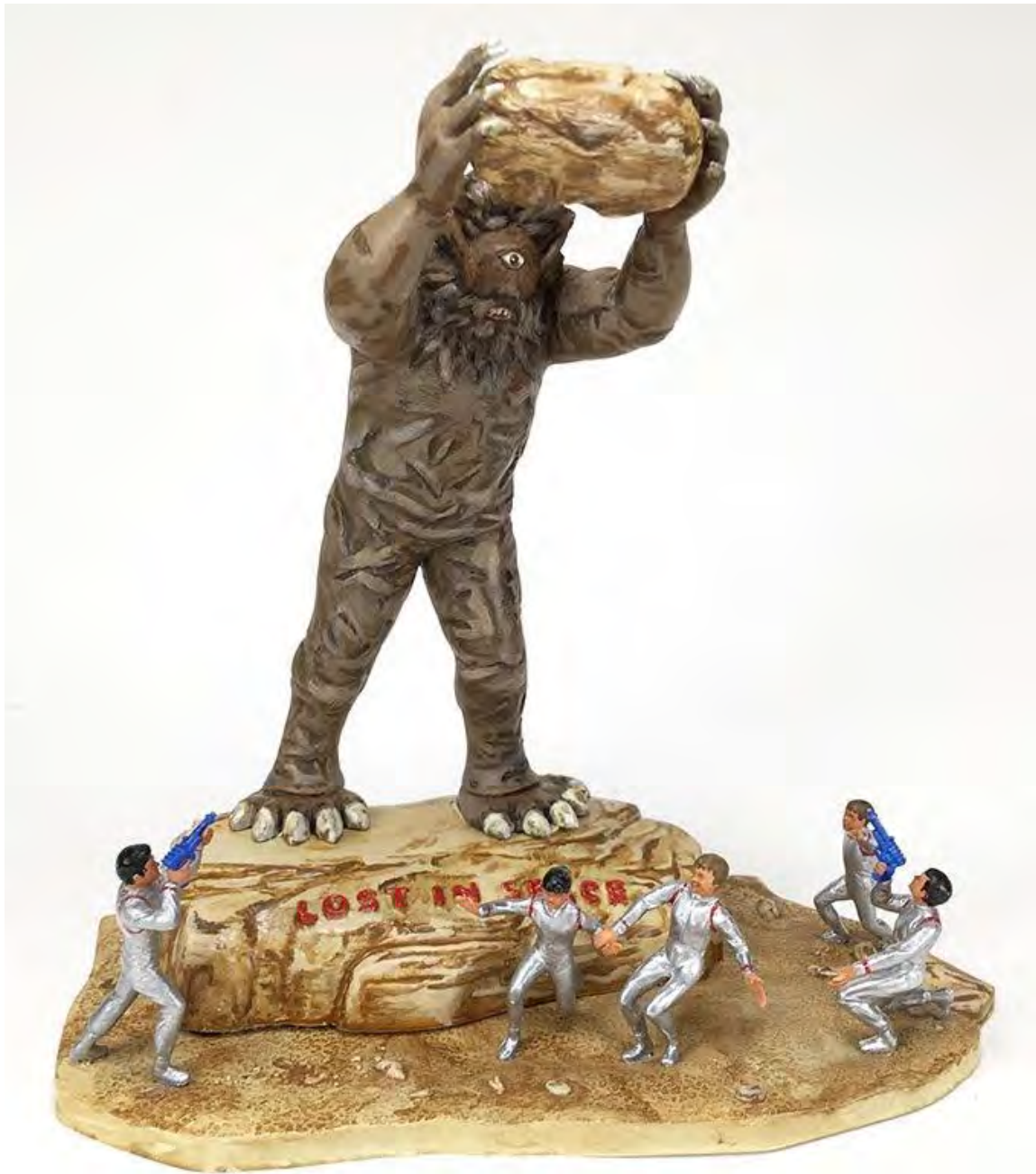
David Guzman's Scene from Polar Lights "Lost in Space"

The 2025 modeling year dues are due. They are still only $15.00.