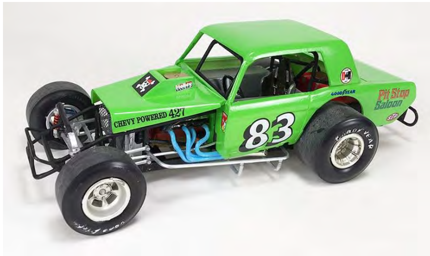
Hector Gonzalez's AMT 1/25 th scale 1965 Mustang Modified