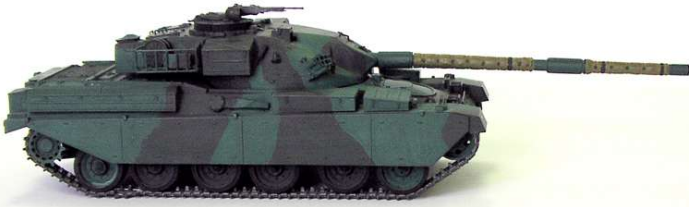
Roy Lingle's Tamiya Chieftan in 1/35 scale