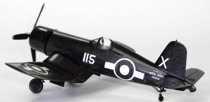
Good looking Corsair by Cliff in 1/72 scale