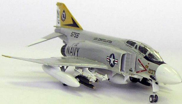
Clifford Bossie's Monogram F-4J in 1/72 scale