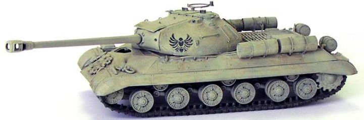
1/35 Trumpeter IS-III tank by Clifford Bossie