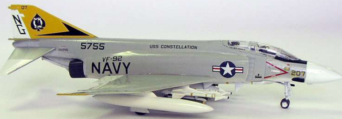
Side view of Cliff's Monogram Phantom