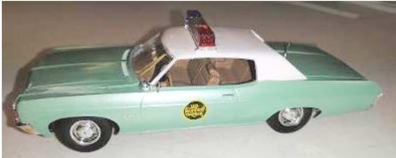
Hector Gonzalez's 1970 Chevrolet Impala