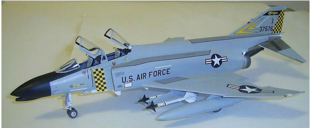
1/48 F-4C of the 171st FIS of the Michigan ANG.