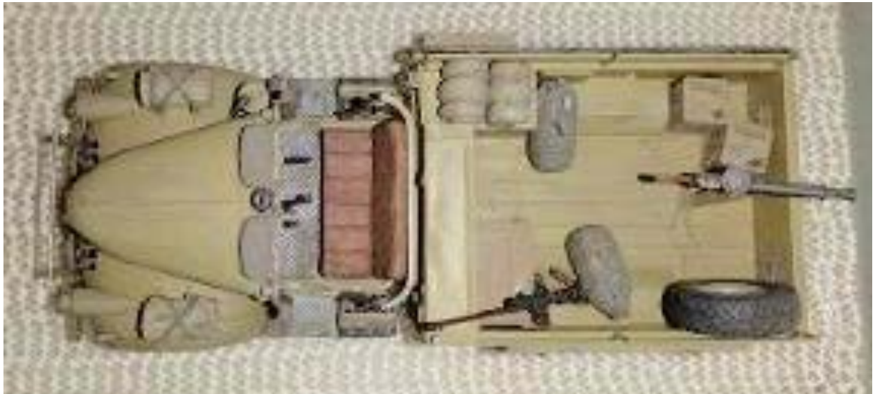
SAS Vehicle from WW II