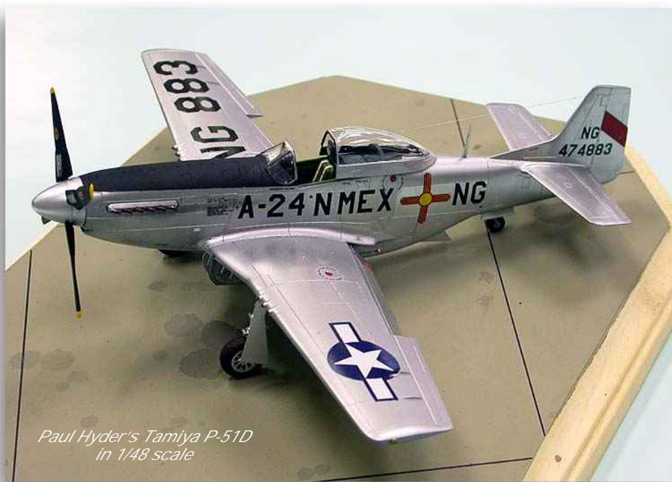
Paul Hyder's Tamiya P-51D in 1/48 scale

Roy Lingle brought the new Tamiya Hummer still in the shrink wrap and a Pz Mk II built up from the 1/35 Tamiya kit.