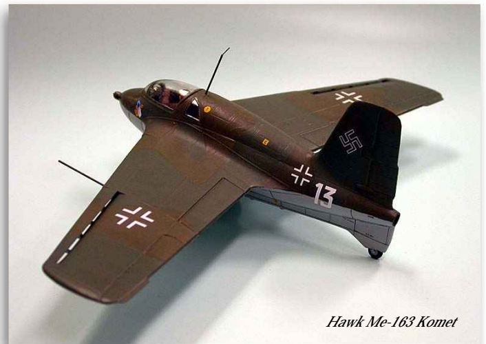
Hawk Me-163 Komet