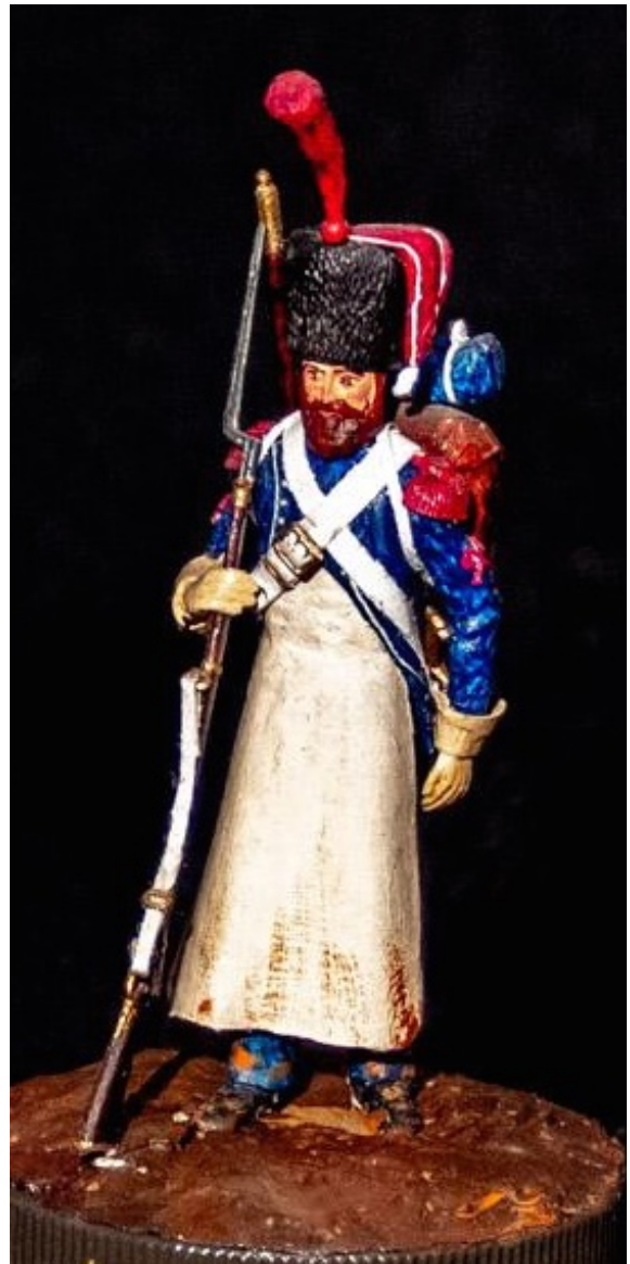
Another Sapper by Art Berdick