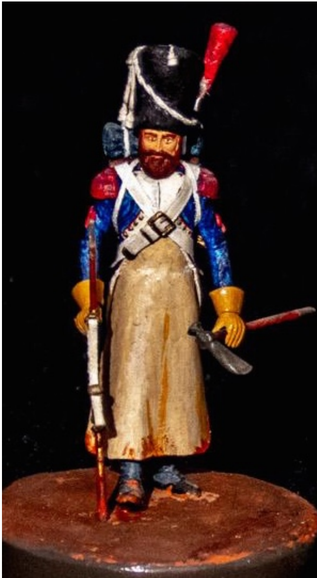
Art Berdick's Sapper