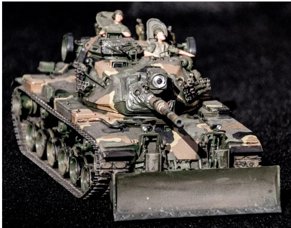
Art Berdick's M60A3 with Dozer Blade