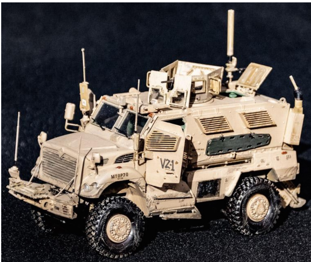
Art Berdick's M1235A1