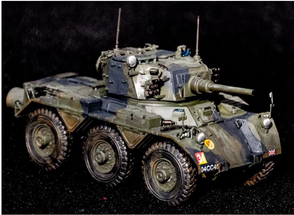
Art Berdick's Saladin Mk .2