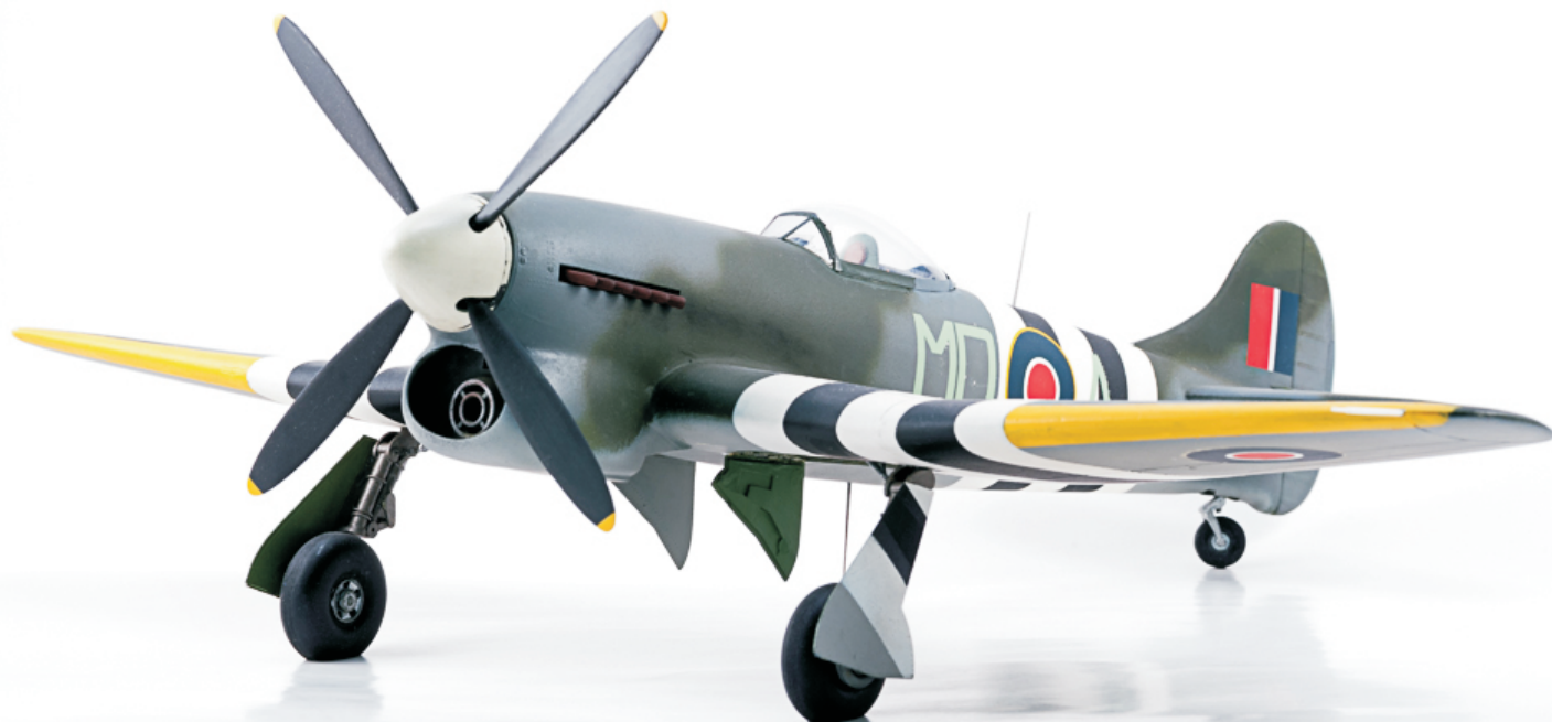
Julio Sanchez's Hawker Tempest V in 1/32nd scale.