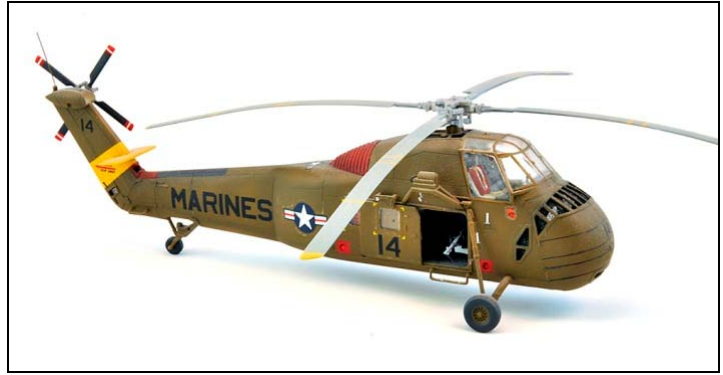
and his UH-34D