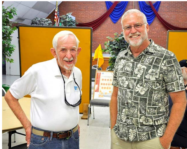
John Paul Jones