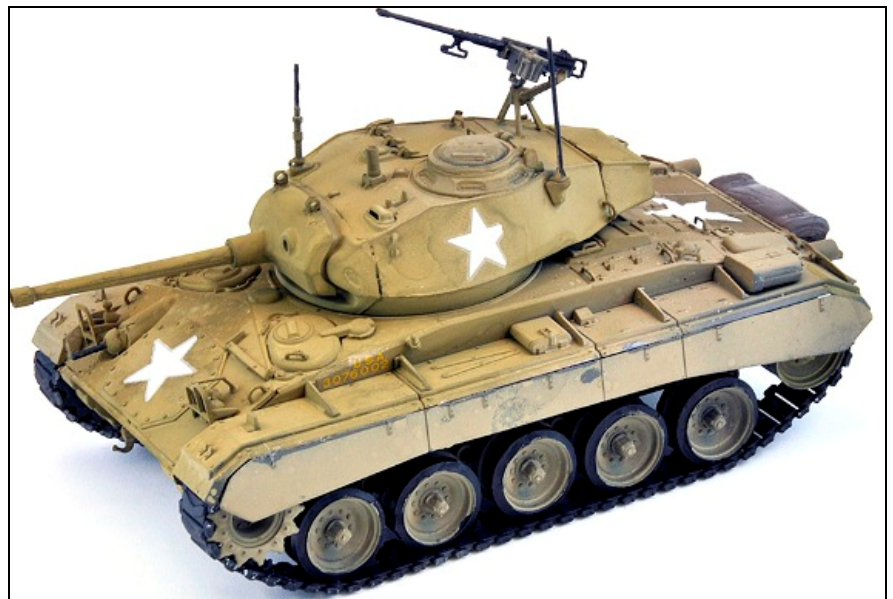
Sal's 1/35 th scale M-24