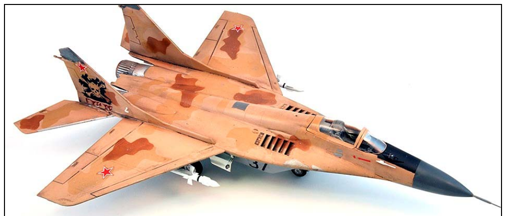
Carlos Delgado's Mig 29 built from the Monogram kit