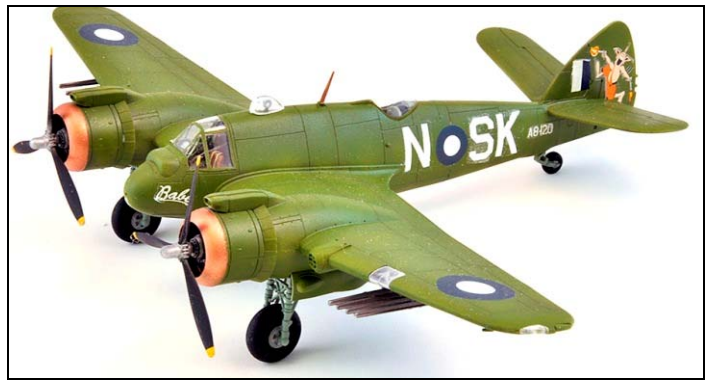
and his Beaufighter, the "Green Ghost"