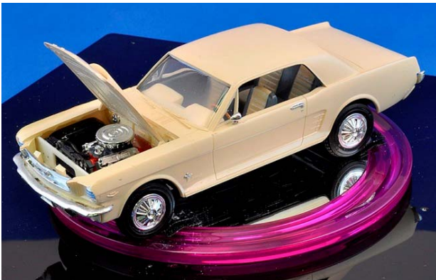
Paul Carr's AMT 1/25 th scale 1966 Ford Mustang