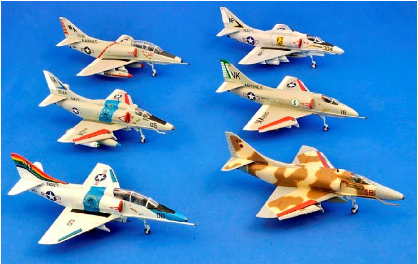
Mike King's A4 Presentation in 1/72 nd scale