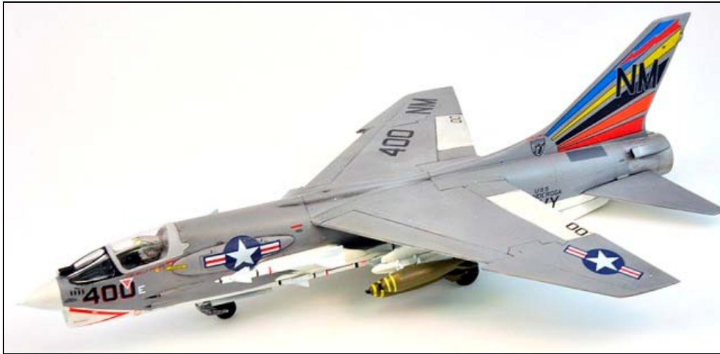
Carlos Delgado's F8-E "Crusader" built from the Revell kit.