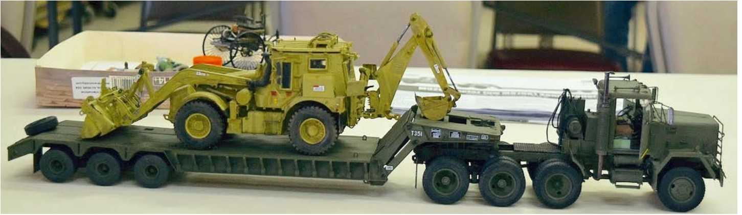
Art Berdick's Dragon Wagon