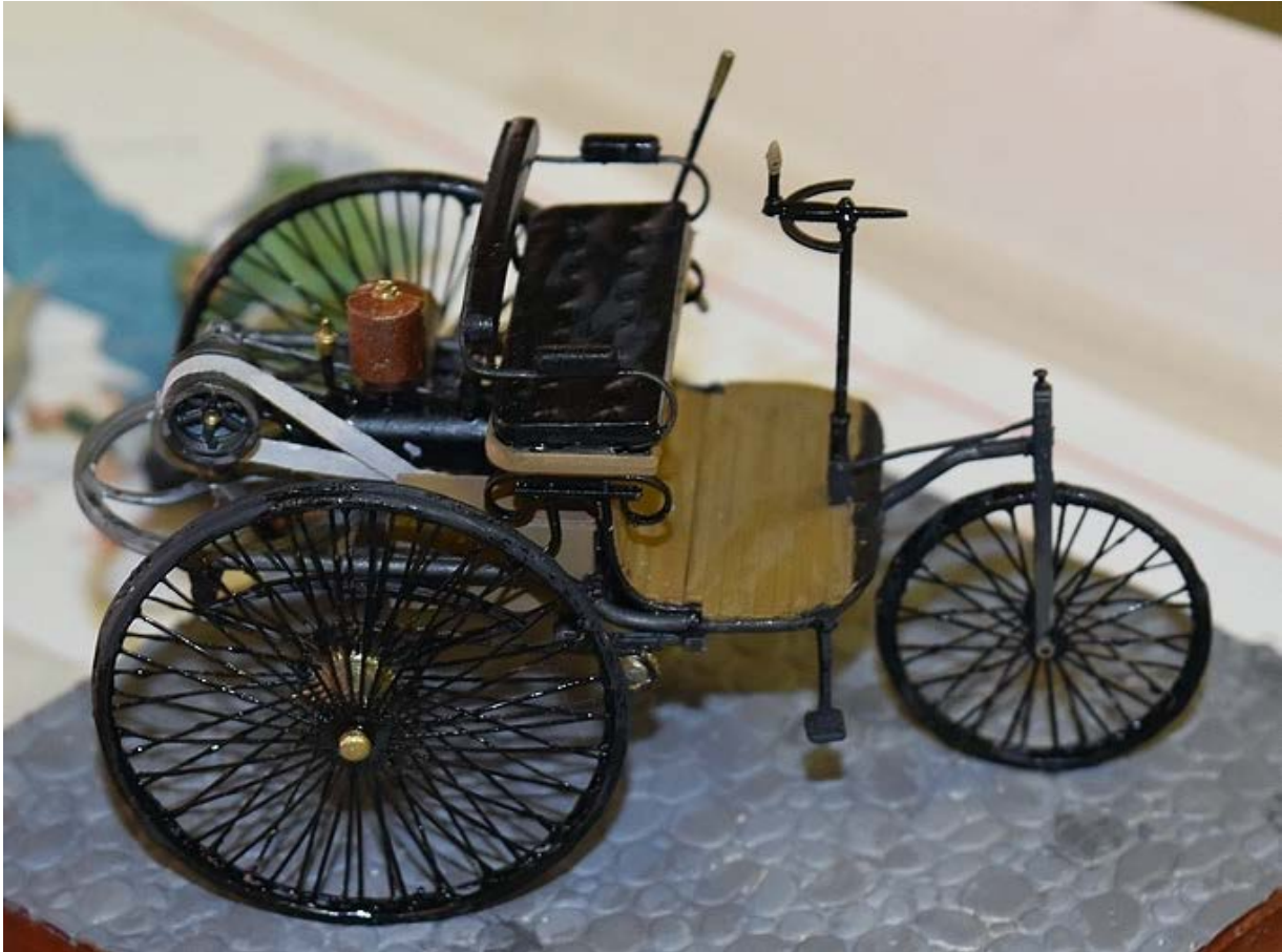
Another View of Art's Model of th Benz Motor Car