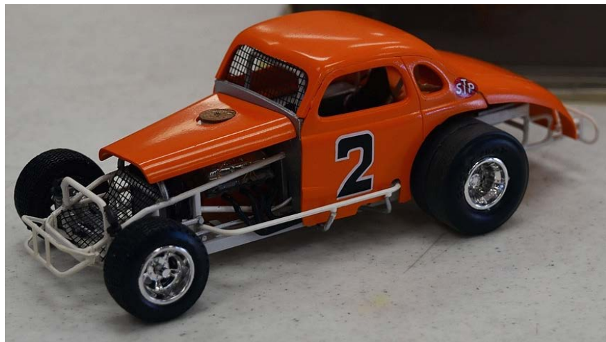
Hector's auto different view