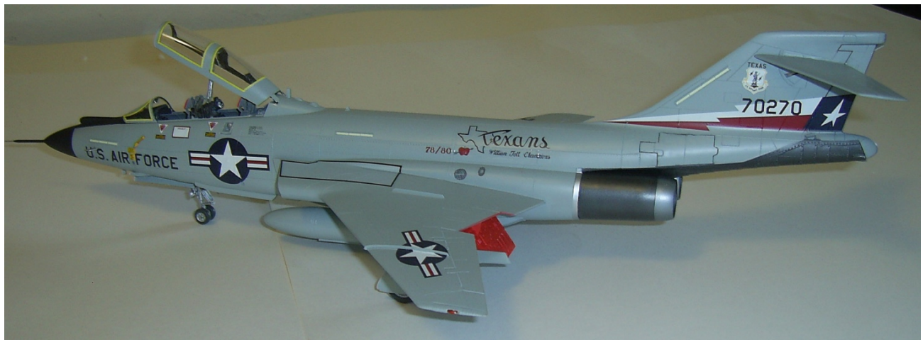
Jerry Richardson's F-101B Voodoo.

Arthur Berwick had several Historex figures to show. If you are not familiar with the Historex Line, each individual figure comes with several parts so that you can pose the figure. Multiple arms and legs are offered to the modeler. Also, Historex includes a choice of rank, chapeaus, arms and swords in some cases. There might be two or three types of uniforms that can be modeled, full dress, marching order or walking out attire. In each package, there is usually a color card with several different figures that can be built from the kit. Arthur has posed several of the figures into vignettes as presented on the color card.