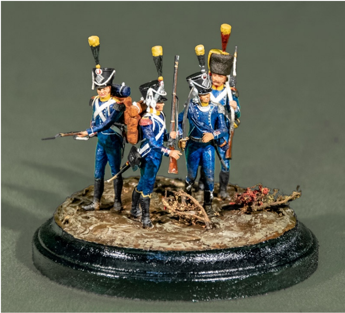
Arthur Berwick's Voltigeurs French Light Infantry.