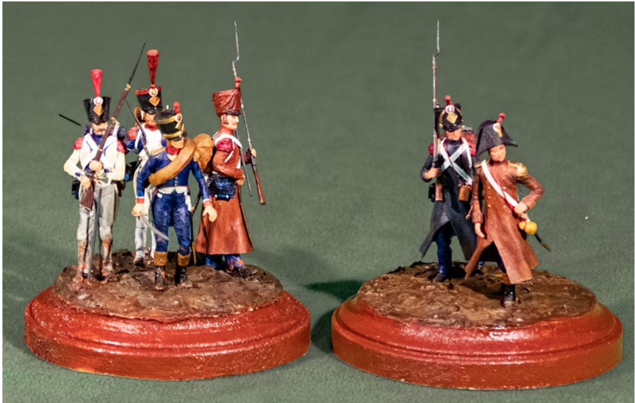
Arthur Berwick's French Line Grenadiers.