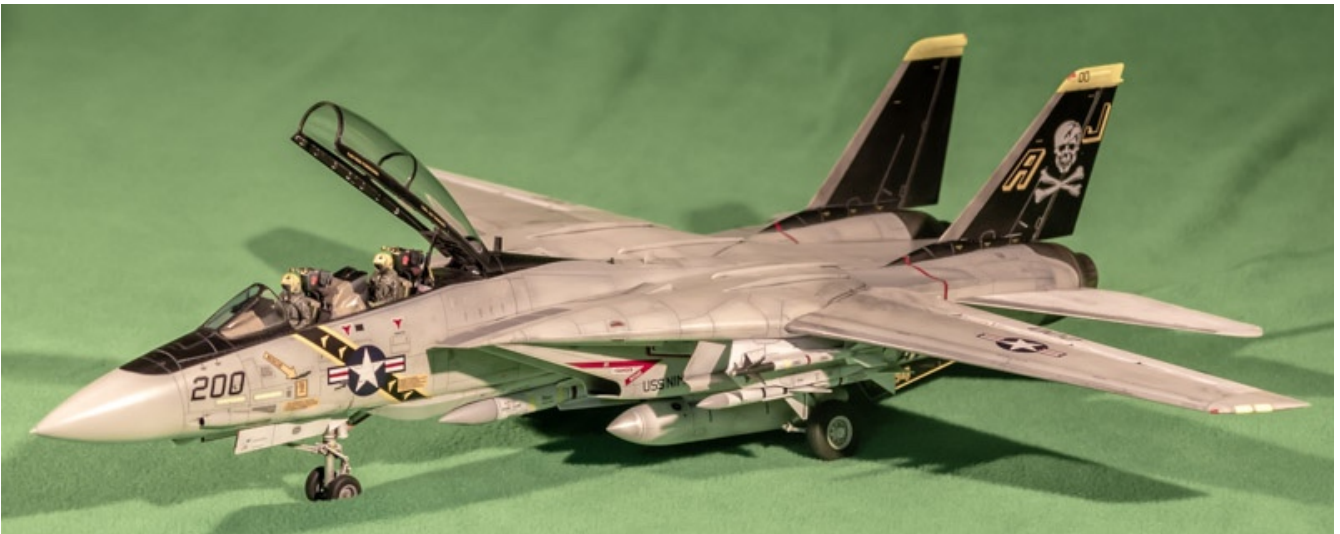
Kenyon Souflee's F-14.