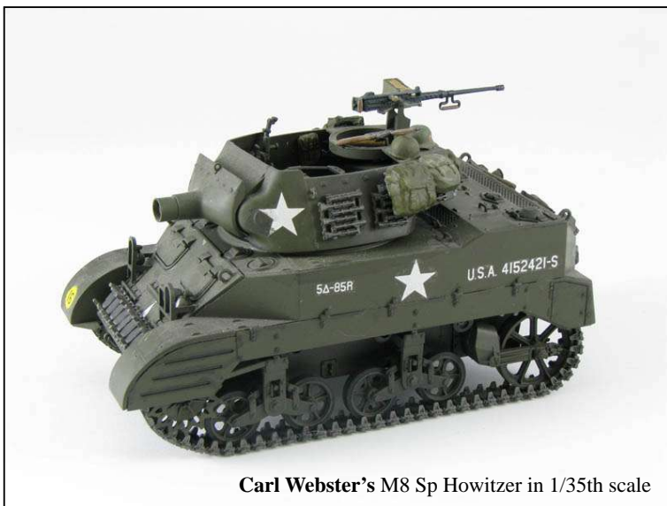
Carl Webster's M8 Sp Howitzer in 1/35th scale