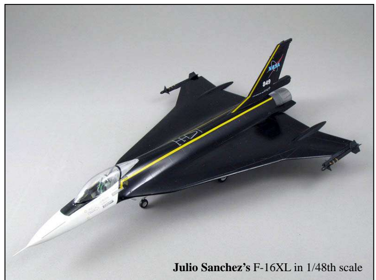
Julio Sanchez's F-16XL in 1/48th scale