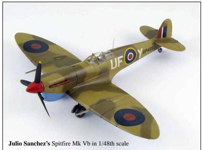
Julio Sanchez's Spitfire Mk Vb in 1/48th scale