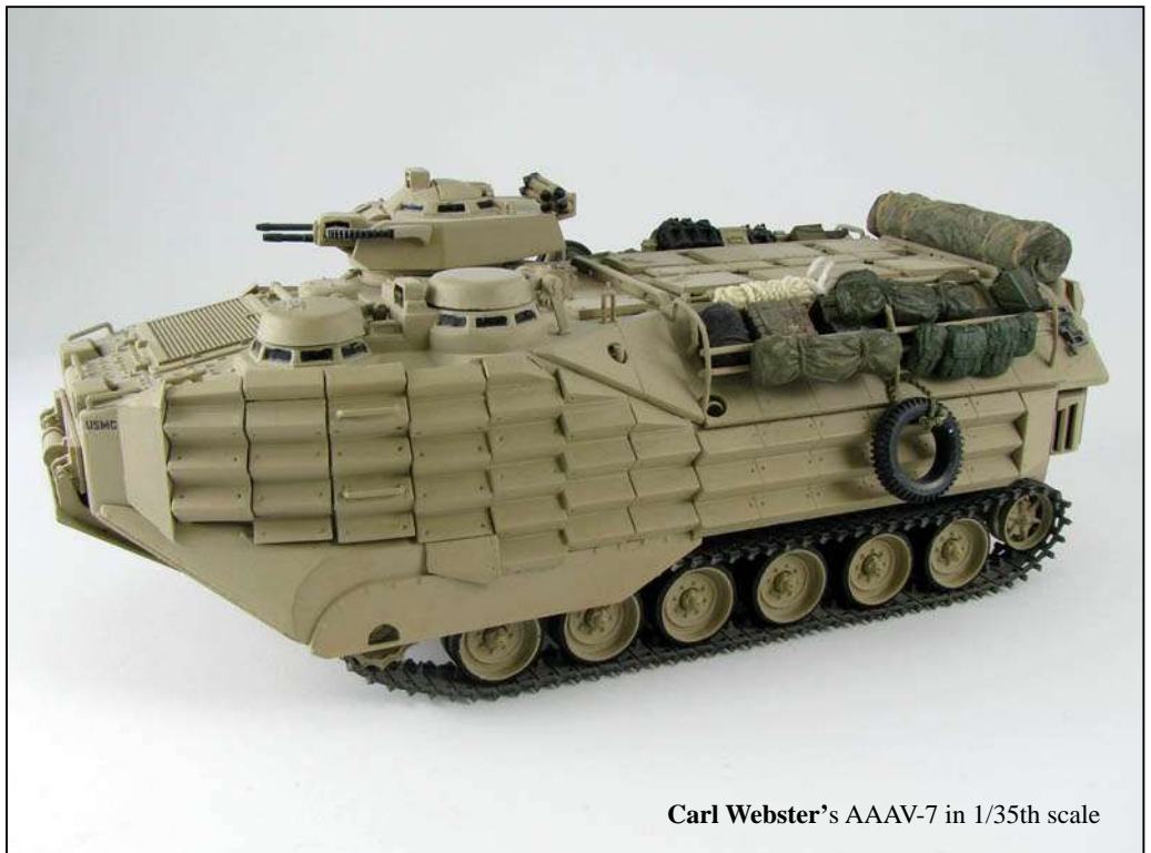
Carl Webster's AAV-7 in 1/35th scale