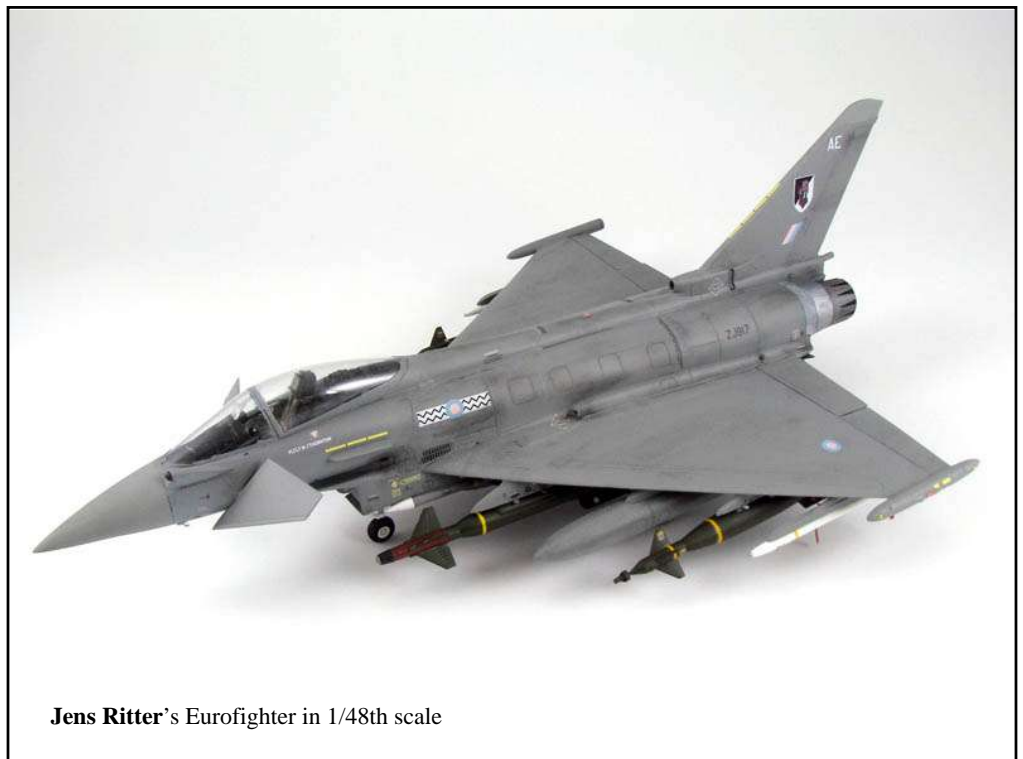
Jens Ritter's Eurofighter in 1/48th scale