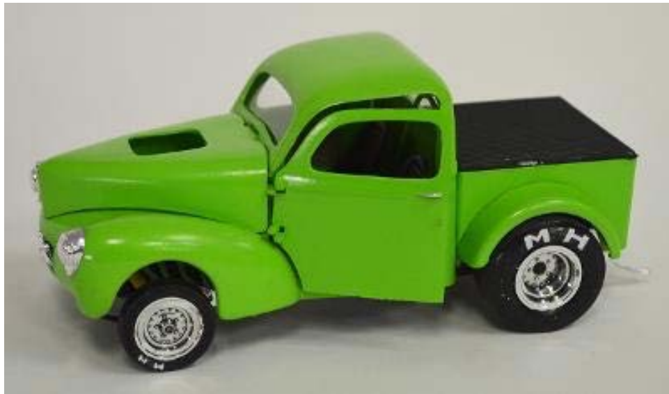
Hector Gonzalez's 41 Willy's Pickup

The Chevy was a 1/24 th scale AMT kit. Hector replaced the tires. The Willy's pickup was built from a Monogram 1/24 th scale kit. This model was salvaged as it had been started and Hector had to do some modifications in order to finish the model.