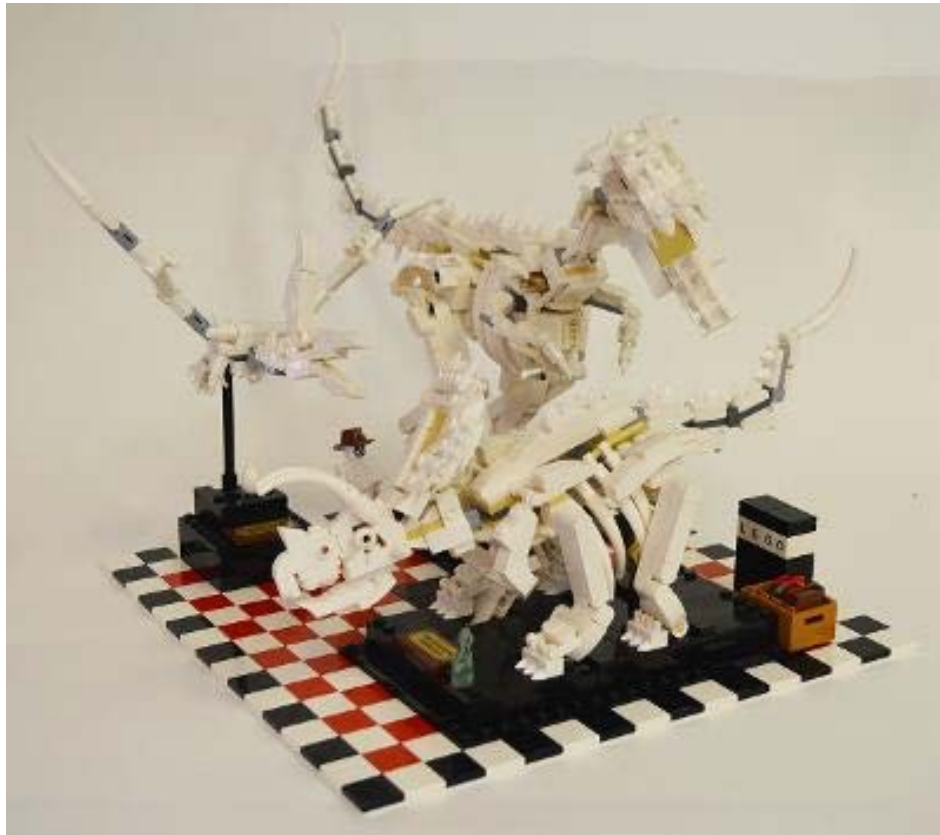
Dixi Fischer's Three Fossil Dinosaurs Lego Kit

I have very little information on gliders/sail planes used by Germany in WW II. Thus, I was unable to locate information for the model on the right. My guess it is a Messerschmitt pre-WWII training glider.