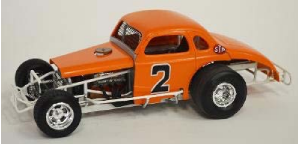
Hector Gonzalez's 37 Chevy