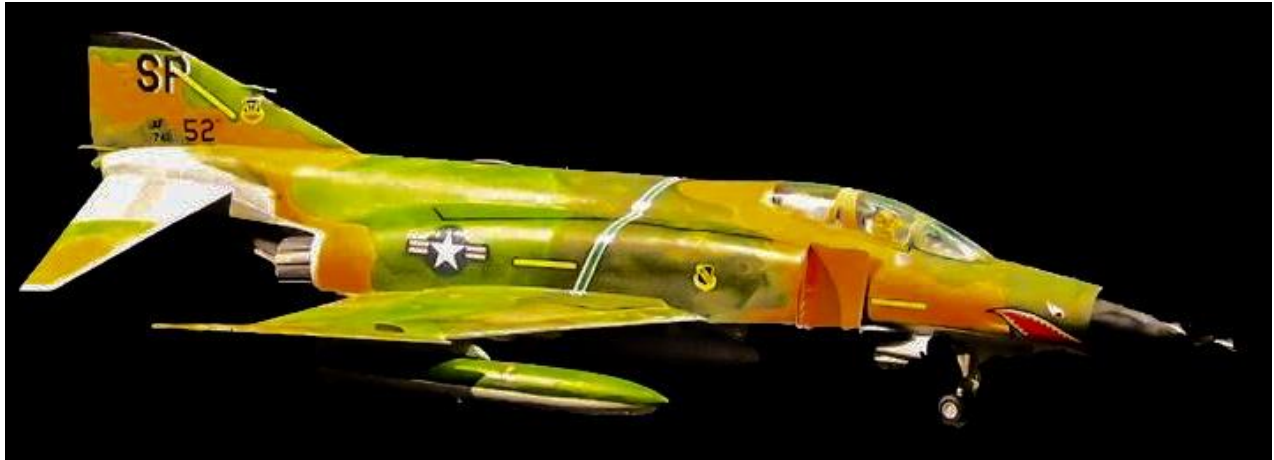
Phoenix Villa's F4E