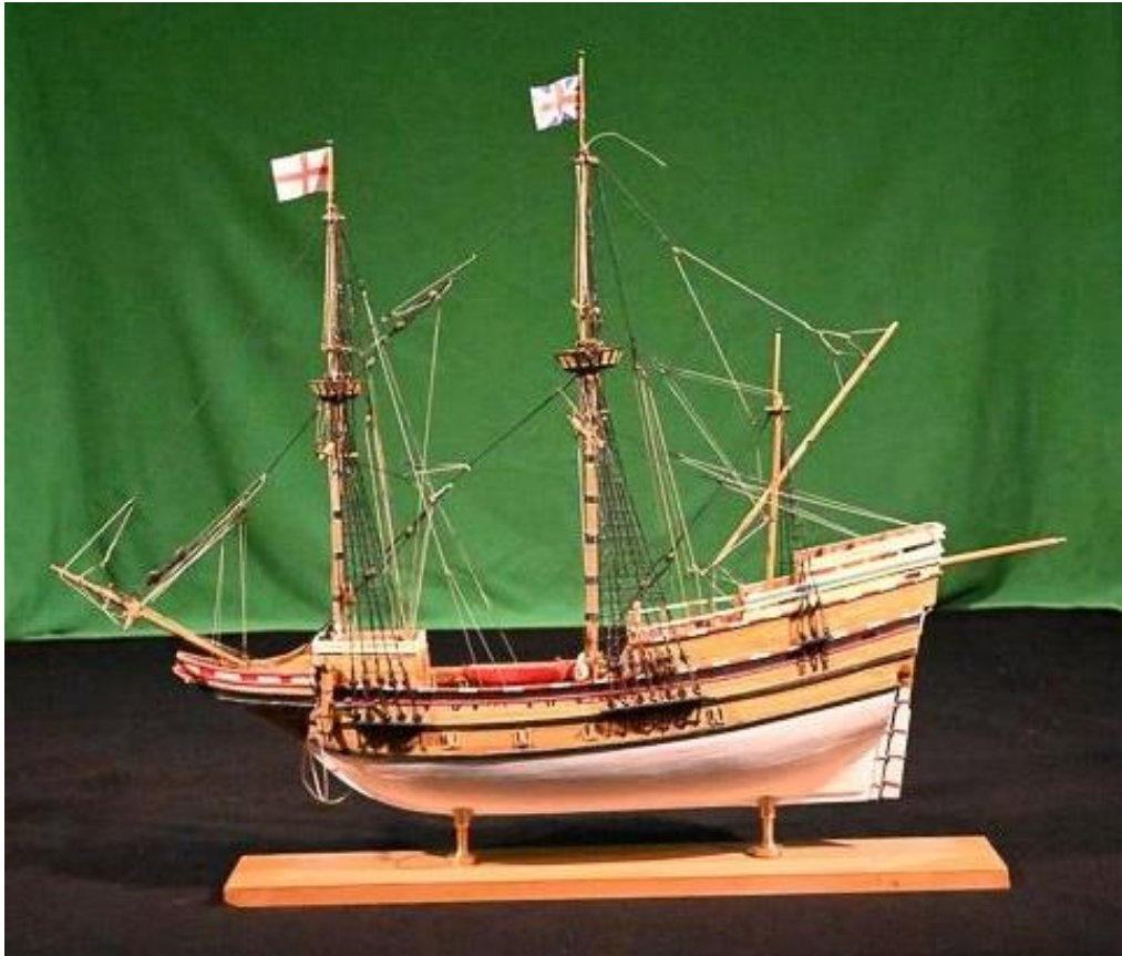
Steve Herren's Mayflower

I have been working on an Airfix B-17G. The kit is done for the European market with a great of interior detail that will be covered and unseen when the model is built. The Airfix Lancasters, and C-47's in 1/72nd scale also have a lot interior detail that will not be seen on completion.