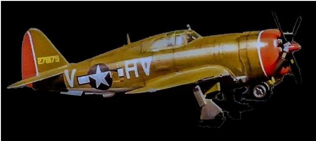
Phoenix Villa's P-47D