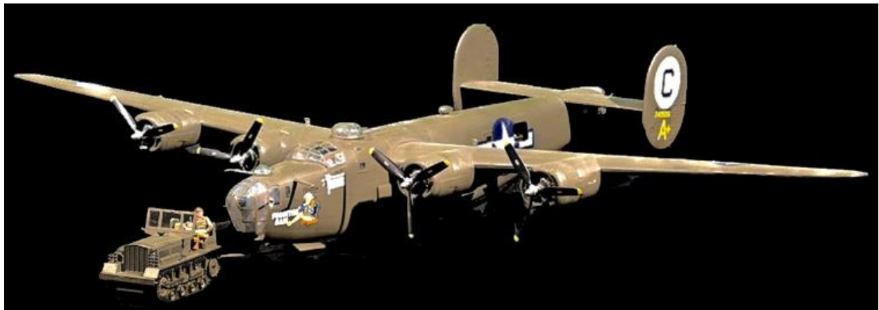
Tommy Delgado's B-24 and tow tractor