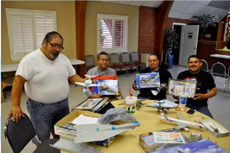
A table full of Models and Modellers