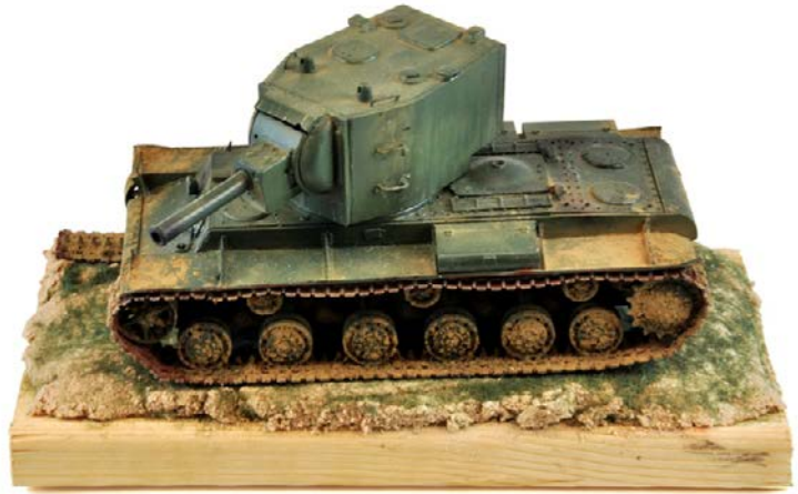
KV-2 Tank in 1/35th scale by Sal Samaniego