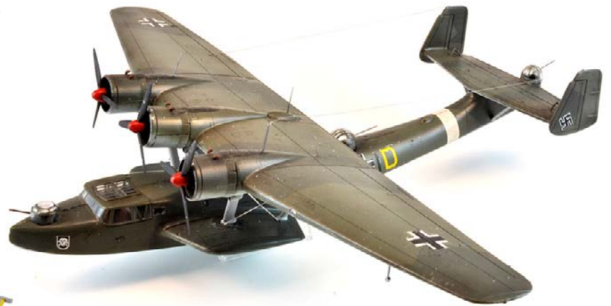
Carlos Delgado's Dornier Do-24 in 1/72nd scale