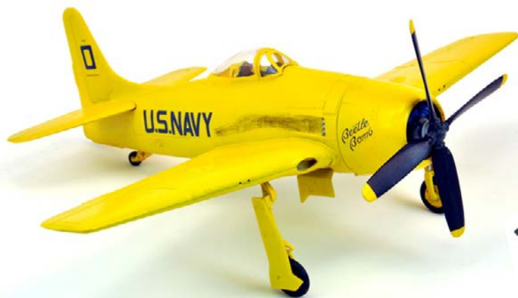
Richard Macias' 1/48th scale F8F Bearcats "Beetle Bomb" and "Blue Angles"