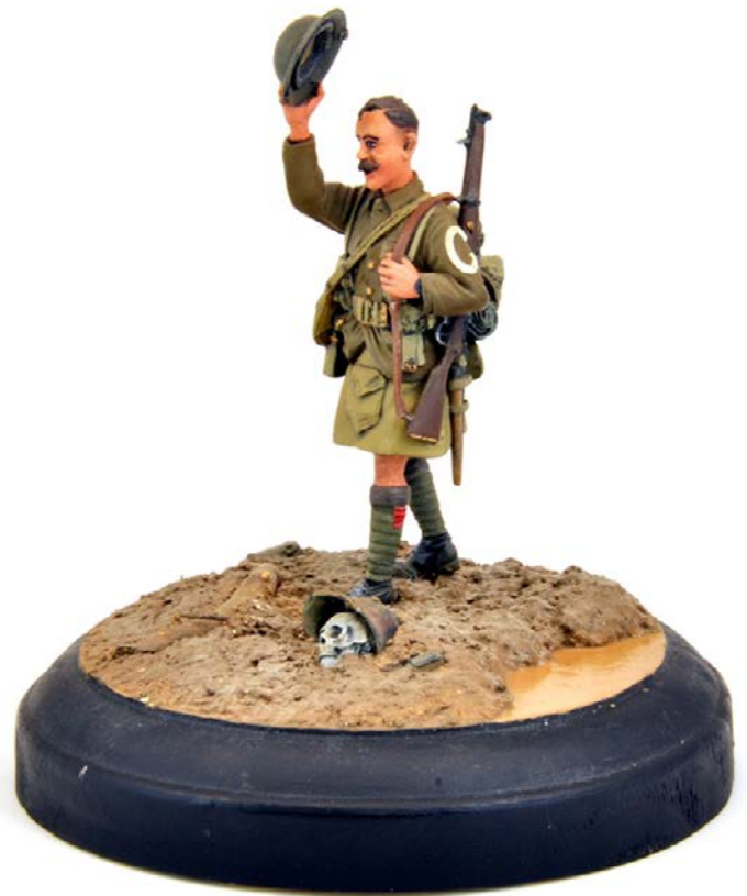
David Torres' 80mm Fusilier Seaforth Highlander