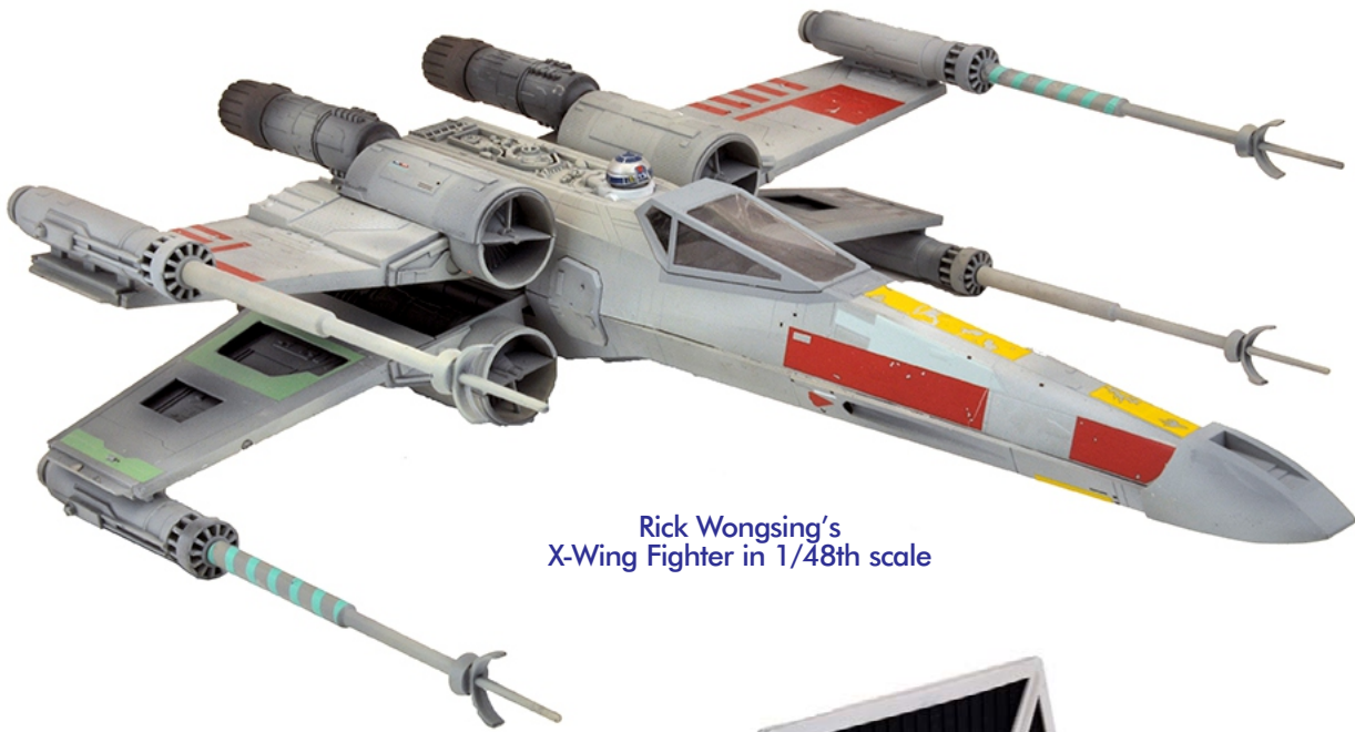
Rick Wongsing's X-Wing Fighter in 1/48th scale