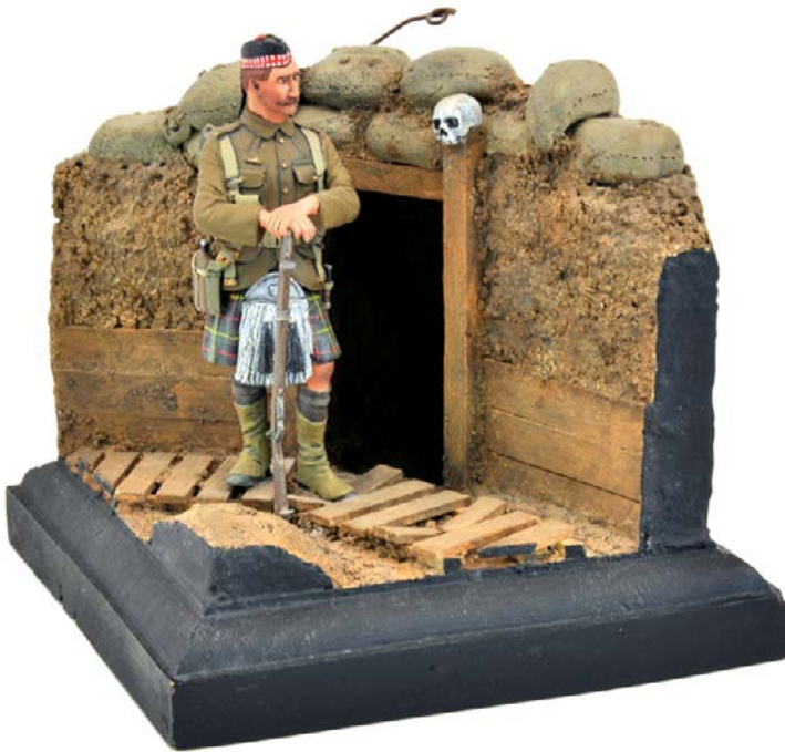
David Torres' 80mm Fusilier Black Watch 42nd Rgmt Highlander.