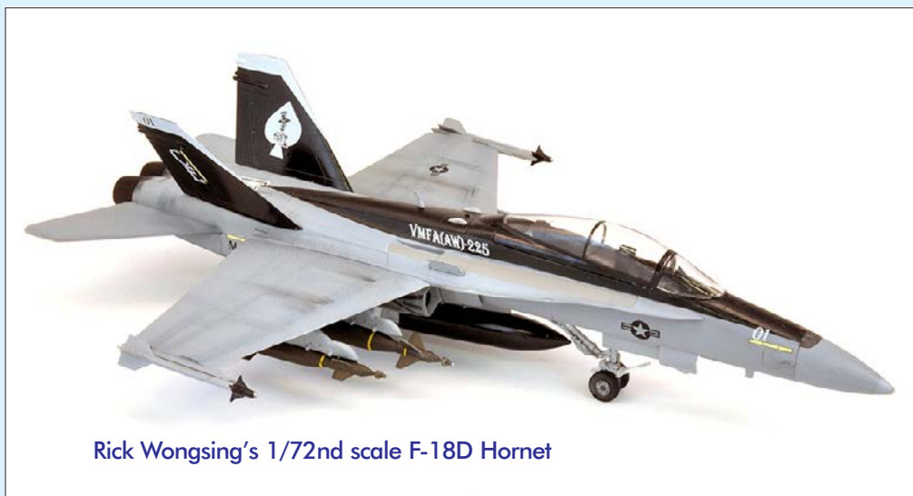
Rick Wongsing's 1/72nd scale F-18D Hornet

Clifford Bossie had a 1/350th scale USS Von Steuben SSBN-632 built from the MikroMir kit. It is great to see Cliff bring a finished model.