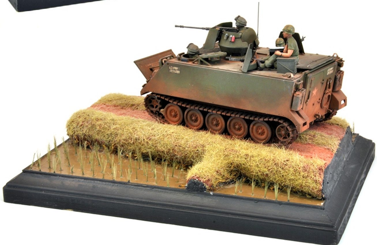
David Torres' 1/35th scale M113 with Verlinden figures