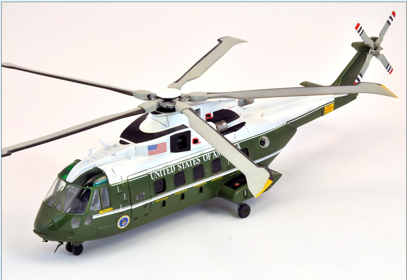
1/72nd scale H-61 by Mike King