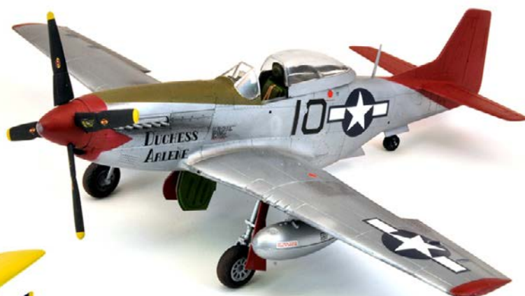
Rick Wongsing's P-51D in 1/72nd scale.