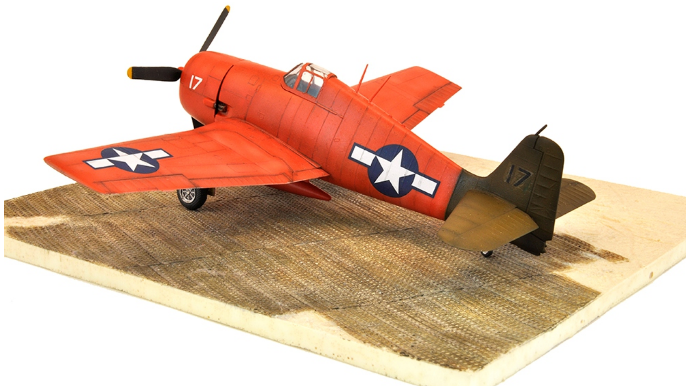
Mike King's F6F-5K drone in 1/72nd scale