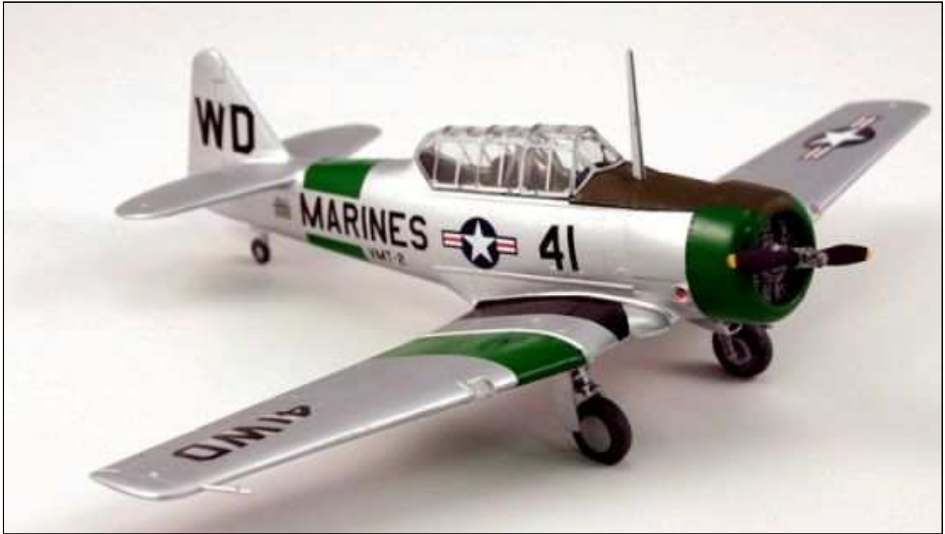
The Monogram kit in 1/48 th scale