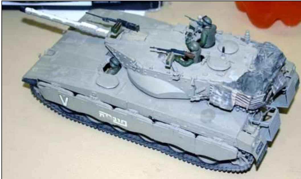
Carl Webster's Merkava IV in 1/35 th scale.

Carl did not fill out the paper work, but this the Academy kit in 1/35 th scale.