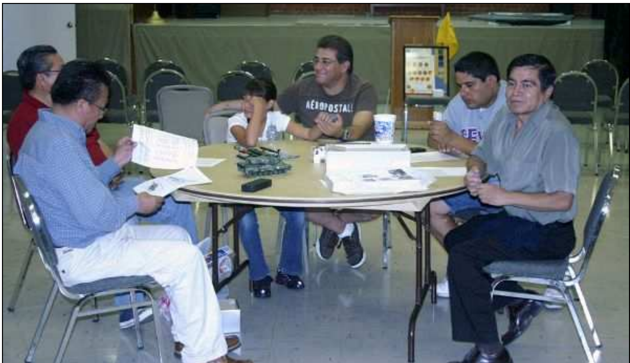
Planning for the Bassett Show?? Shooting the Bull?