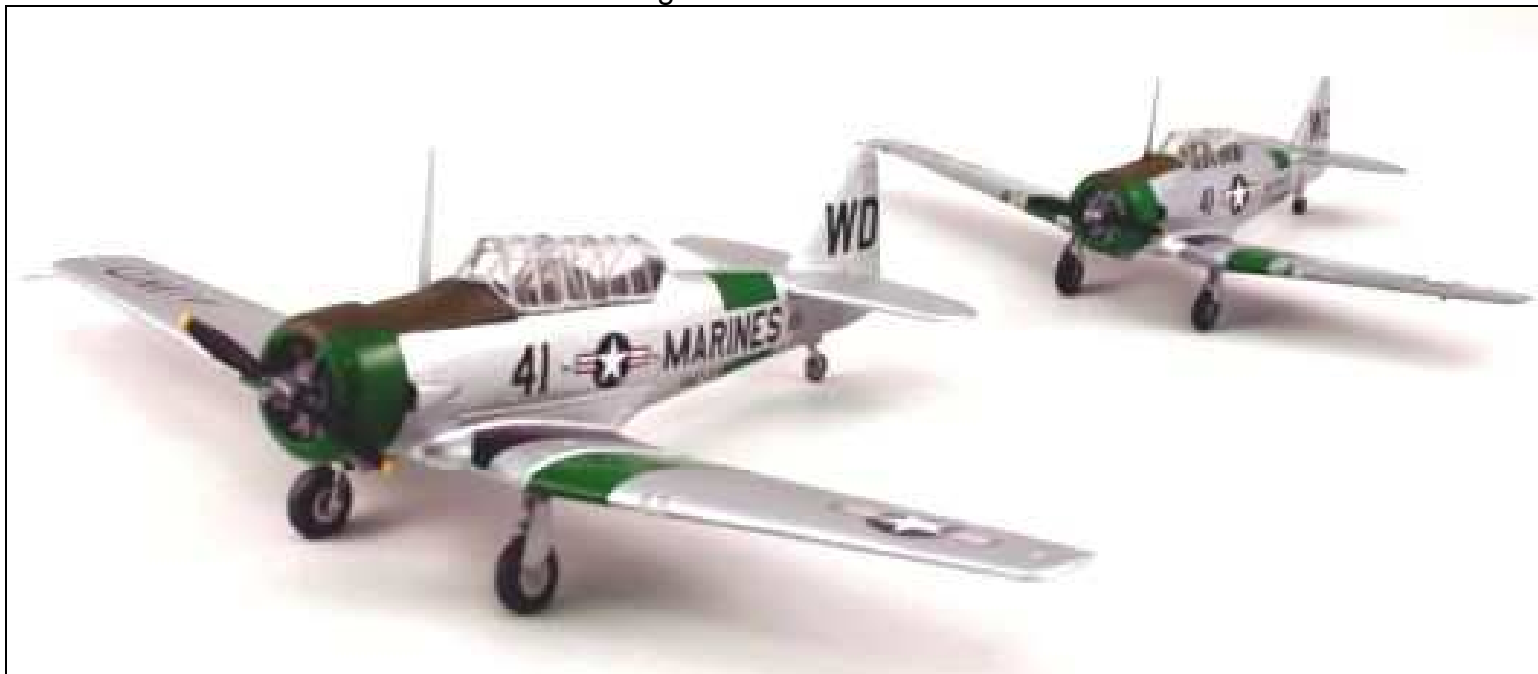
Both kits in one photo.