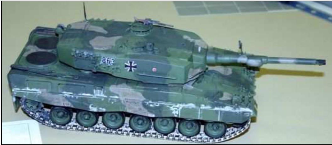
Carlos Mendoza's Leopard tank in 1/35 th scale.