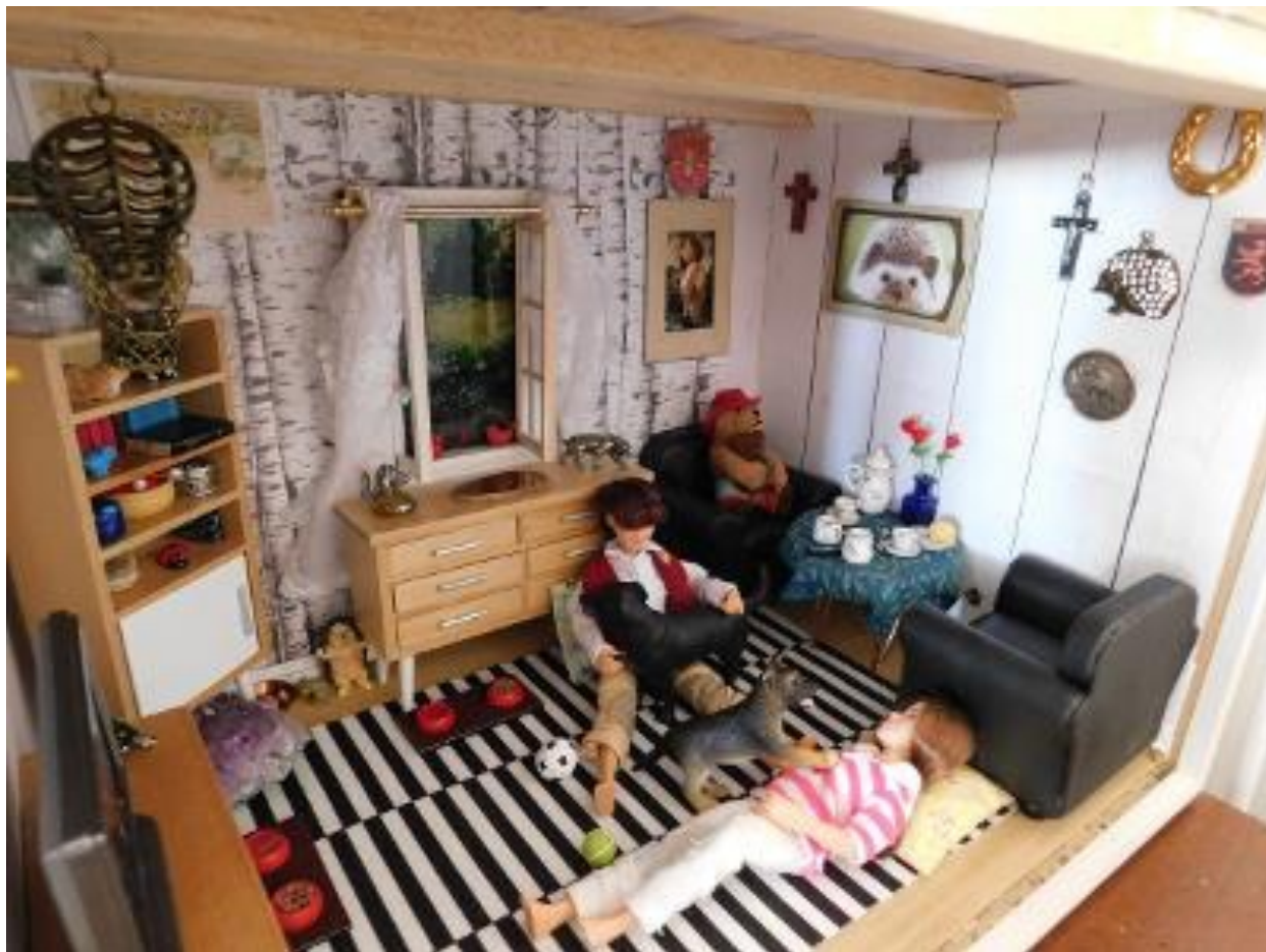
Dixi Fischer's Hanging Out at Home

A reminder, Hal's is open from 11 to 5 but closed on Sundays.