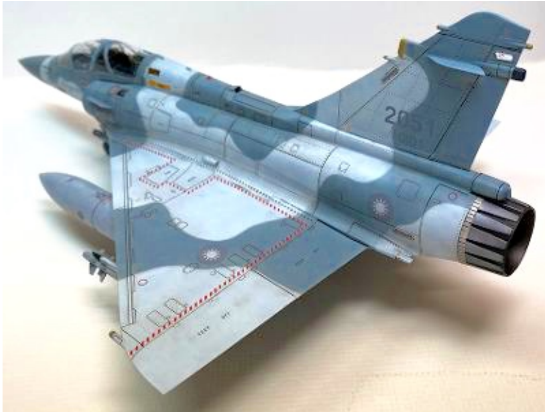
Another view of Rodney Roger's Mirage 2000