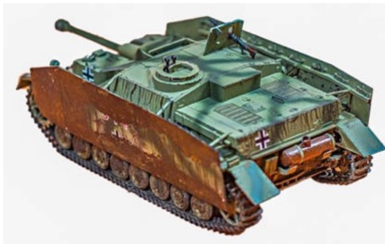
Sal's Stug III in 1/35 th scale

Salvador Samaniego had a 1/35 th scale Sturmgeschutz III and a 1/35 th scale Tiger I with full interior. For this model Sal used a turned metal gun barrel and Frivmodel metal tracks. Very nice.