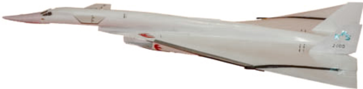
Kimminator 1