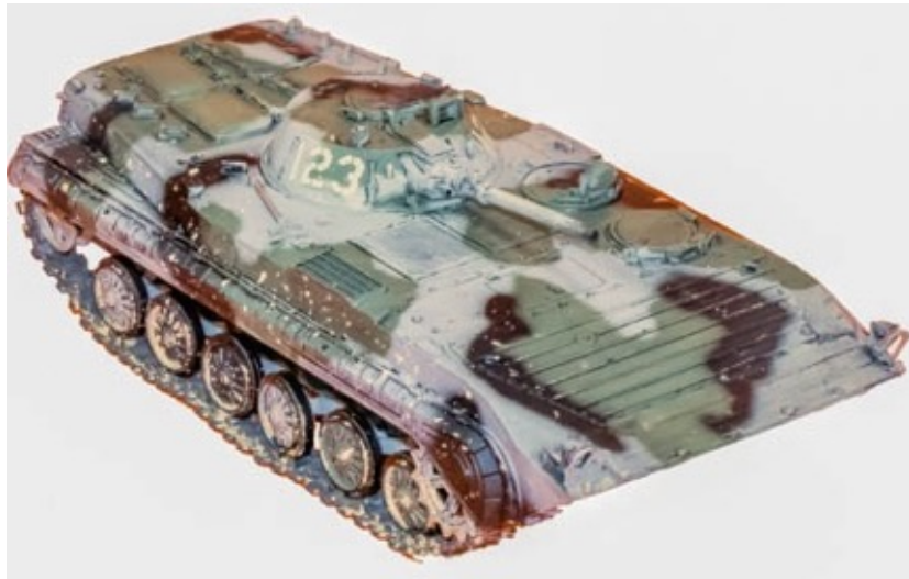
BMP-1 built from the Dragon kit in 1/35 th scale.

The first pic has From: Right to Left: Shego's Ride, It's Possible Citation, Kimminator 1, Kim's and Shego's Work Ride, Kimminator concept, Batplane and My Favorite Martian Ship.