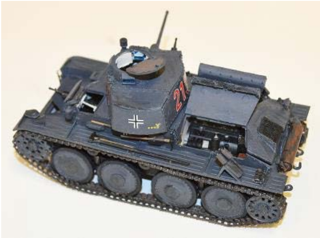
Arthur Burdick's Pz.Kpfw. / Pz.BfWg 38(t) Ausf. B,