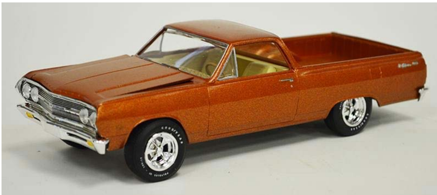
Hector Gonzalez's El Camino

Conrad and Bernie McCune have been working to promote an interest with the EAA group to set up a model display at the airport in Las Cruces.