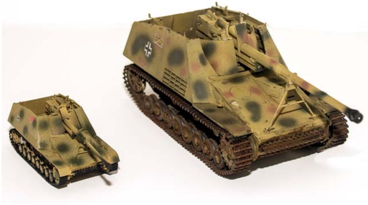
Sal Samaniego' "Nashorn" 88mm SP guns