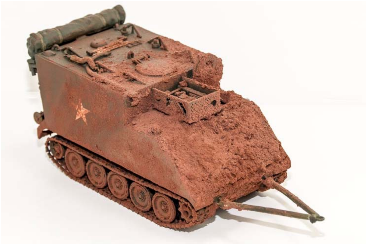
Carl Webster's M577 1/35 th scale