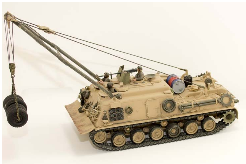
Cal Webster's M88 1/35 th scale

Remember, if you do not want the forwarded newsletters, just delete them, the same with the GLUE. I do the best I can but some cannot download what I send. I have no idea why it is difficult or not possible to download what I send. There is a free site called Open Office that will provide a system that I have used in the past to open difficult items.