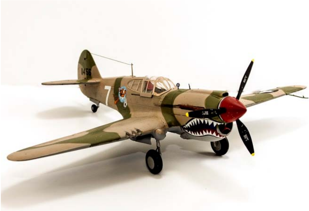
Carlos Delgado's 1/32 nd scale P-40E