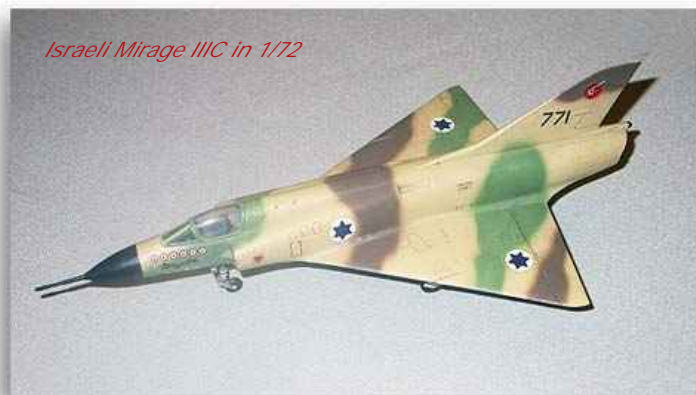
Israeli Mirage IIIC in 1/72