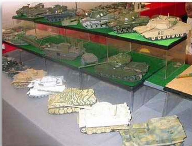
Part of the 1/35 armor by Roy Lingle