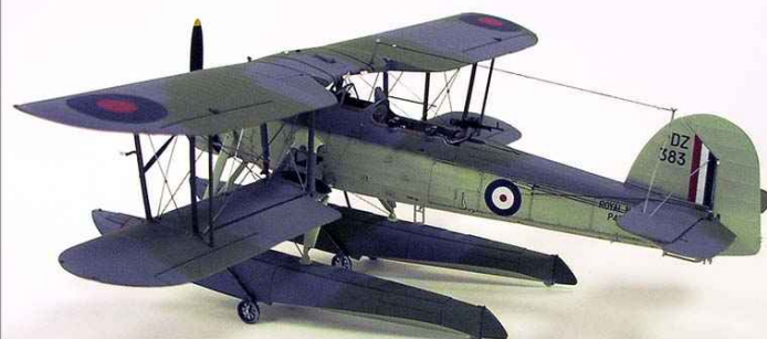
another view of the Swordfish