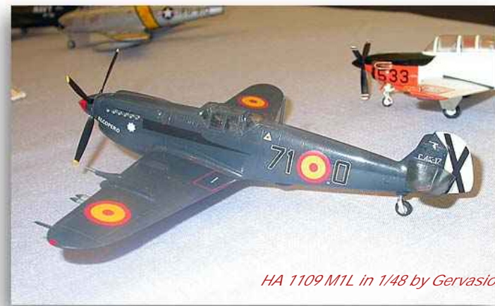
HA 1109 M1L in 1/48 by Gervasio