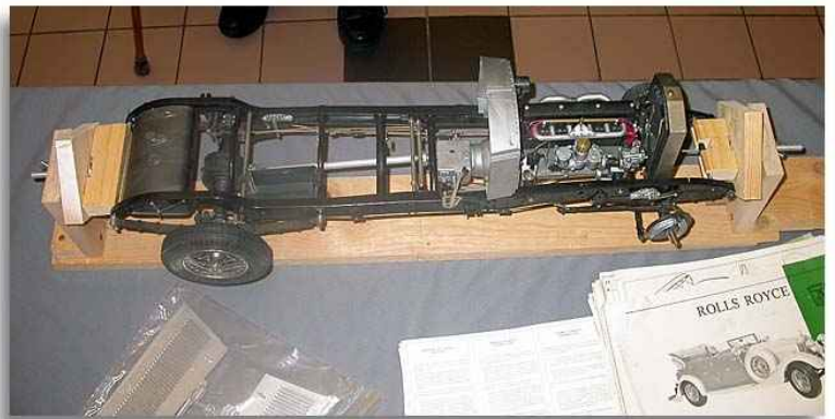
Rolls Royce kit from Pocher displayed by Dave Ross