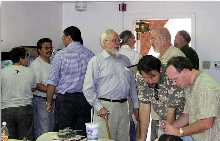
a typical scene from our meeting