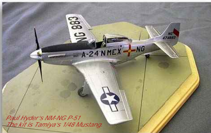
Paul Hyder's NM-NG P-51 The kit is Tamiya's 1/48 Mustang.