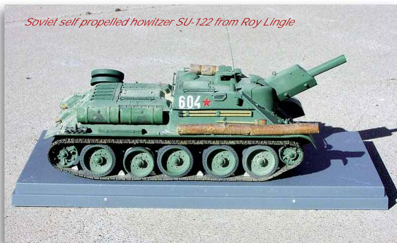
Soviet self propelled howitzer SU-122 from Roy Lingle