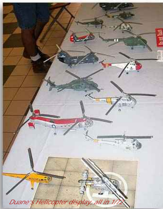
Duane's Helicopter display, all in 1/72