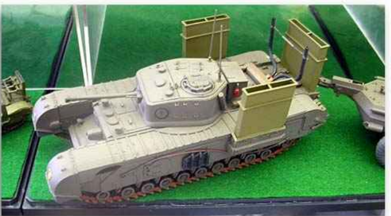
wading Churchill by Roy Lingle