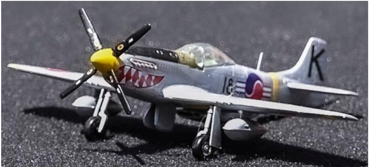
Phoenix Villa's F-51