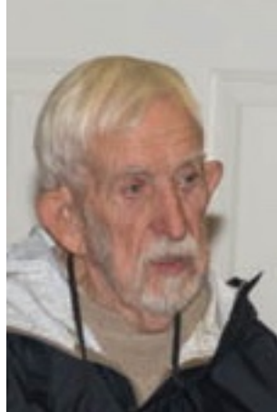
John Paul Jones