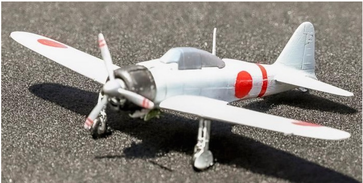
Phoenix Villa's A5M2 Type 0