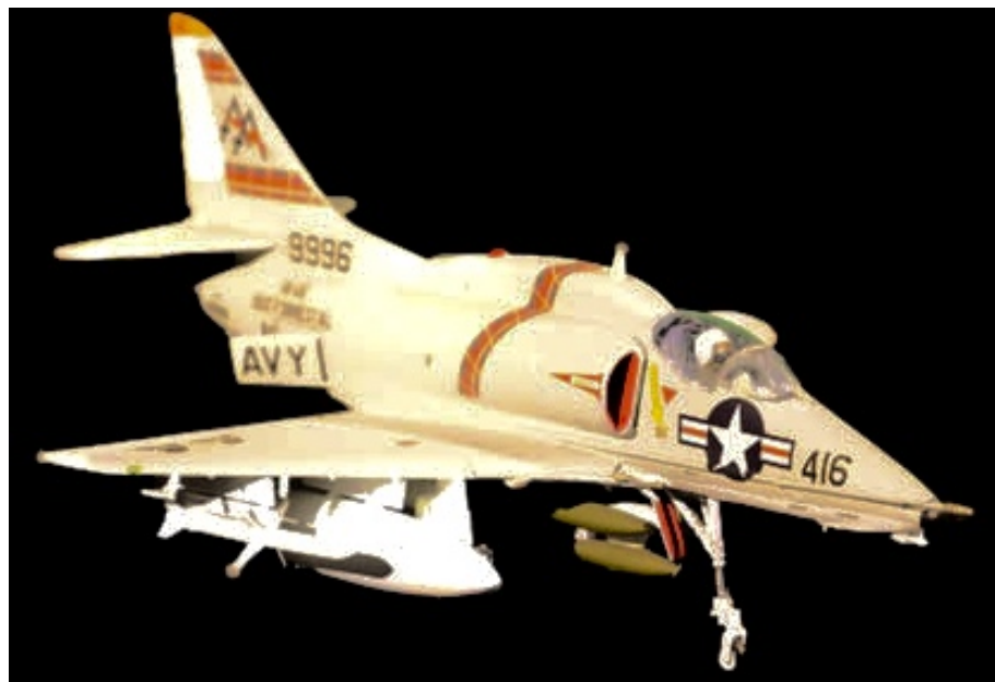
Tom Delgado's A-4 below