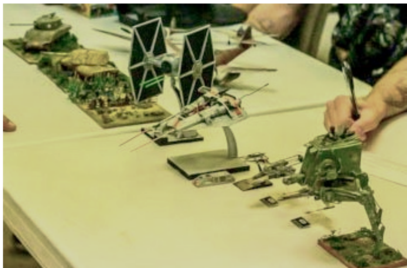
One last shot of the some of the models