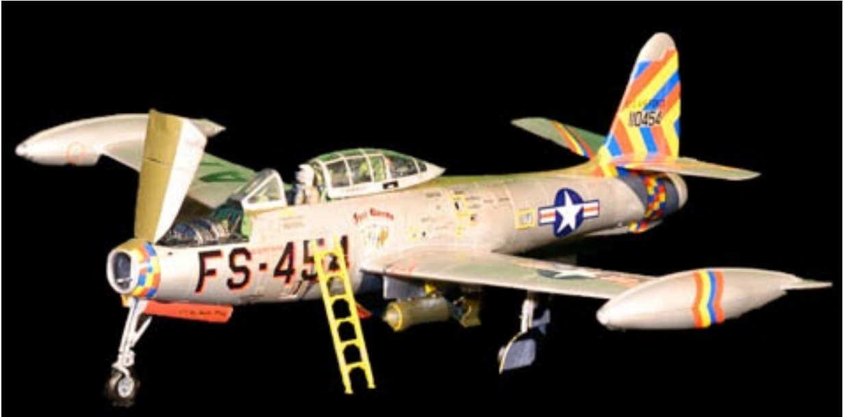
Phoenix Villa's F-84