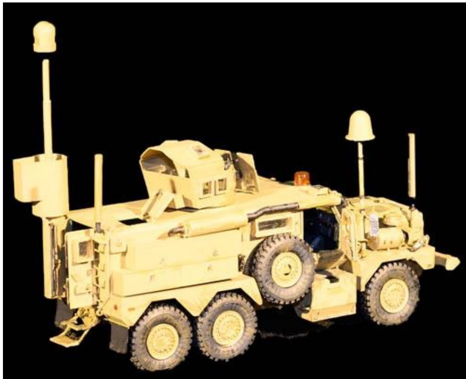
Art Berdick's "Cougar" 6x6 E.O.D.