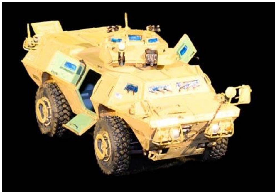
Art Berdick's M1117 Guardian