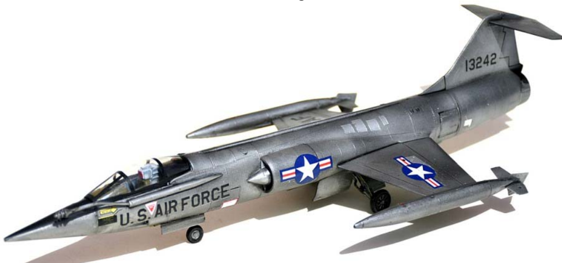
Carlos Delgado's ESCI 1/48 th scale F-104 Starfighter

Carlos Delgado had an ESCI 1/48 th scale F-104 Starfighter to show.