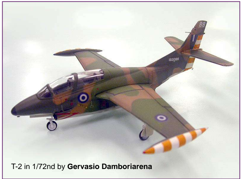
T-2 in 1/72nd by Gervasio Damboriarena