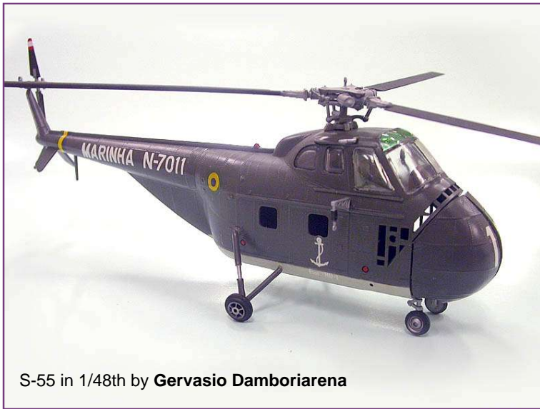
S-55 in 1/48th by Gervasio Damboriarena