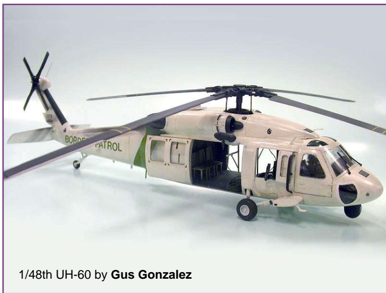
1/48th UH-60 by Gus Gonzalez