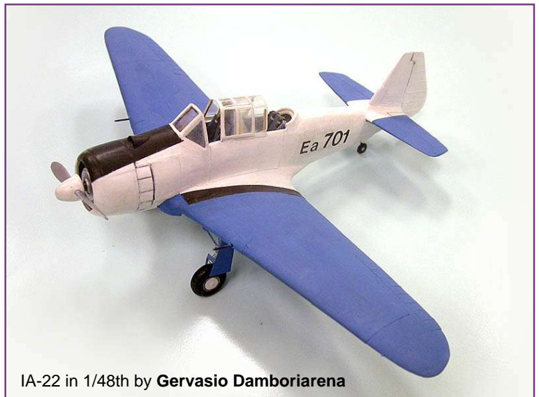
IA-22 in 1/48th by Gervasio Damboriarena