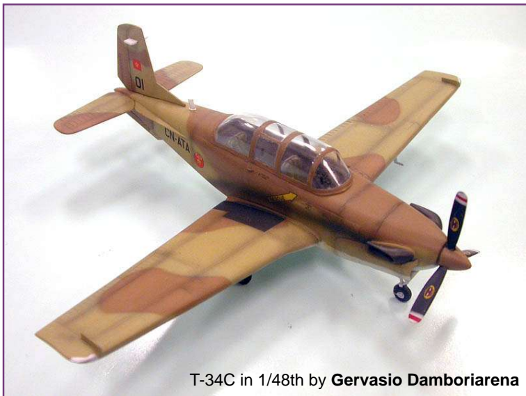
T-34C in 1/48th by Gervasio Damboriarena