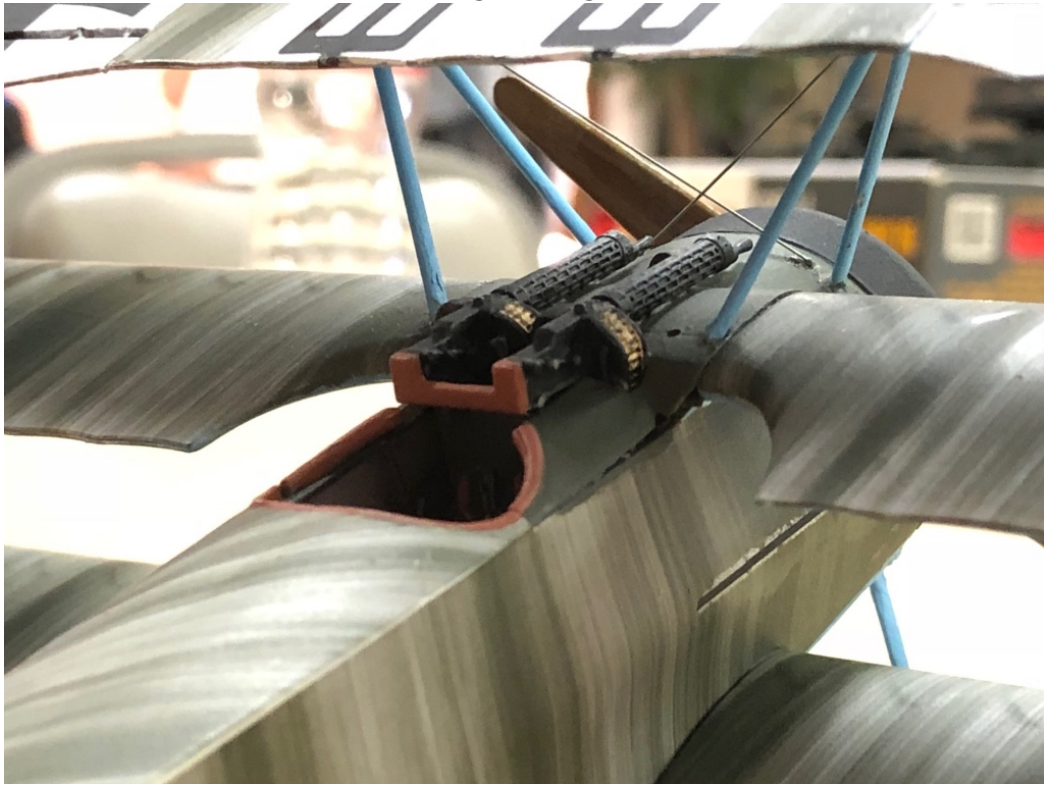
Detail of the DR1