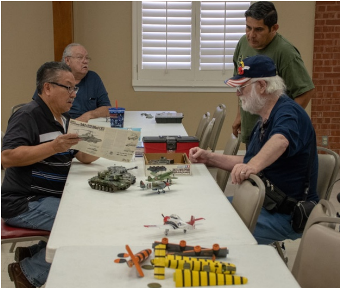
Discussion on building