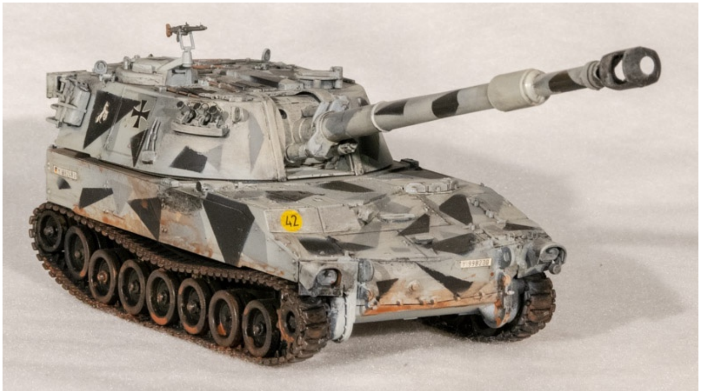
M109