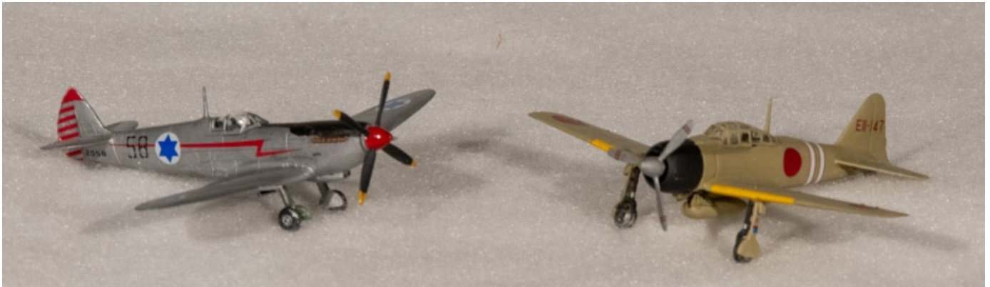
A couple by Charlie Flores