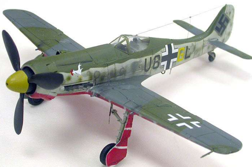
Carlos Delgado's Fw190D-11 in 1/48 scale