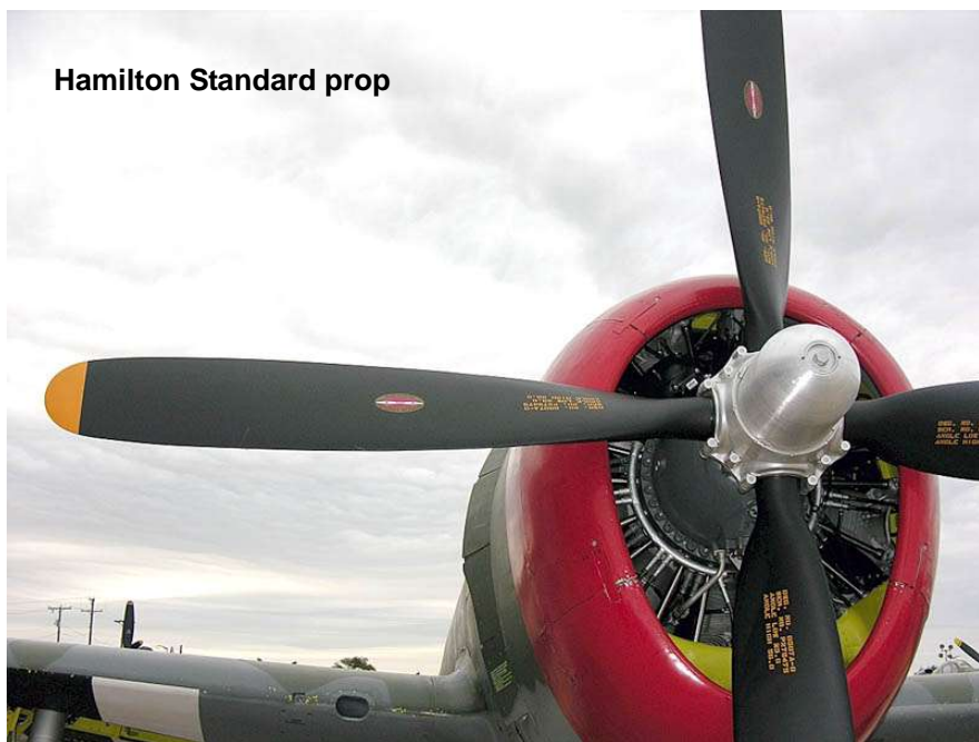
Hamilton Standard prop