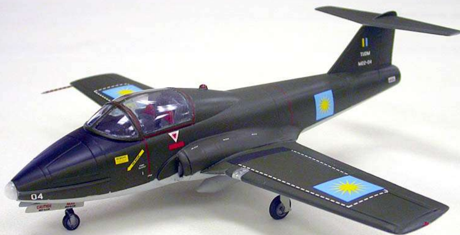
Gervasio Damboriarena's 1/48th Canadair CL-141 Tutor