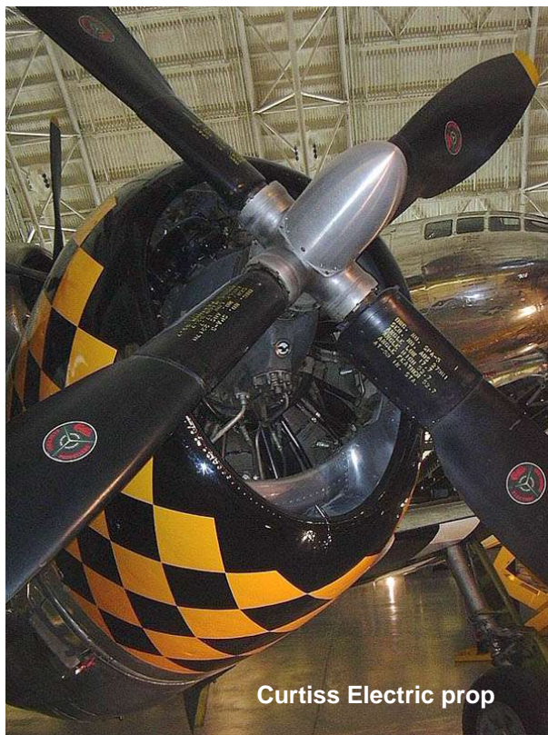
Curtiss Electric prop

piece. The gearbox cover is molded separately and is for the correct "B" series R-2800. The compressibility recovery flaps ("dive flaps") are molded onto the lower wing surfaces. Cockpit is