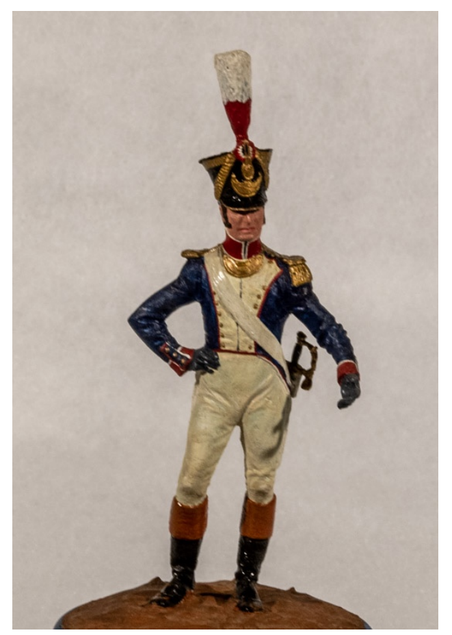
Arthur's Captain Line Infantry