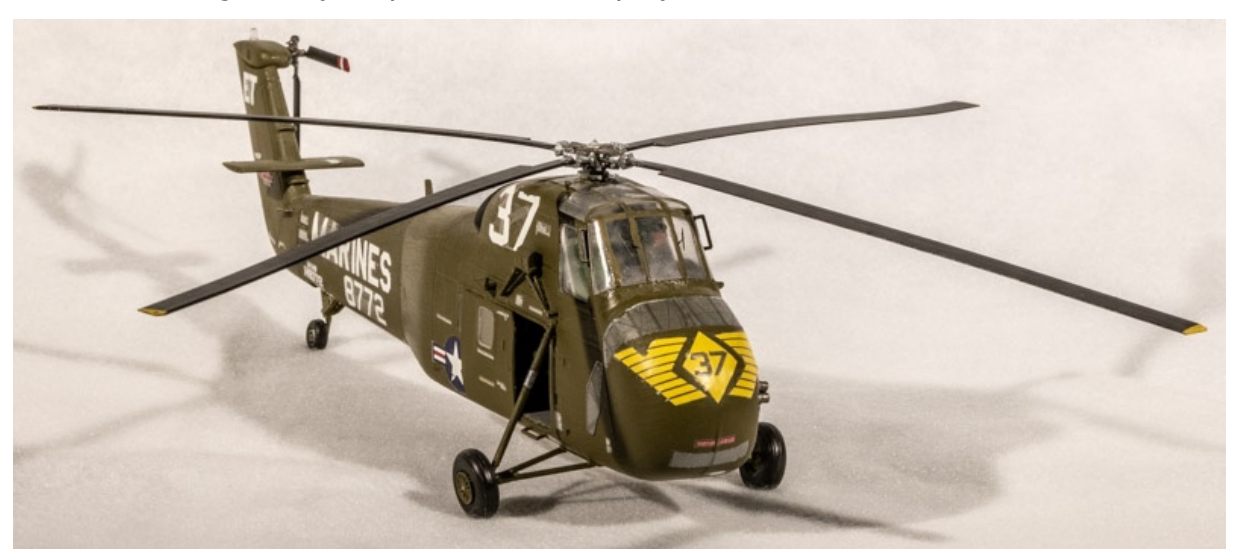
Tommy Delgado's SH-58 /UH-34D

Only four more meetings this year plus the two displays.