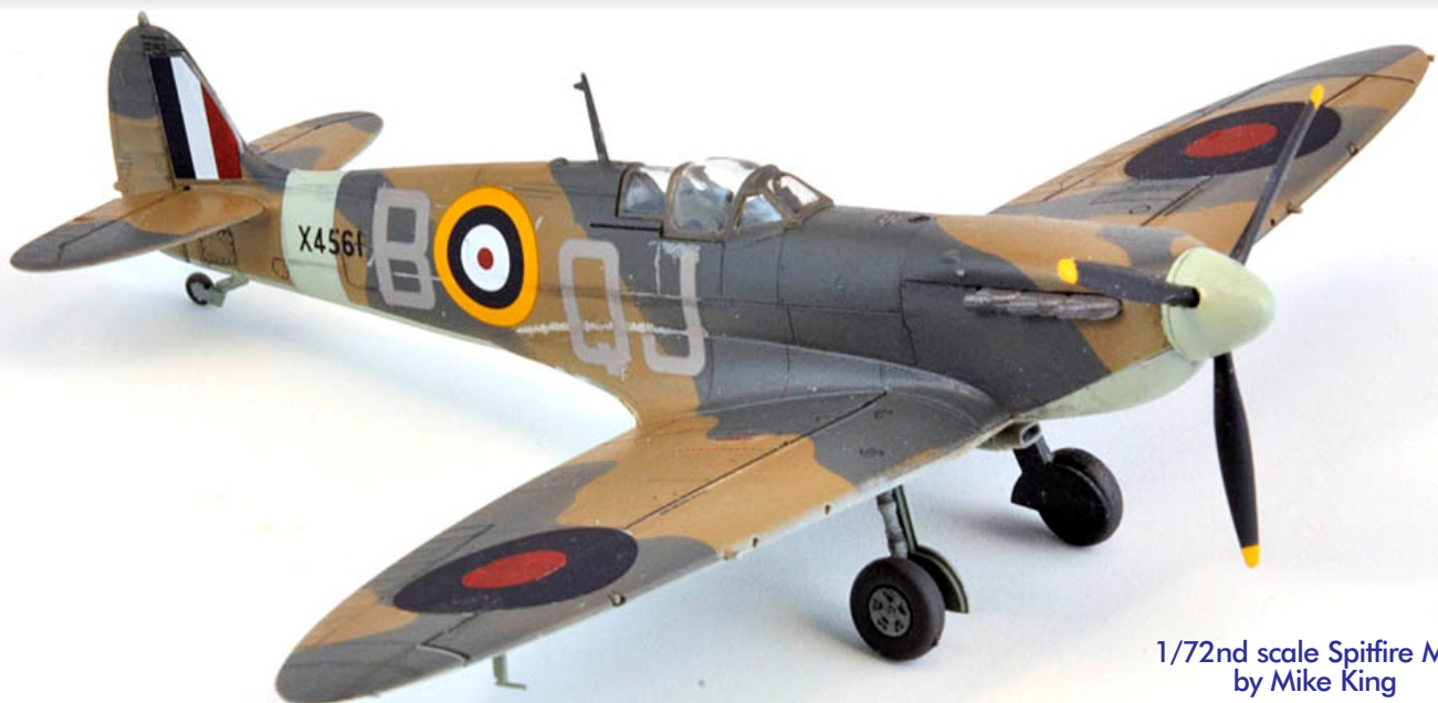
1/72nd scale Spitfire Mk.I by Mike King