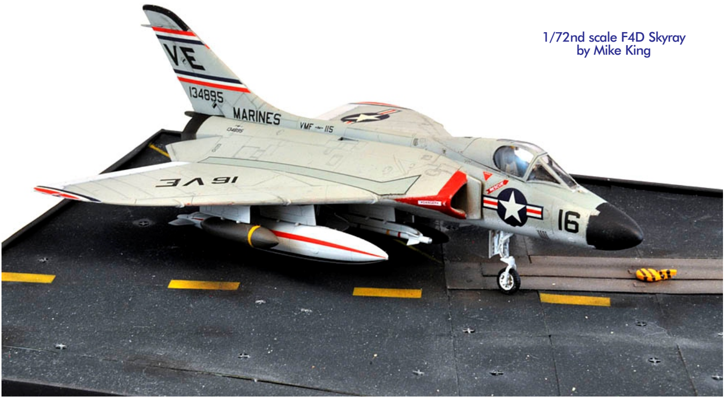
1/72nd scale F4D Skyray by Mike King