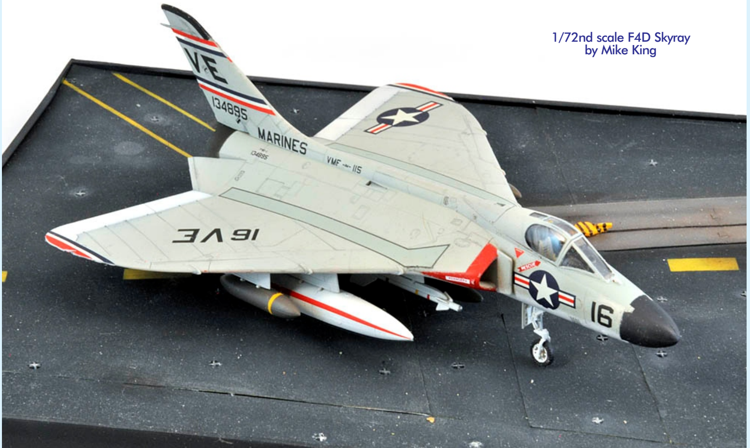
1/72nd scale F4D Skyray by Mike King