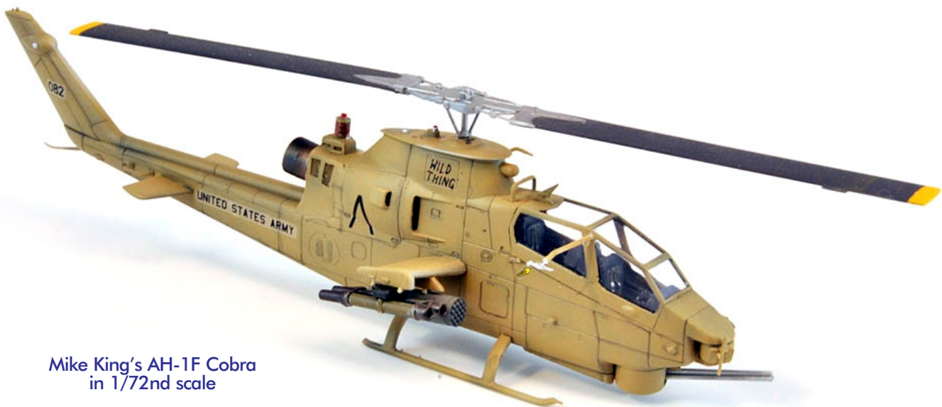
Mike King's AH-1F Cobra in 1/72nd scale